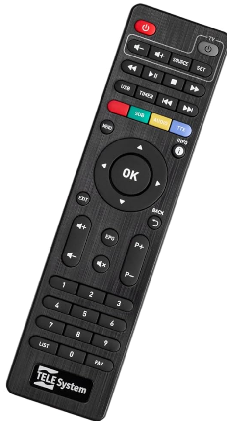
Image: The TELE System TS9019HEVC decoder, its remote control, and the included Tivùsat Smartcard.