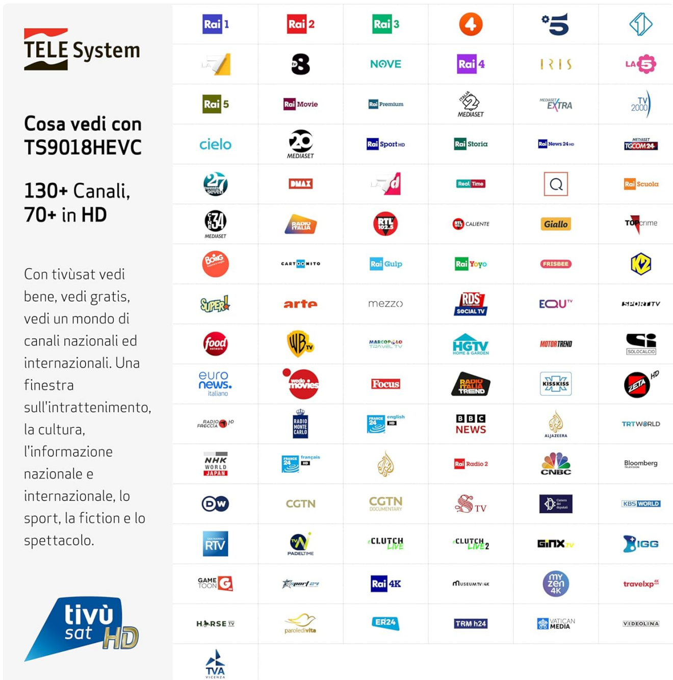
Image: Example of the channel list interface, displaying various Tivùsat channels.