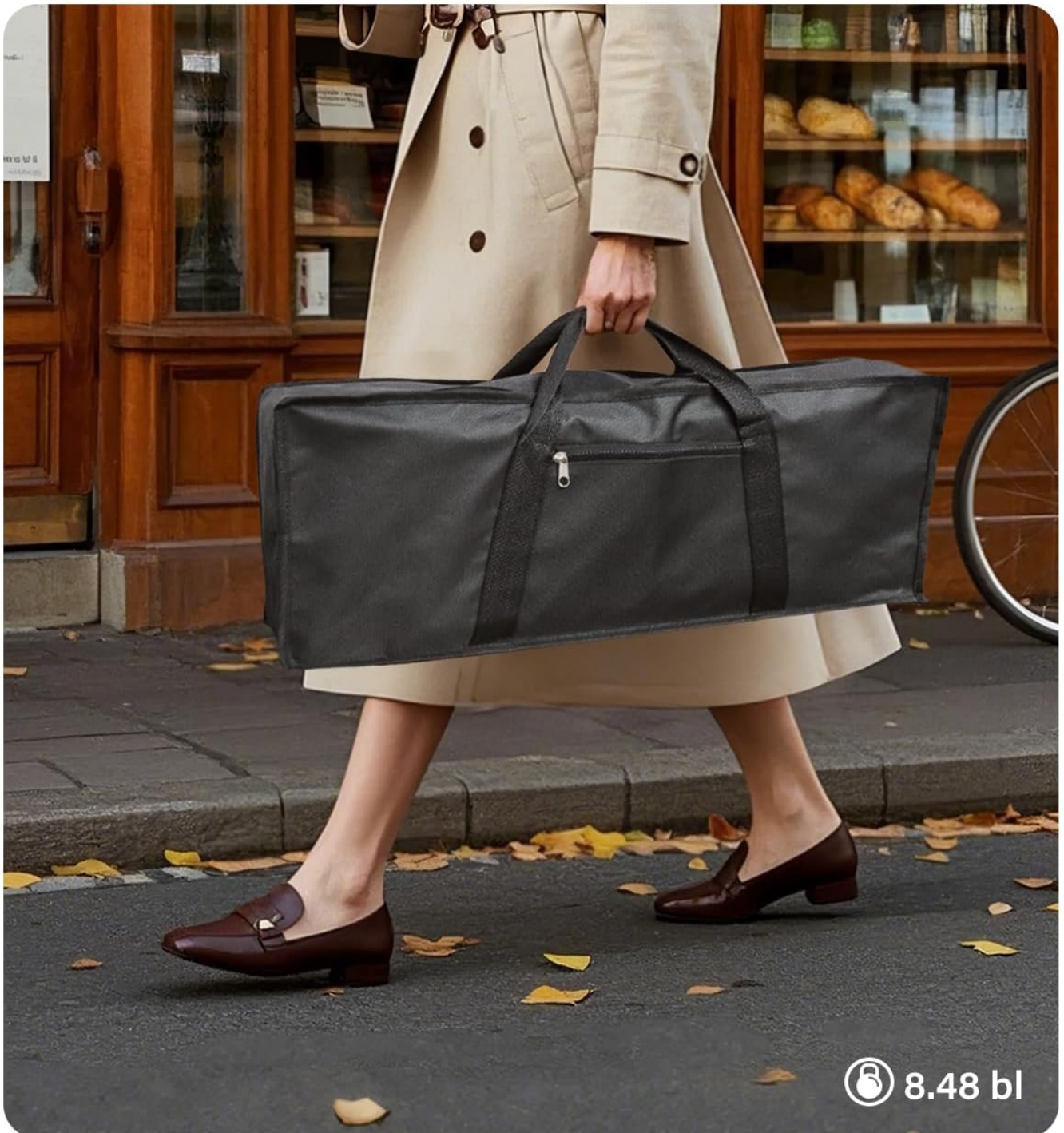
Figure 5.1: The piano stored in its carrying bag.