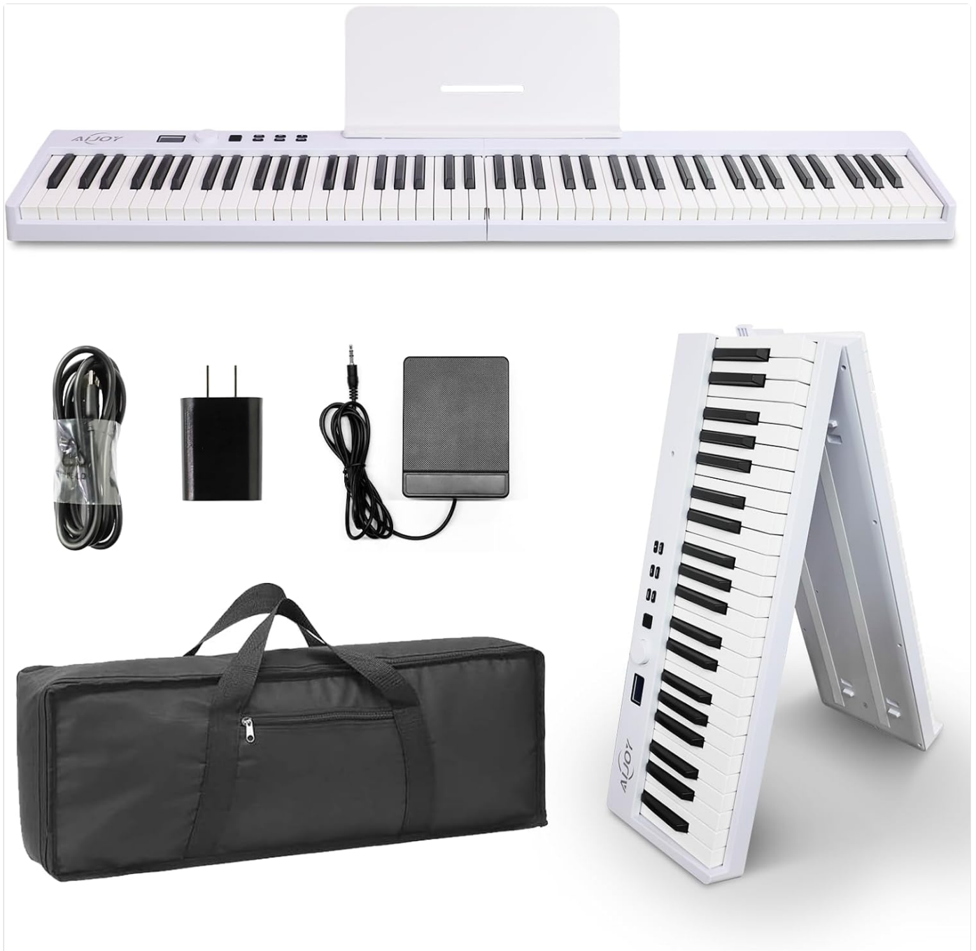
Figure 2.1: Package contents of the AiJoy ASP-10F piano.