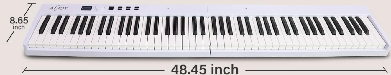
Figure 3.1: Dimensions of the piano in folded and unfolded states.