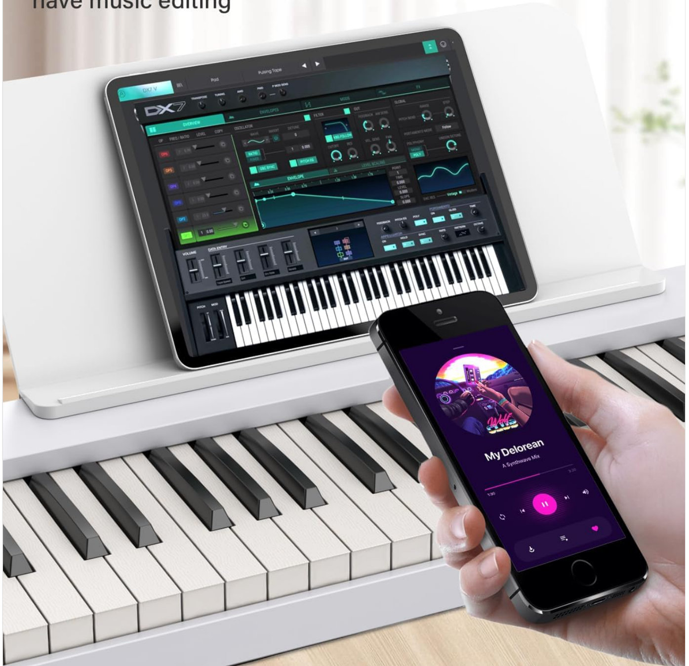
Figure 4.2: Wireless MIDI connection to a tablet.

You can connect iPad or Phone to have music editing