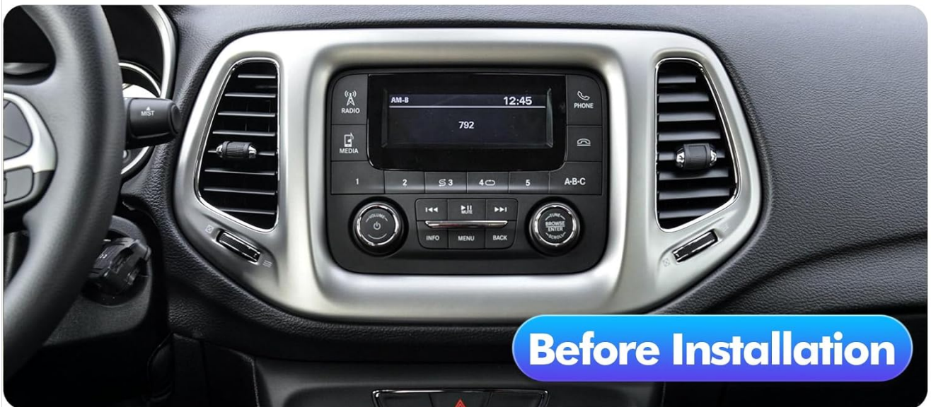
Image 3: Visual comparison of the car dashboard before and after the stereo installation.