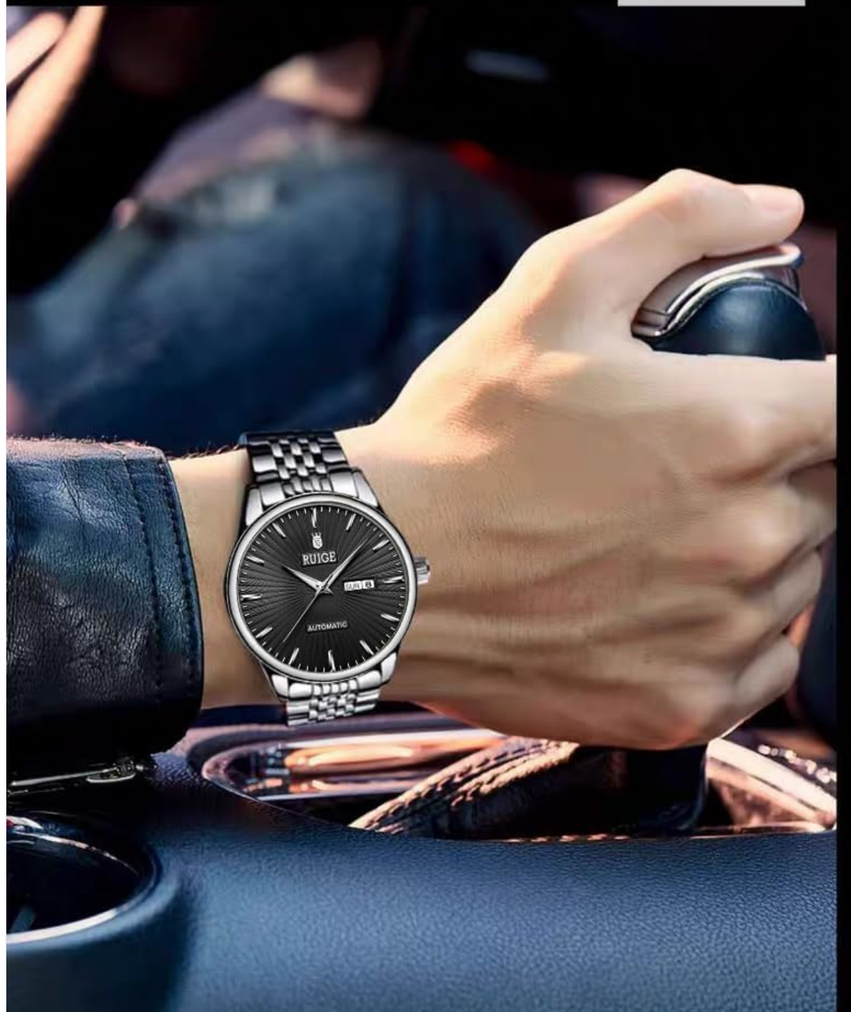
Figure 4: A close-up of the 316L solid stainless steel bracelet links, highlighting their construction.

REDEFINING MEN'S MACHINERY WITH BEAUTY AND QUALITY