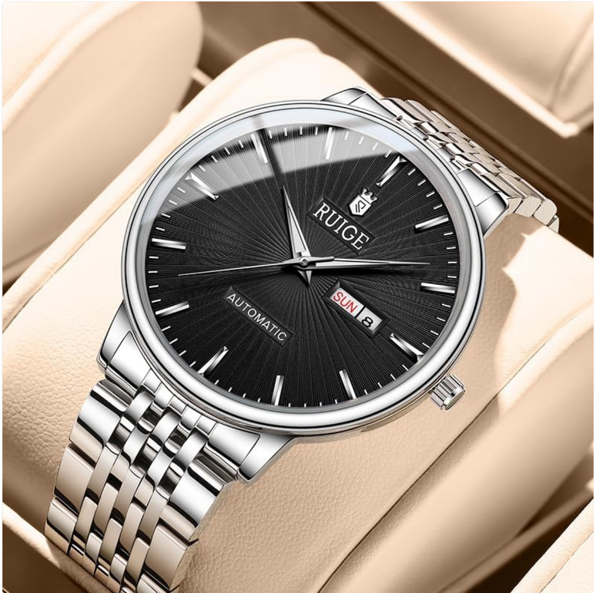
Figure 2: A detailed view of the watch face, illustrating the crown's position for time and date adjustments.