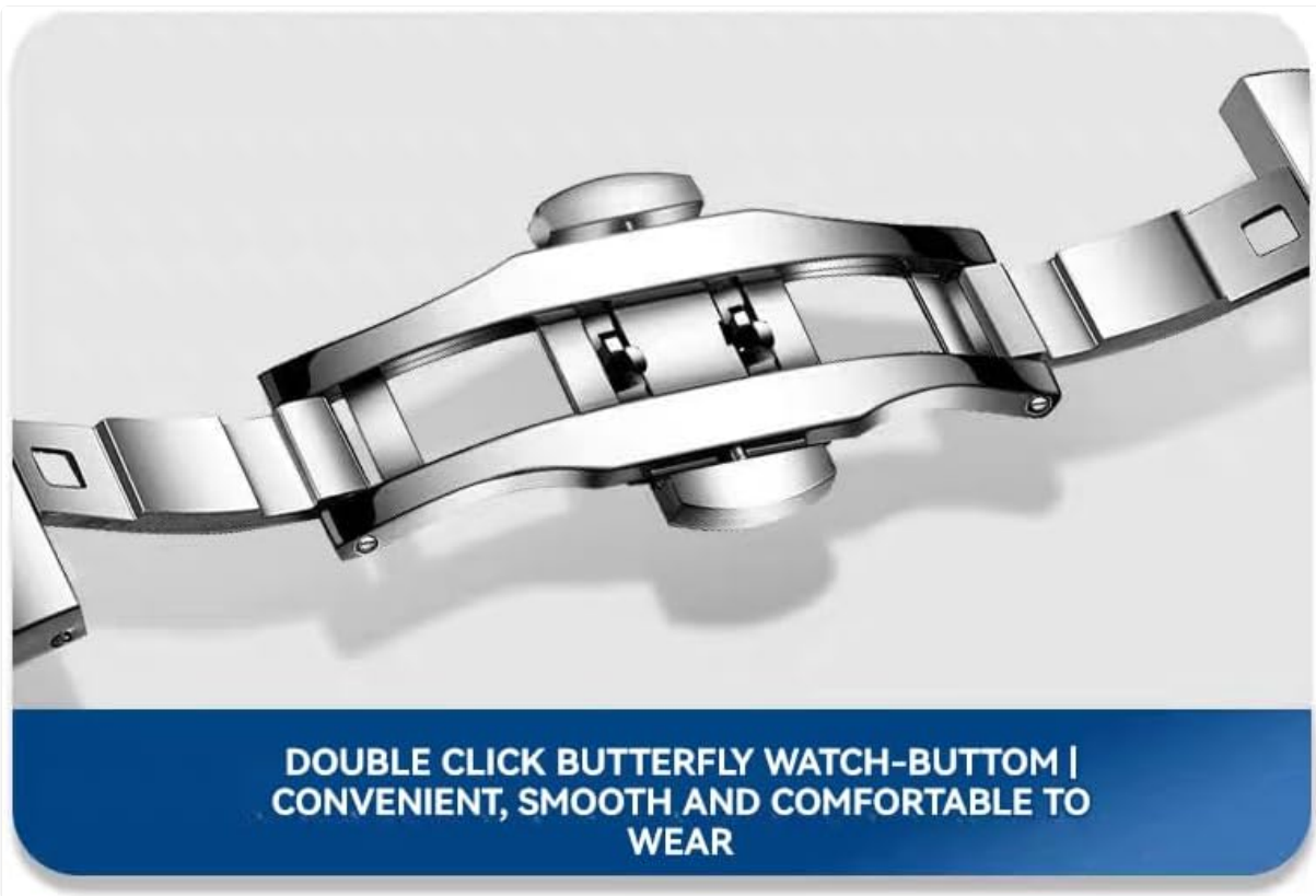
Figure 3: The double-click butterfly clasp mechanism, designed for secure and comfortable wearing.