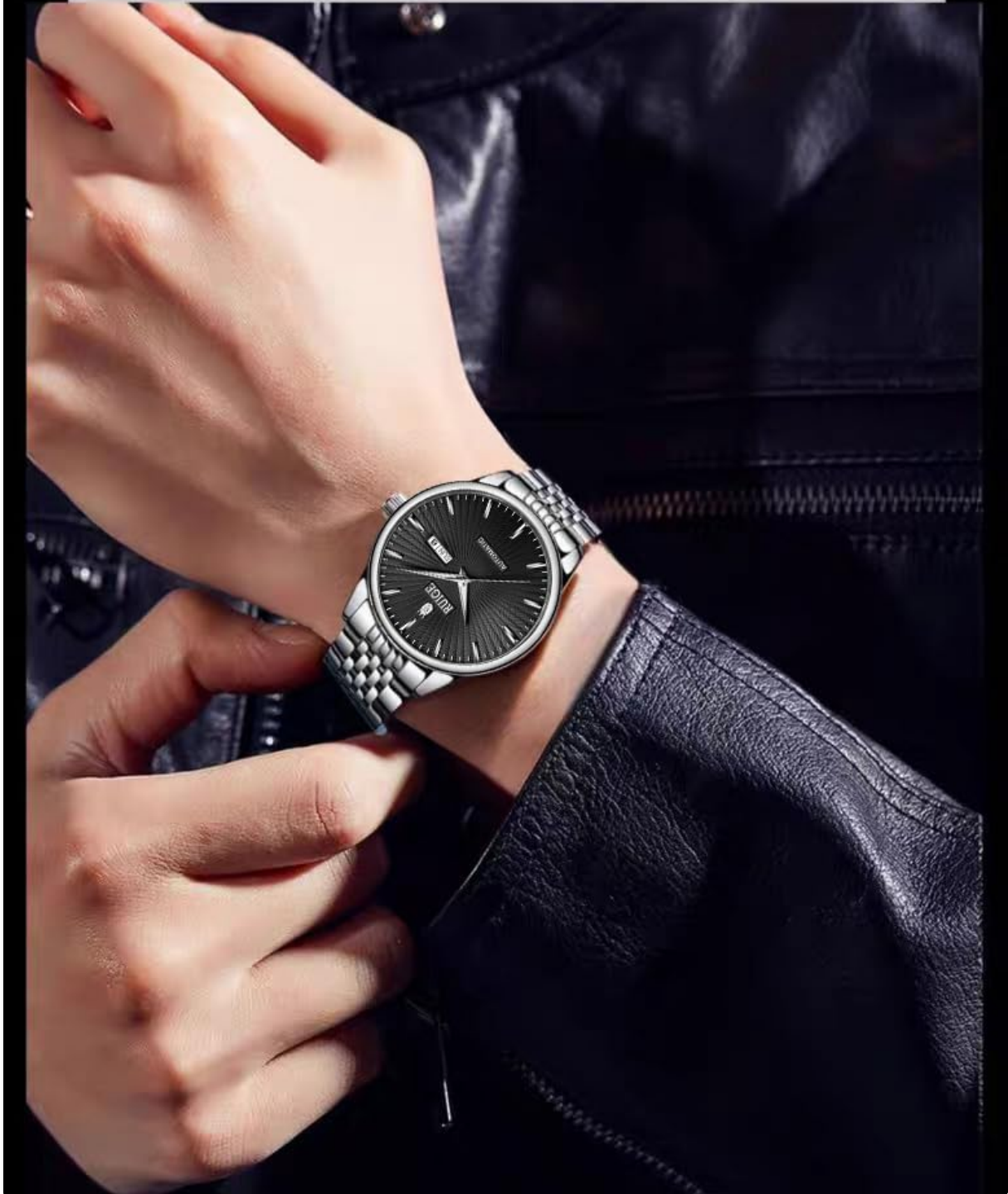
Figure 5: The RUIGE A6 watch comfortably worn on a wrist, demonstrating its ergonomic design.

EVERYTHING IS PERFECTLY CONNECTED, AND THE COMFORT IS DOUBLED