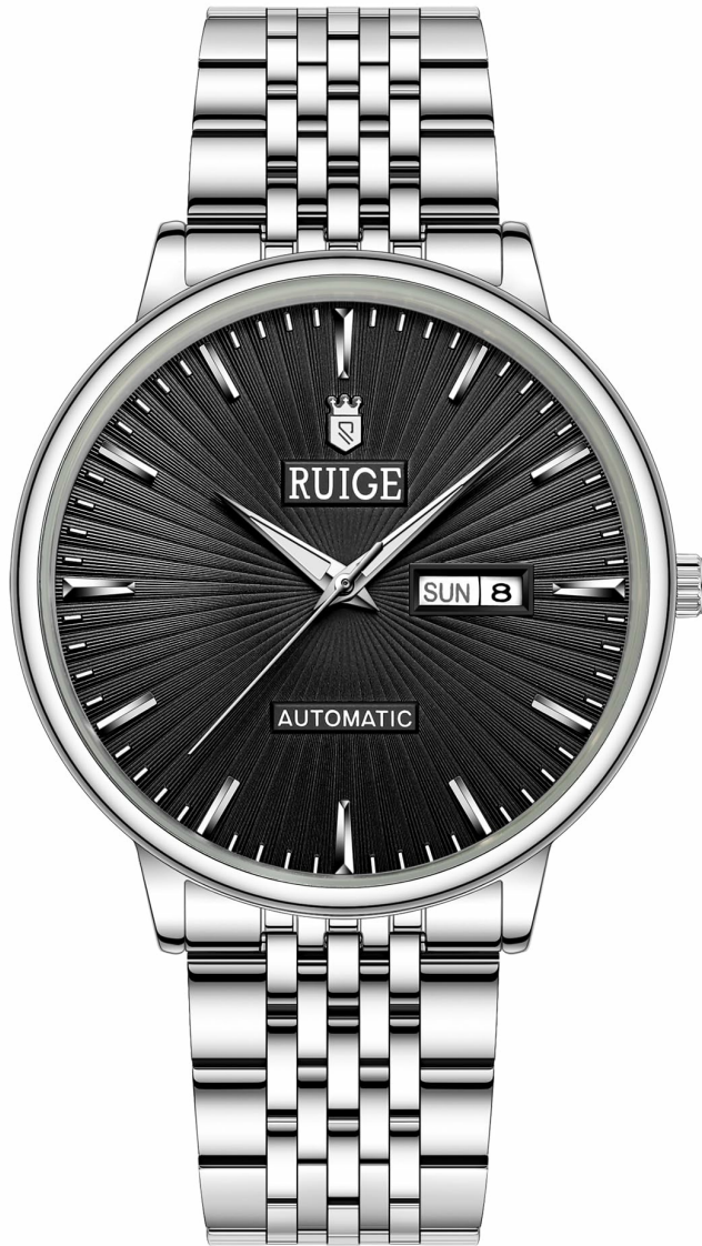
Figure 1: The RUIGE A6 Automatic Watch, showcasing its black dial, silver-tone hands and markers, and stainless steel bracelet. The watch features a day and date display at the 3 o'clock position.