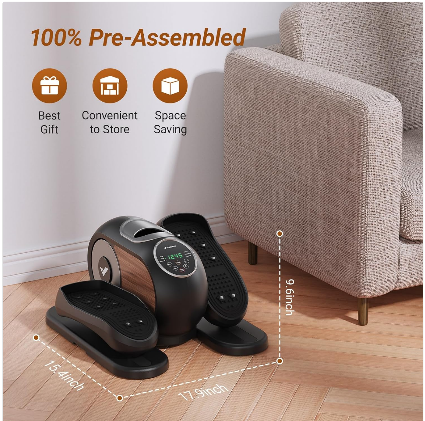
Figure 3: The elliptical is ready to use directly out of the box, requiring no assembly.