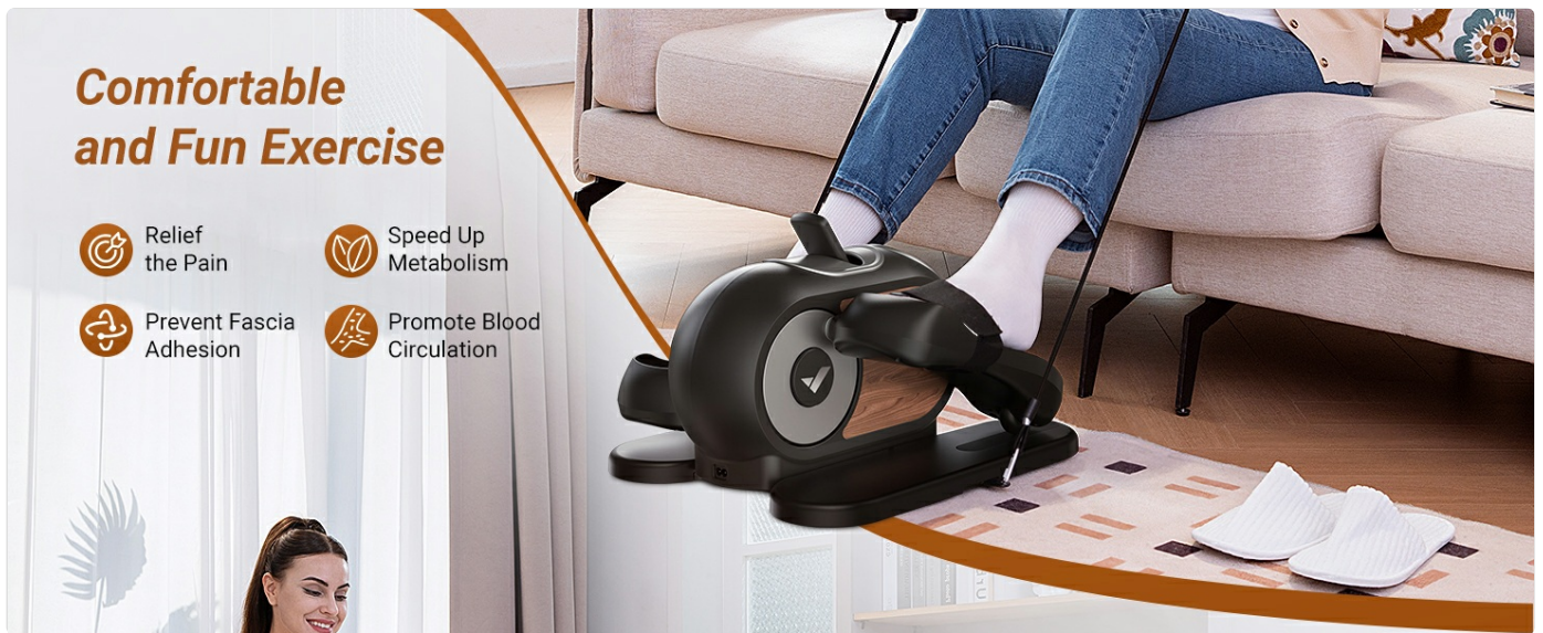
Figure 8: Integrating resistance bands for a full-body workout.