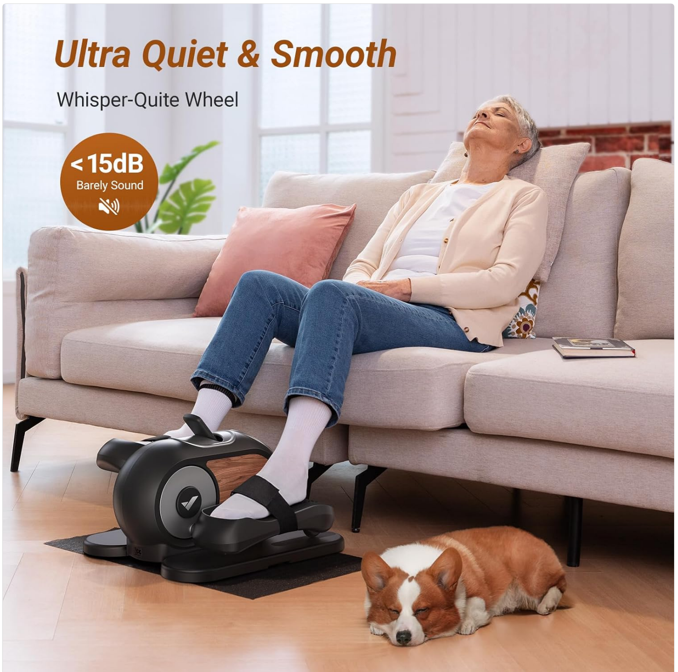
Figure 9: The elliptical's quiet operation allows for undisturbed use in any setting.