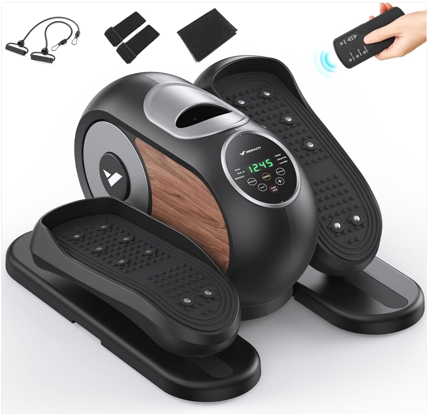
Figure 1: The MERACH Under Desk Elliptical, showcasing its compact design, remote control, and included accessories like resistance bands and foot straps.