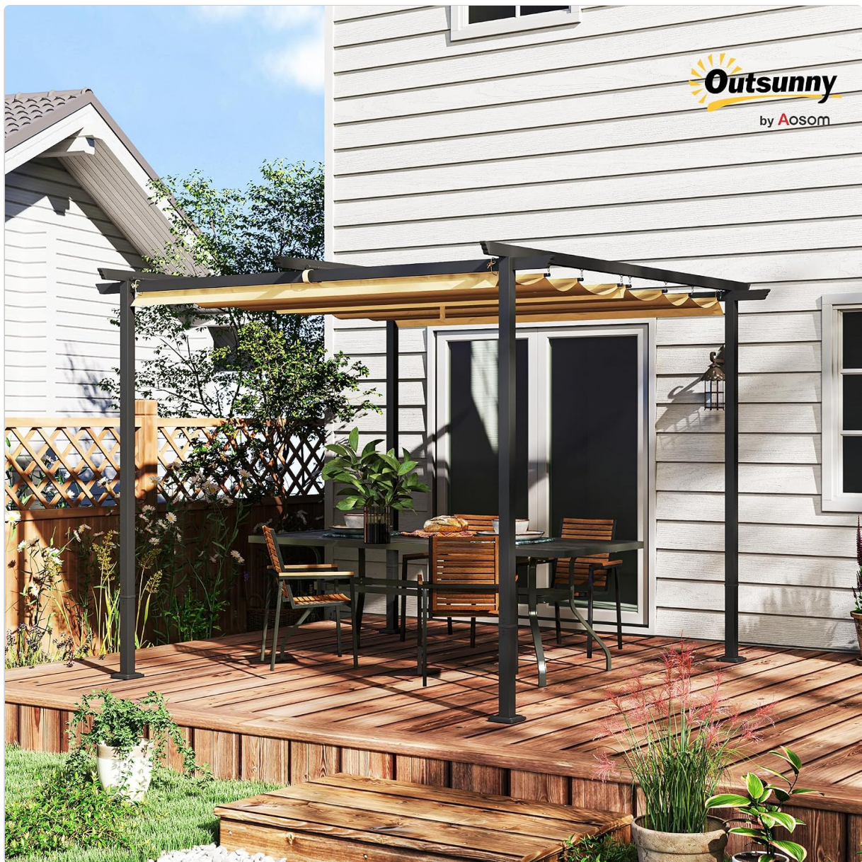
Figure 1.1: The Outsunny 3x3m Metal Garden Pergola providing shade over an outdoor dining area on a wooden deck.