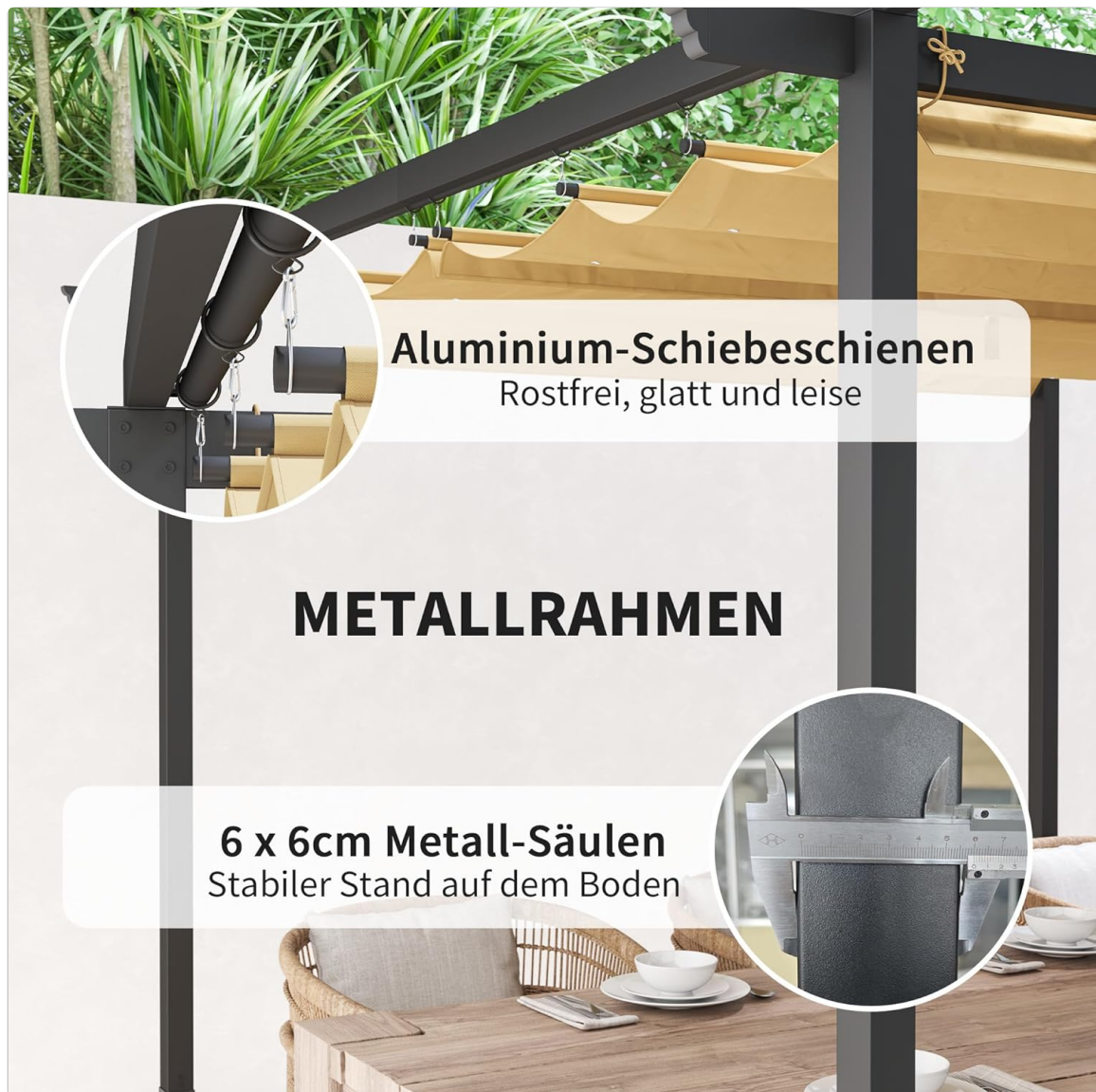
Figure 4.1: Detail of the aluminum sliding rails and the robust 6x6cm metal columns.