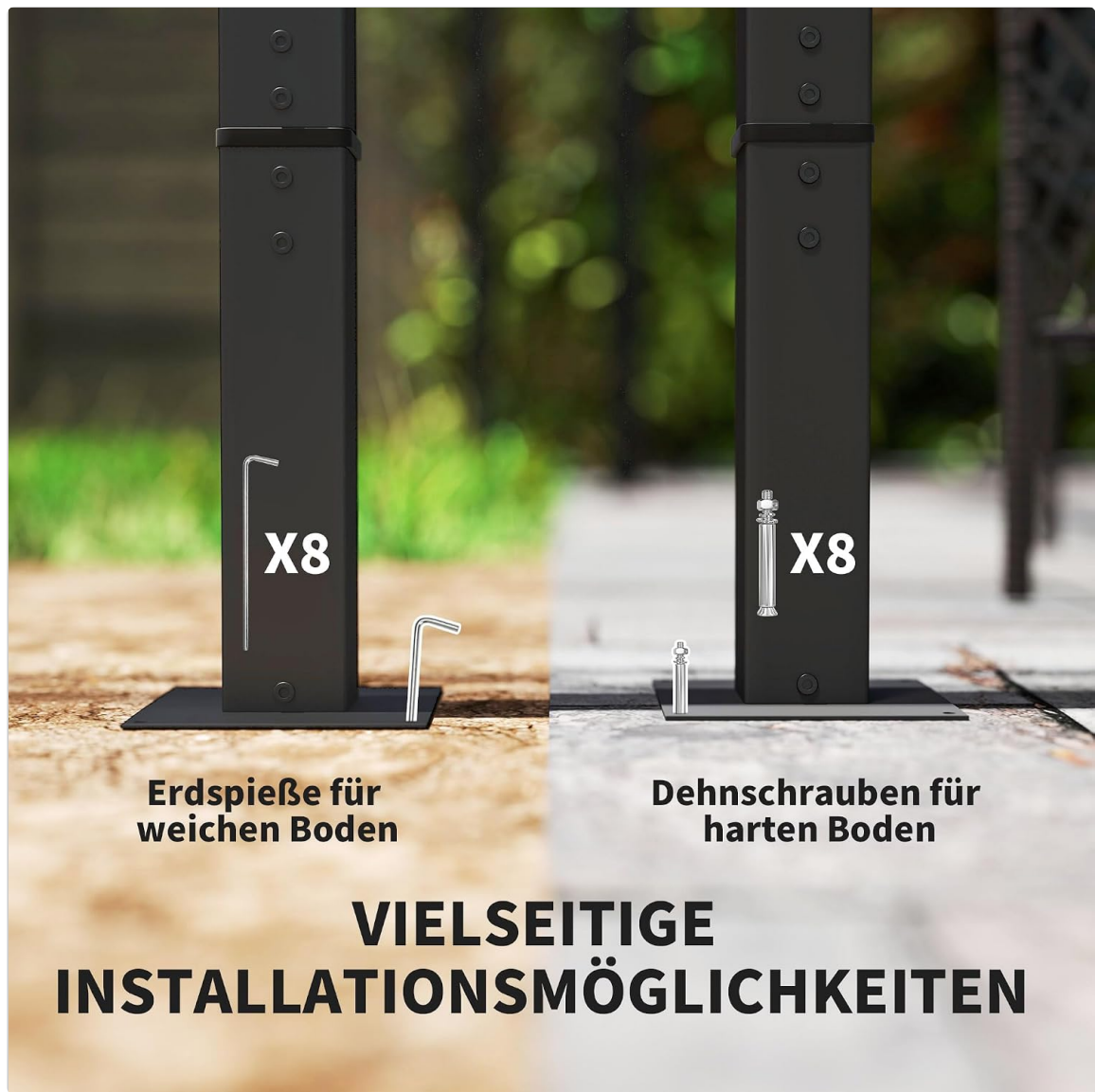
Figure 4.3: Versatile installation options for different ground types.