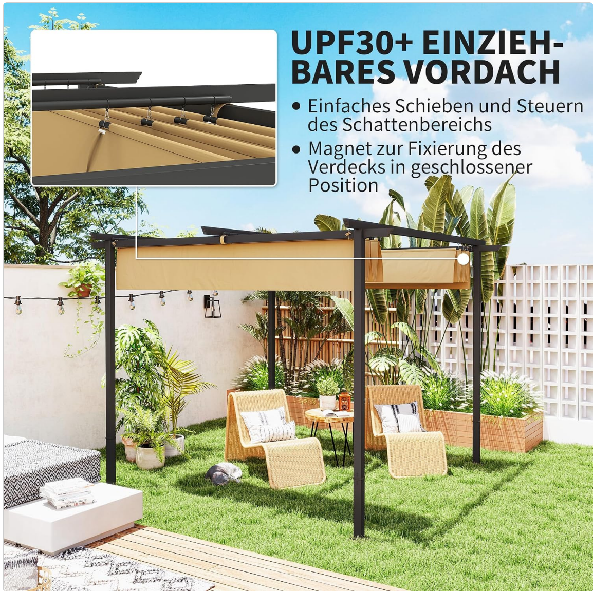
Figure 4.2: The retractable canopy mechanism, showing how it slides and the magnetic fasteners for secure closure.

5. Secure the Pergola to the Ground: Once the frame and canopy are assembled, position the pergola in its desired location. Use the appropriate anchoring method for your ground type: