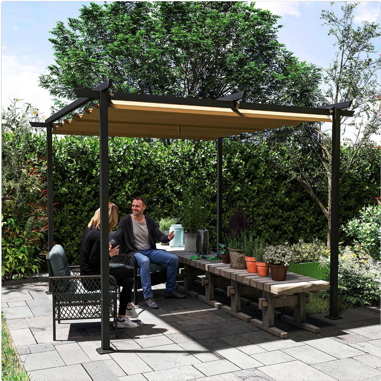
Figure 5.1: The pergola providing comfortable shade for outdoor relaxation.