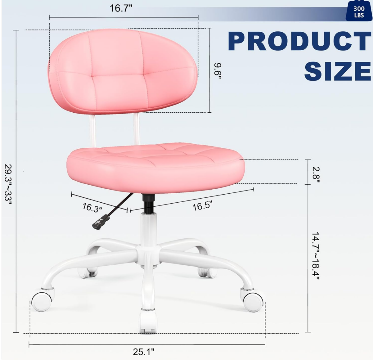
Image: Detailed product dimensions of the Misolant Vanity Chair.