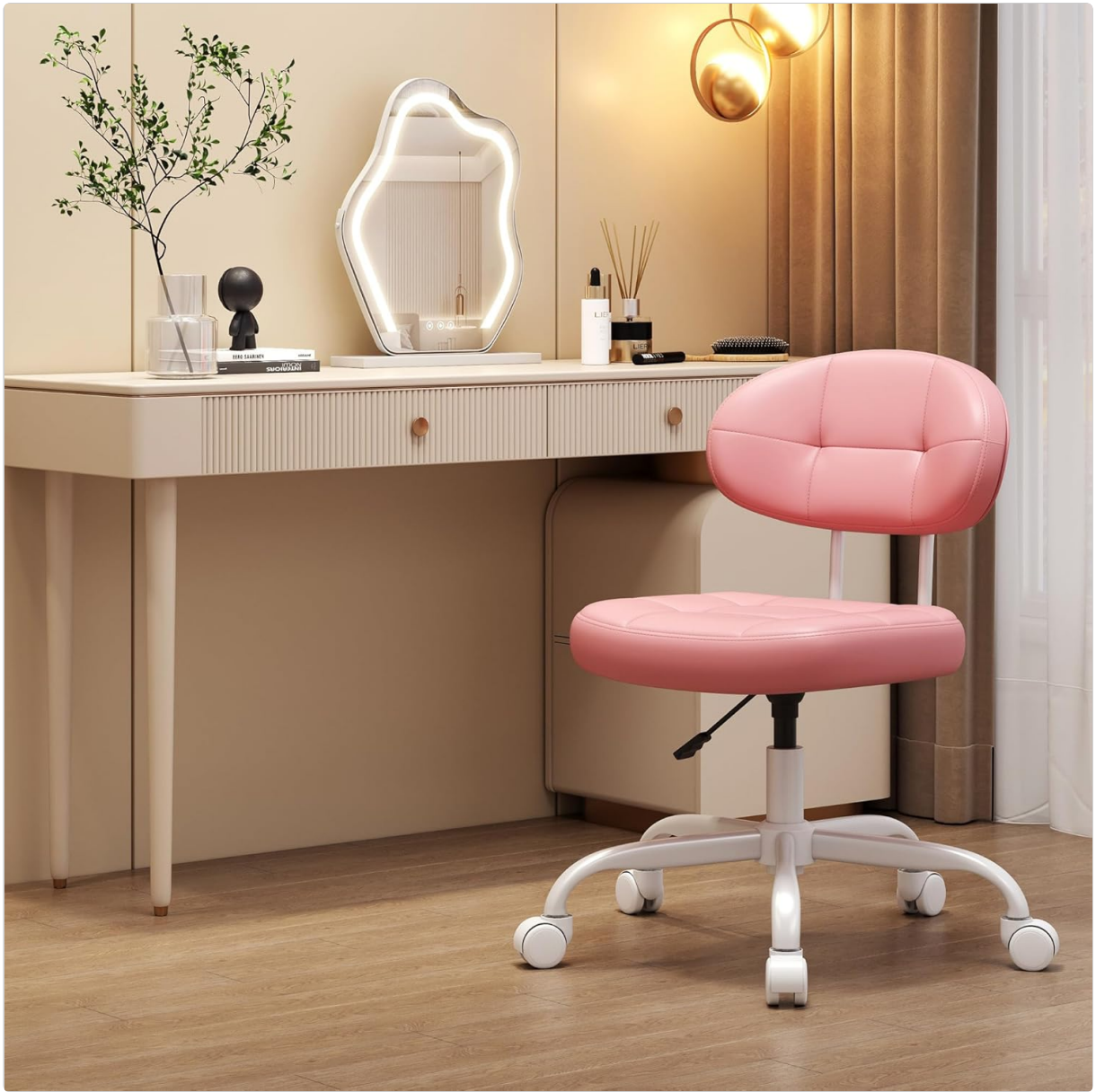
Image: The Misolant Vanity Chair positioned in a modern vanity area, highlighting its aesthetic appeal.