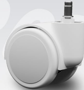
Image: Detailed view of the SGS Certified Class-4 Gas Lift and 360-degree wear-resistant, quiet wheels.