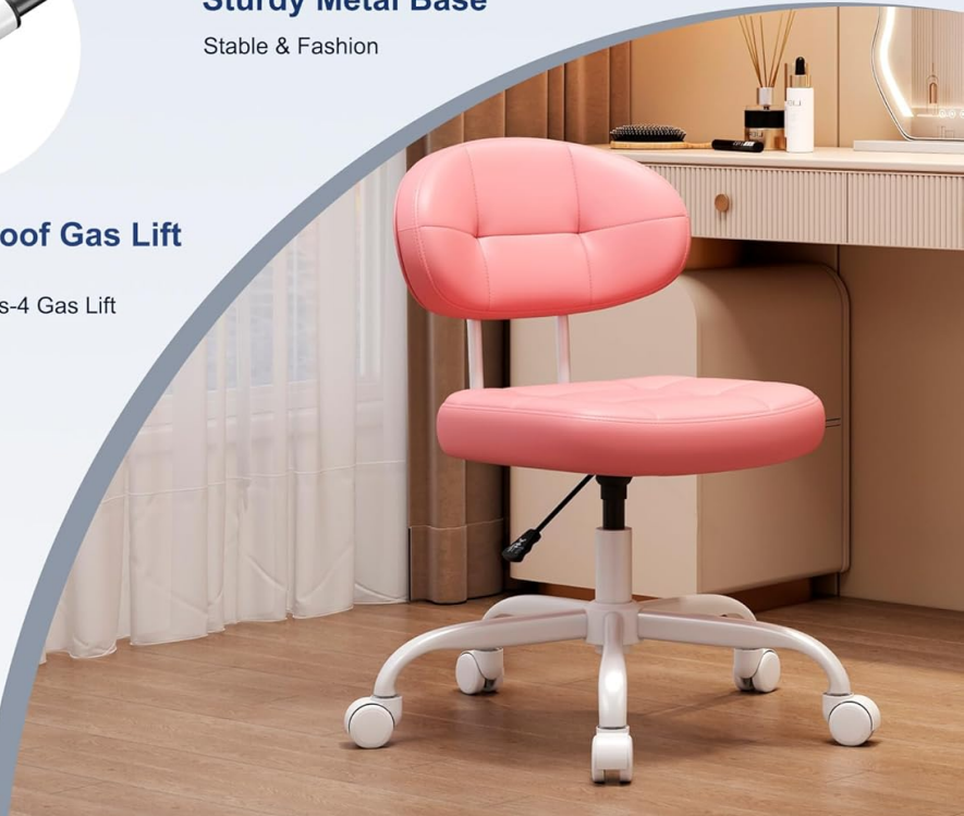
Image: Features emphasizing the chair's durability and quality, including the sturdy metal base, nylon silent wheels, and explosion-proof gas lift.