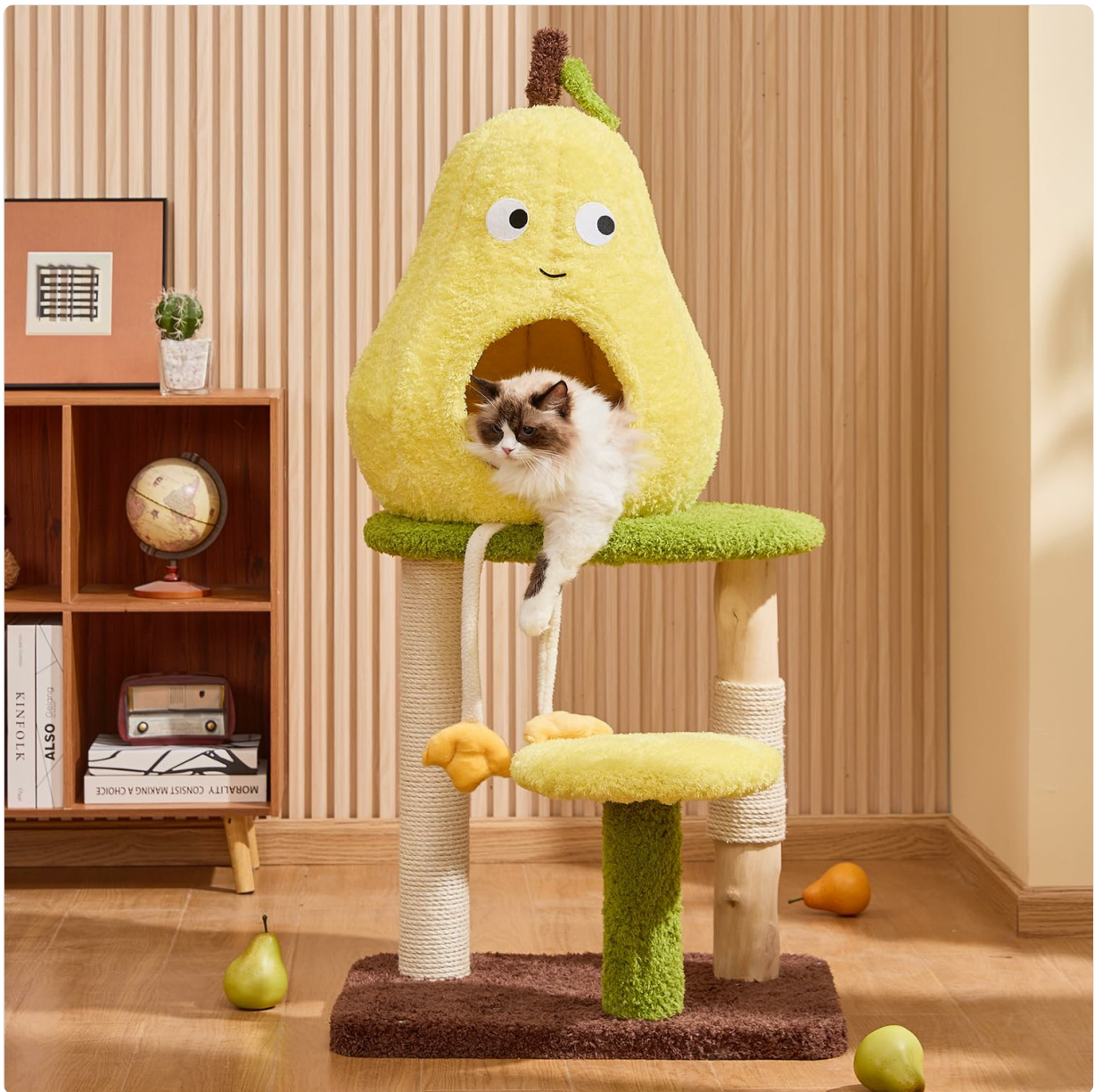
Image: A cat comfortably resting inside the pear-shaped bed of the KZLAA Cat Tree, demonstrating its use as a cozy retreat. This highlights the functional design for cat comfort.