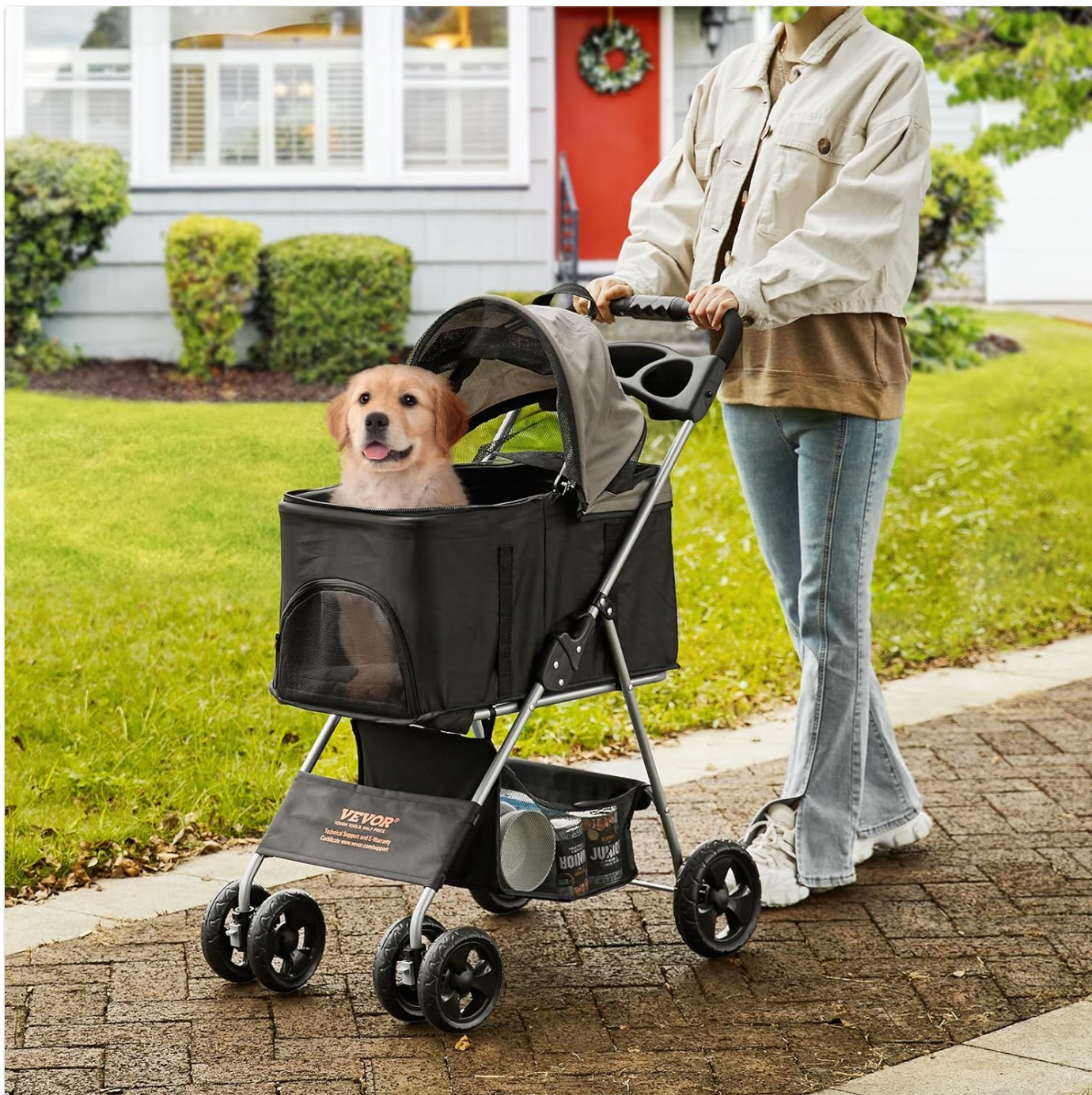
Figure 8.1: Detailed dimensions and specifications of the VEVOR Pet Stroller.