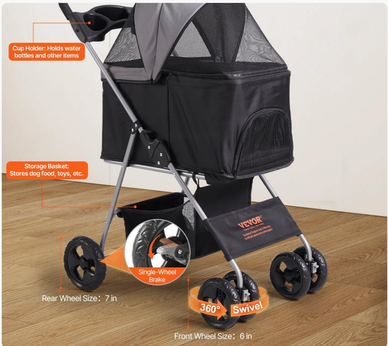
Figure 6.1: The durable 600D Oxford fabric and breathable mesh windows are easy to clean.