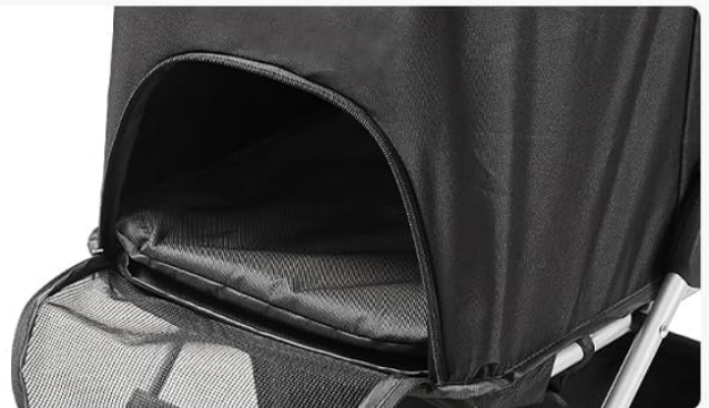
Figure 5.3: The pet carrier can be detached for versatile use.

Single Zipper Design: Secure and Reliable