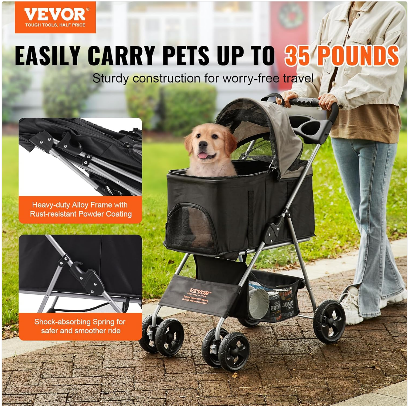
Figure 5.1: The stroller provides a comfortable ride for your pet.