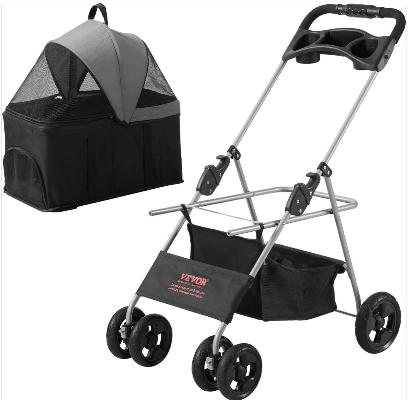
Figure 1.1: VEVOR Pet Stroller with its detachable carrier unit.