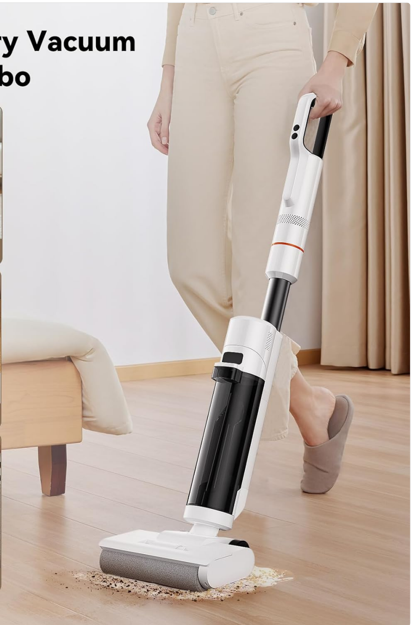
Figure 4.1: The JONR ED20 Pro offers 4-in-1 functionality for various cleaning needs, including hard floors, carpets, furniture, and car interiors.