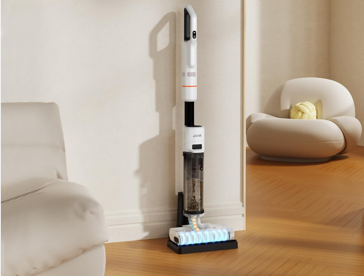
Figure 5.1: The self-cleaning and automatic drying process ensures hygiene and extends the life of the brush roller.

Continuous drying eliminate bacteria and odors