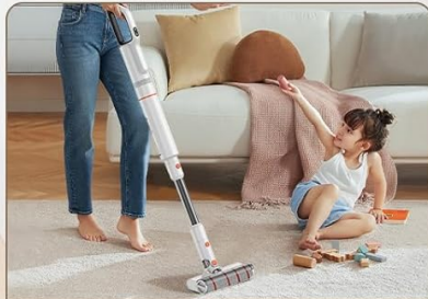
Hard Floor & Carpet