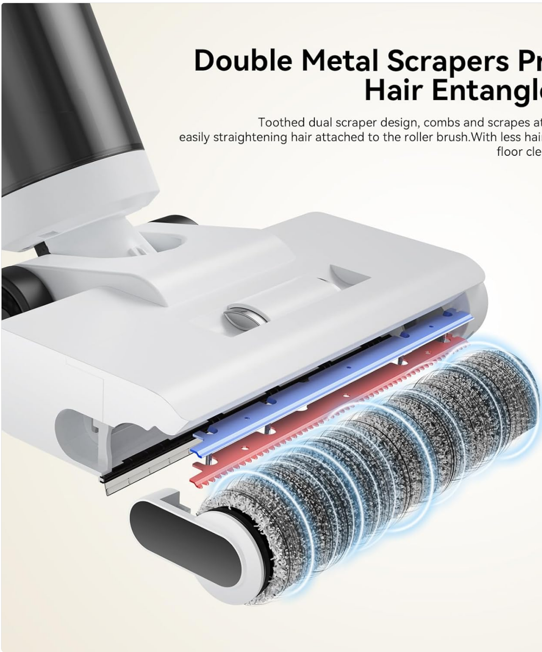
Figure 5.2: The double metal scrapers effectively prevent hair entanglement on the brush roller.

Toothed dual scraper design, combs and scrapes at the same time, easily straightening hair attached to the roller brush. With less hair entanglement, floor cleaning is smooth.