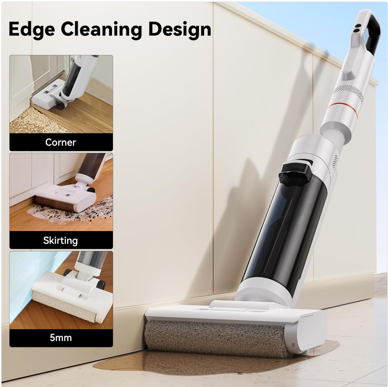
Figure 4.2: The ED20 Pro's edge cleaning design allows it to reach tight spaces and corners effectively.