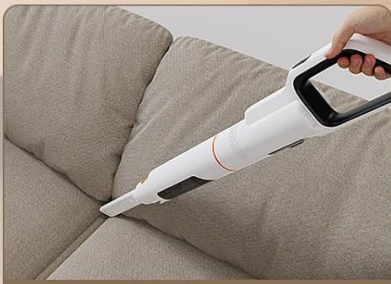
Sofa & Car