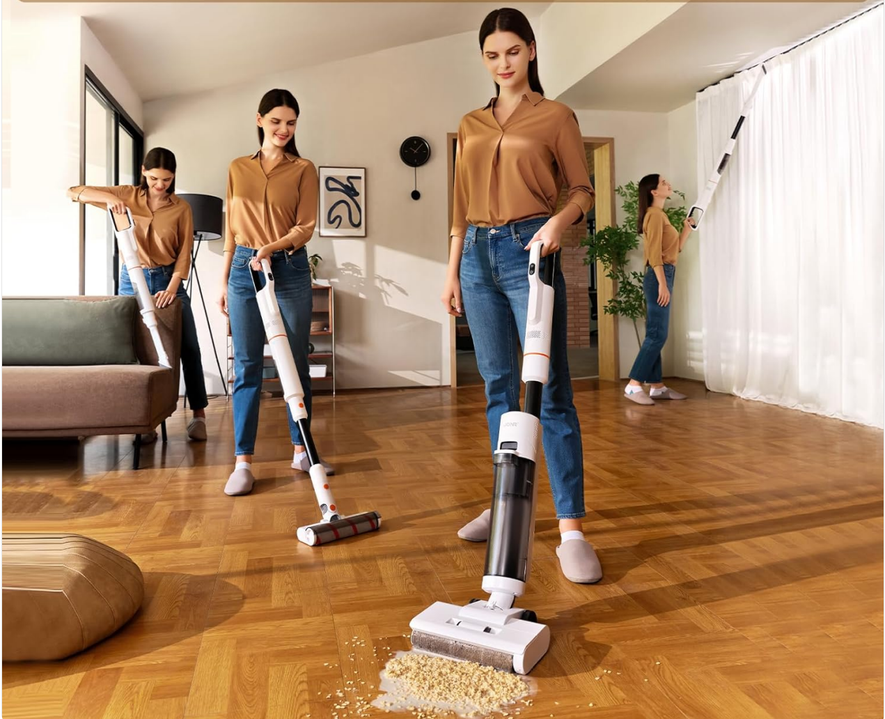
Figure 4.3: The JONR ED20 Pro offers sufficient battery life for whole-house cleaning.