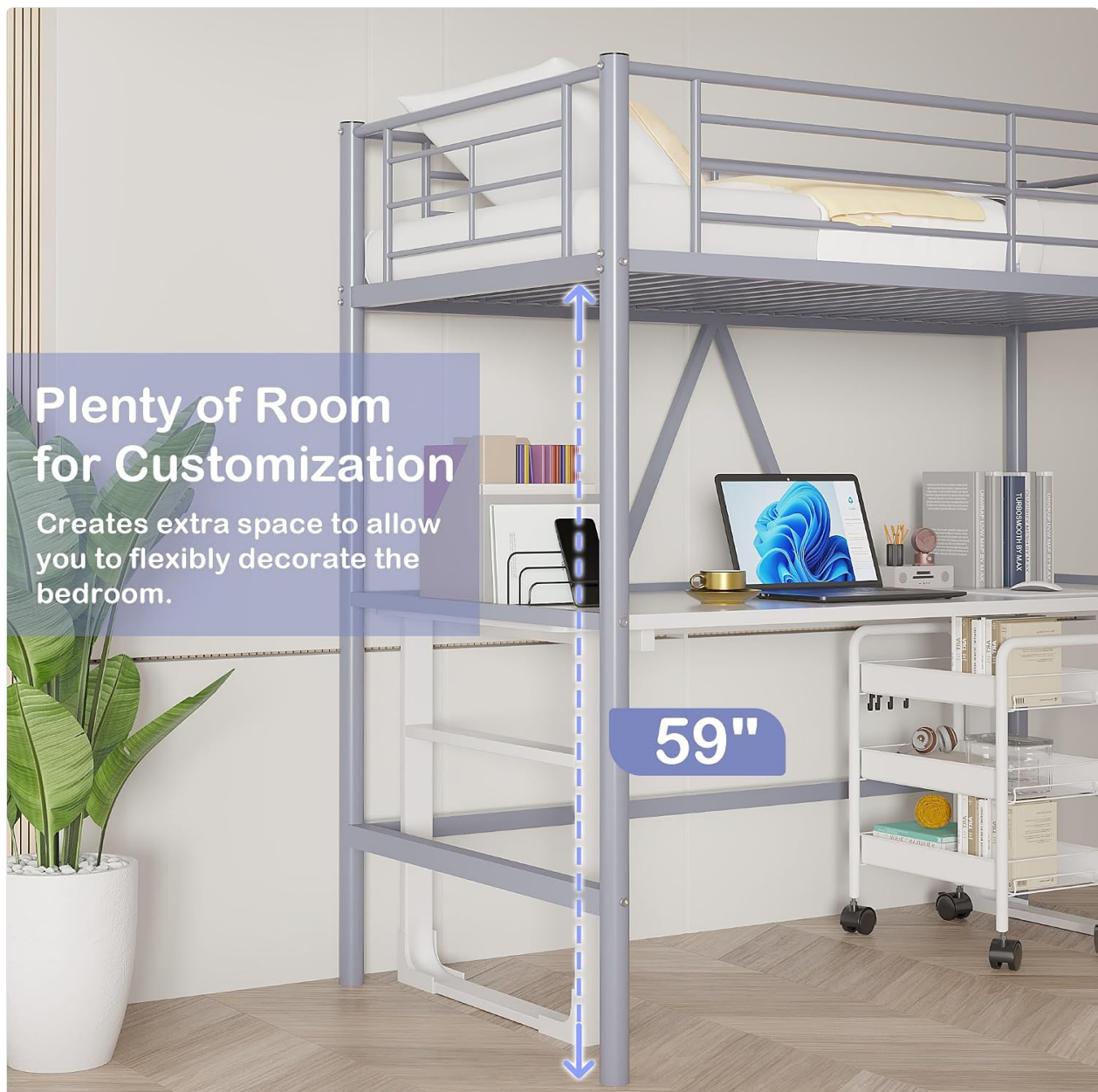
Image: The VECELO Metal Twin Loft Bed demonstrating the 59-inch clearance beneath, ideal for creating a personalized study or leisure area.

Video: An overview of the VECELO Twin Size Loft Bed, highlighting its features and potential uses in a room setting.