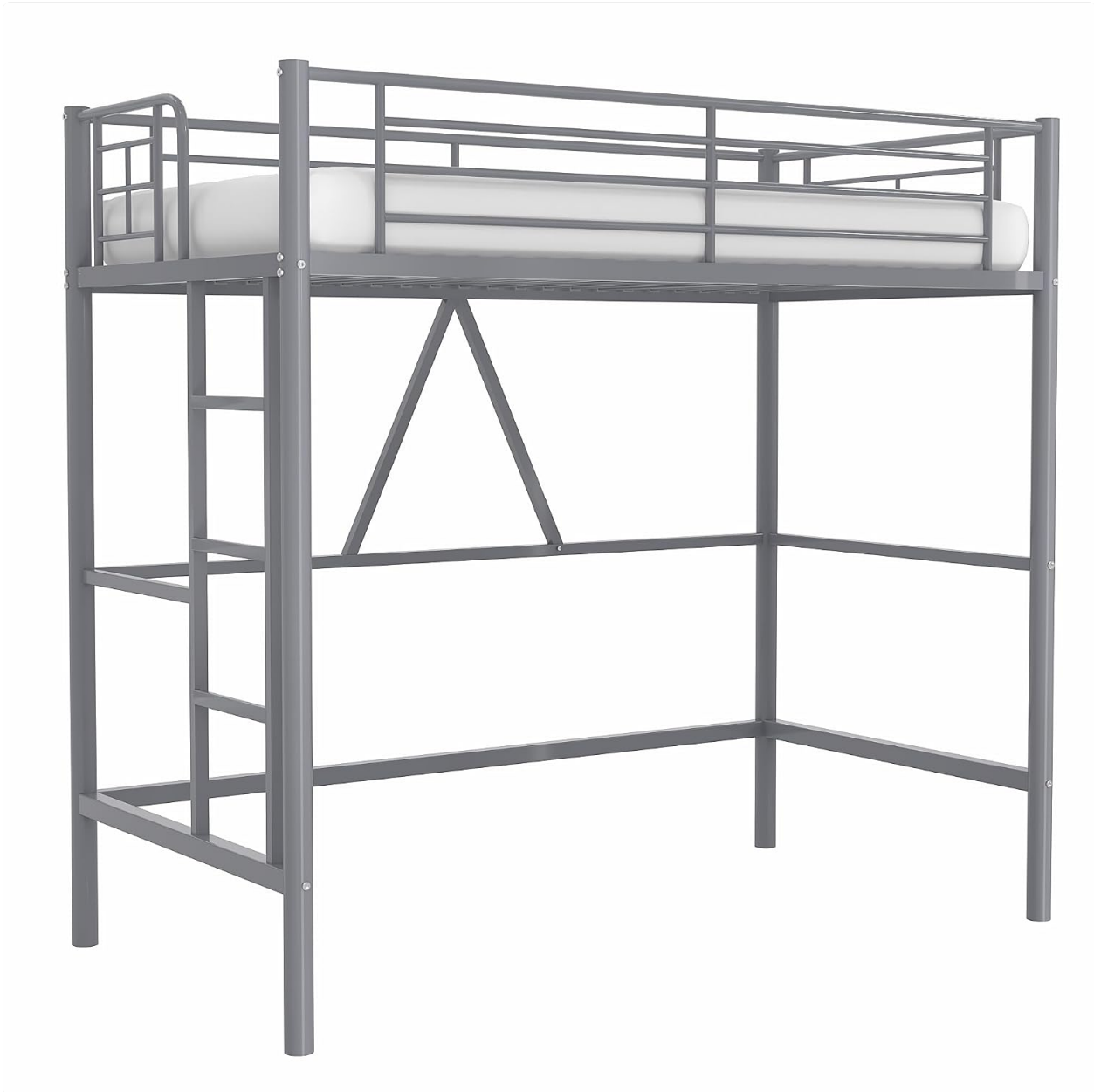
Image: A clear front view of the VECELO Metal Twin Loft Bed in grey, showing its sturdy metal frame and integrated ladder.