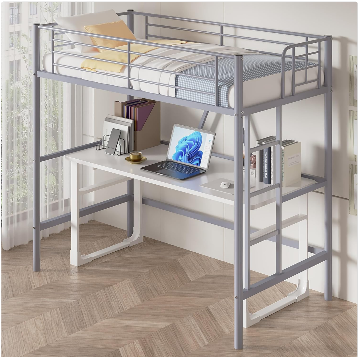
Image: An assembled VECELO Metal Twin Loft Bed in grey, showcasing the space underneath utilized with a desk and shelving. The ladder is positioned on the right side.

Video: Official VECELO guide demonstrating the assembly process for a loft bed. This video provides visual steps to assist with installation.