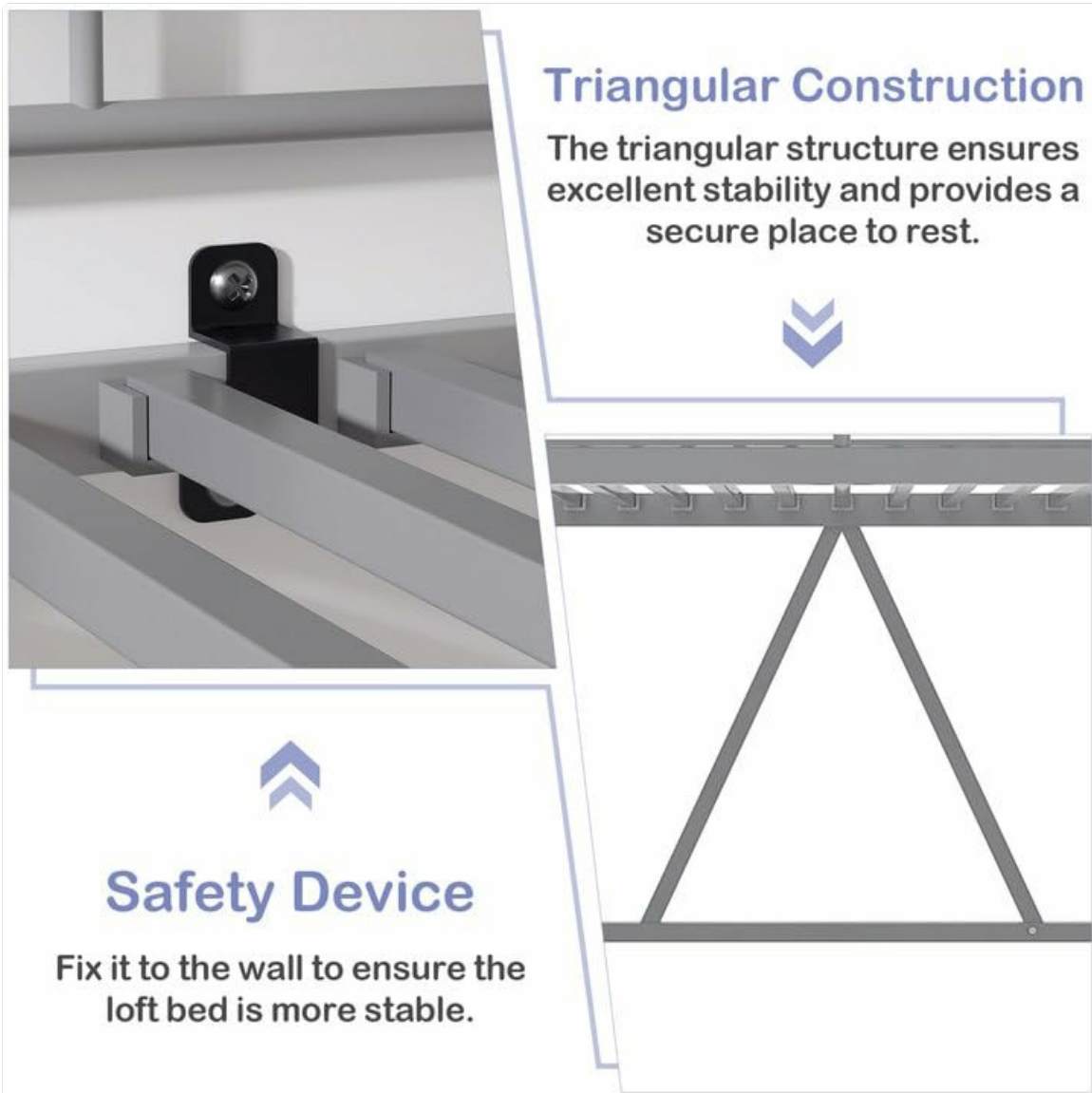
Image: Illustrates the triangular construction for enhanced stability and the anti-tipping device designed to secure the bed to the wall.