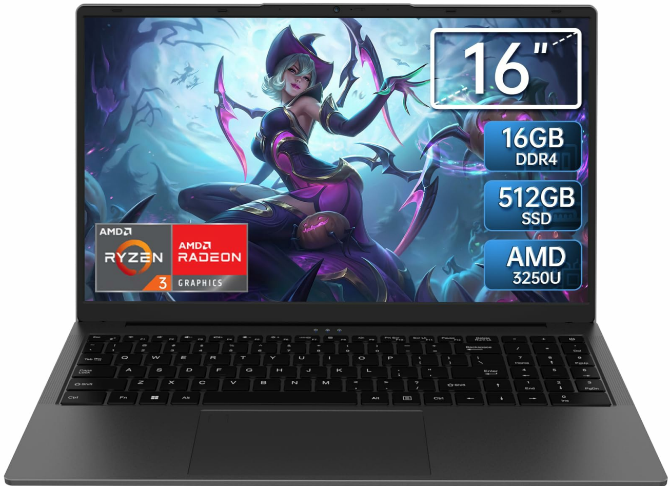
Figure 1: KurieTim 16 Inch Laptop Computer

This image shows the KurieTim 16 Inch Laptop Computer, highlighting its sleek design and large display.