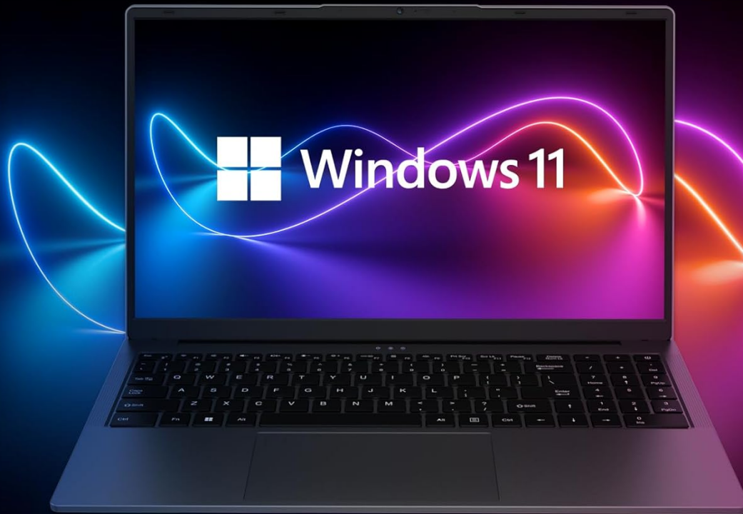
Figure 3: Laptop running Windows 11 Pro

This image shows the laptop screen displaying the Windows 11 Pro operating system interface.