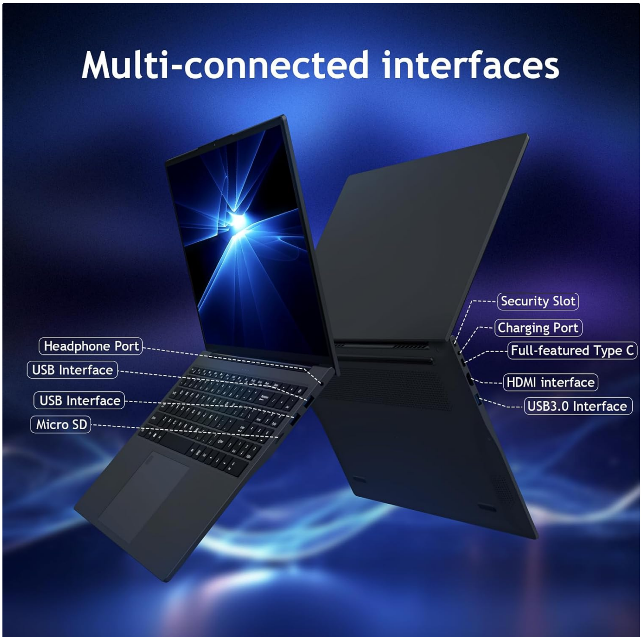
Figure 5: Multi-connected interfaces

This image displays the various ports and interfaces available on the laptop, including USB, HDMI, Type-C, headphone, Micro SD, security slot, and charging port.