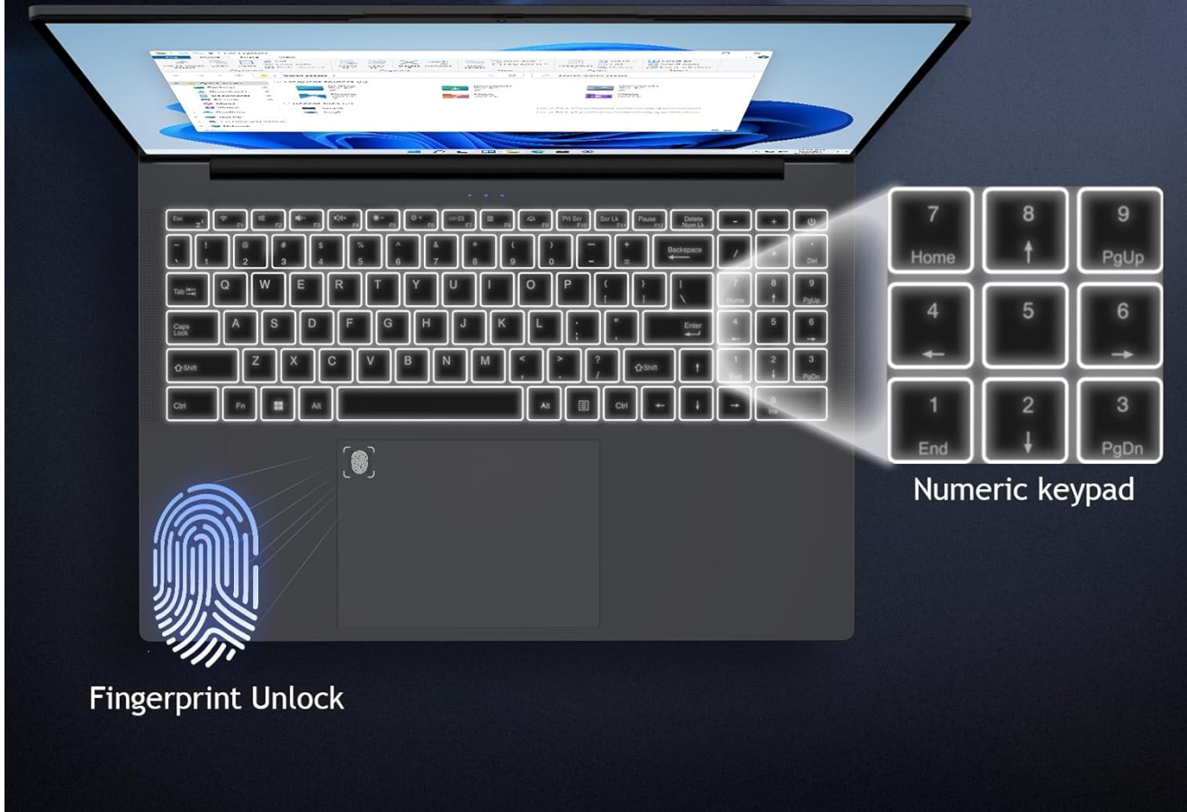
Figure 4: Fingerprint reader and backlit keyboard

This image highlights the fingerprint unlock sensor and the illuminated keys of the backlit keyboard.