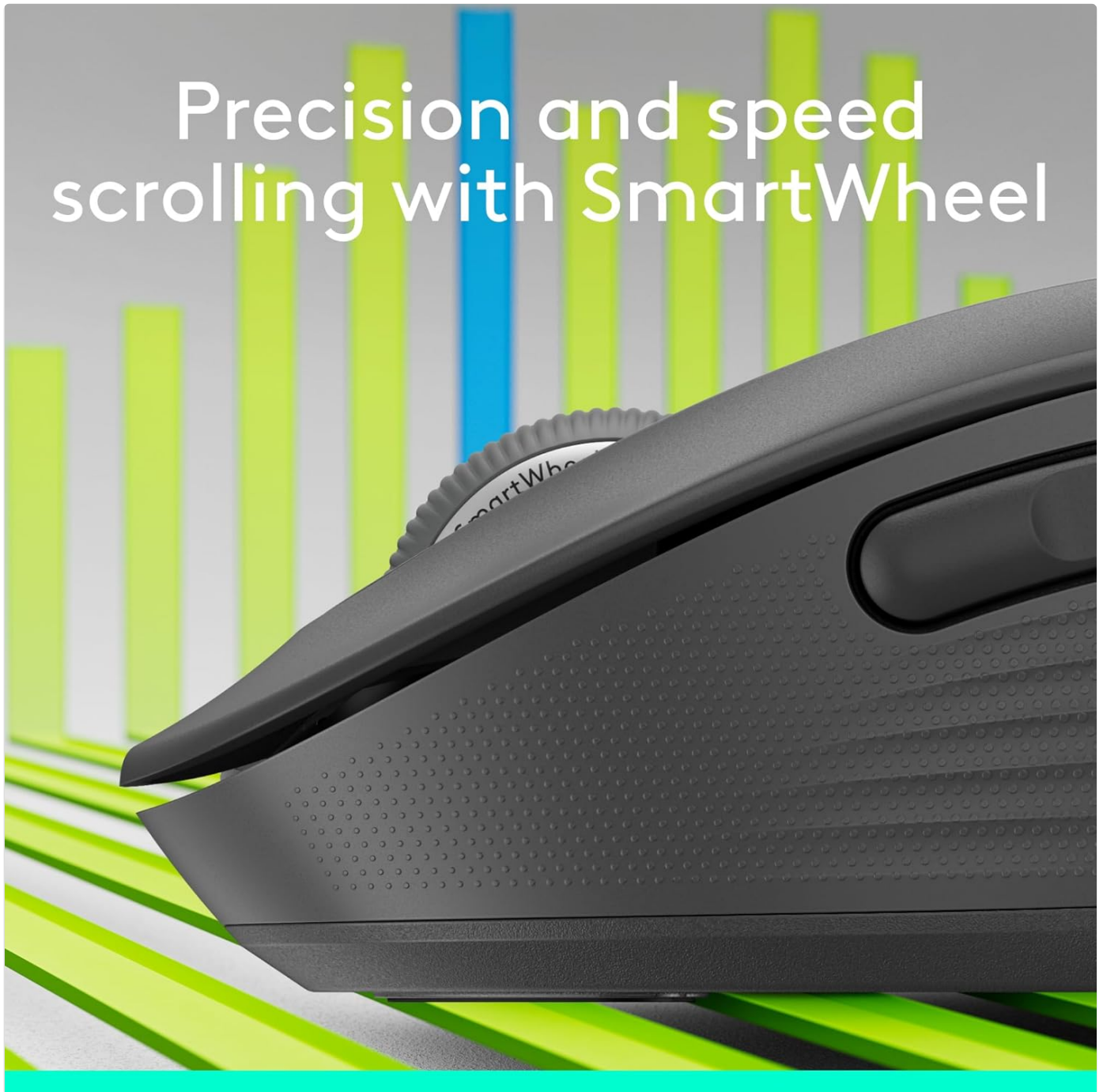
Image: A close-up view of the SmartWheel on the Logitech M750 mouse, highlighting its capability for both precision and high-speed scrolling.

The SmartWheel automatically switches between line-by-line precision scrolling and super-fast free-spinning scrolling. Simply flick the wheel to activate the desired mode. This feature is ideal for navigating long documents or web pages efficiently.