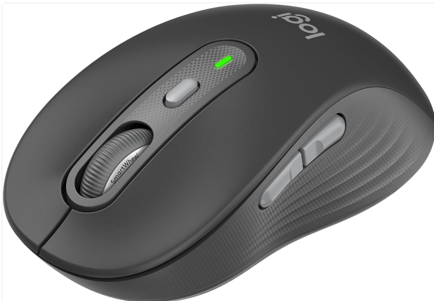
Image: The Logitech Signature Plus M750 Wireless Mouse in Graphite color, showing its ergonomic design and central scroll wheel.

The Logitech Signature Plus M750 Wireless Mouse is designed for enhanced productivity and comfort. Featuring SmartWheel scrolling, silent clicks, and multi-device connectivity, it offers a versatile and quiet user experience. This manual provides detailed instructions for setting up, operating, maintaining, and troubleshooting your M750 mouse.