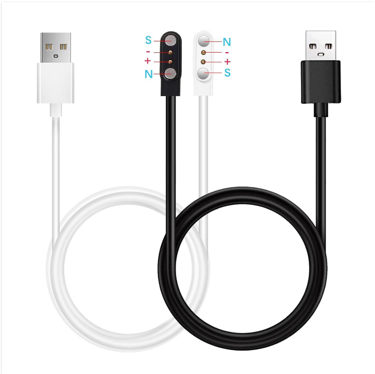
Image 1.1: Xinyinia Fit Cloud Pro Smart Watch Chargers (Black and White)