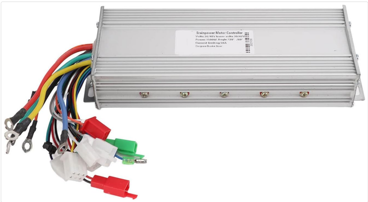
Figure 3.1: Front view of the YedaHcy Brushless Motor Controller, showcasing its aluminum alloy casing and various wire interfaces.