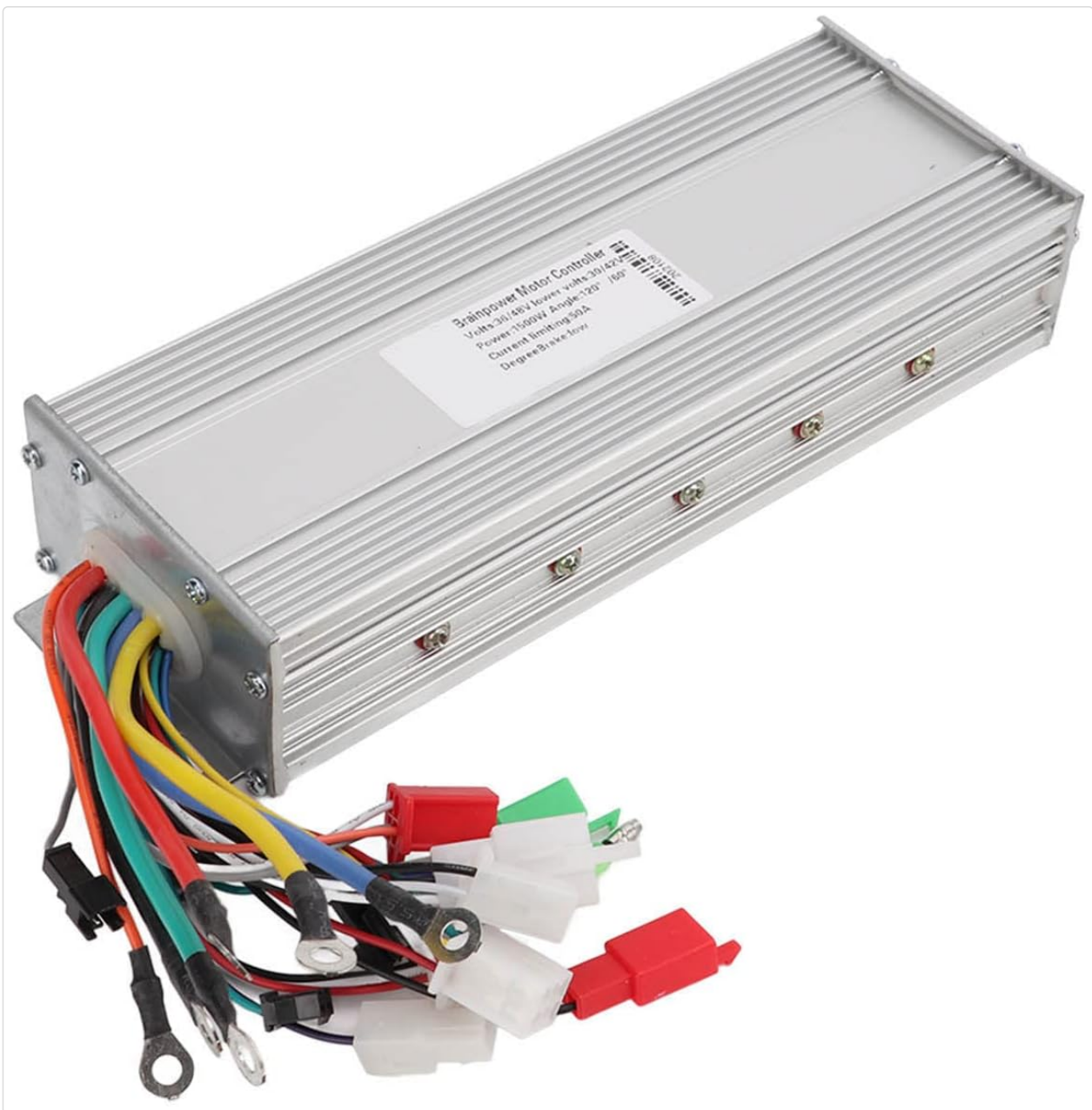
Figure 3.2: Angled view of the controller, highlighting the robust wiring harness with color-coded connectors for various functions.