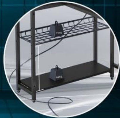
✓ Handige planken