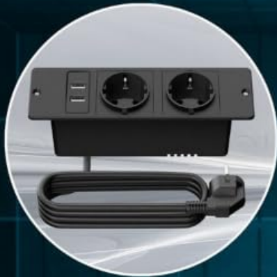
✓ EU Stekkerdoos Inclusief 2x USB-A