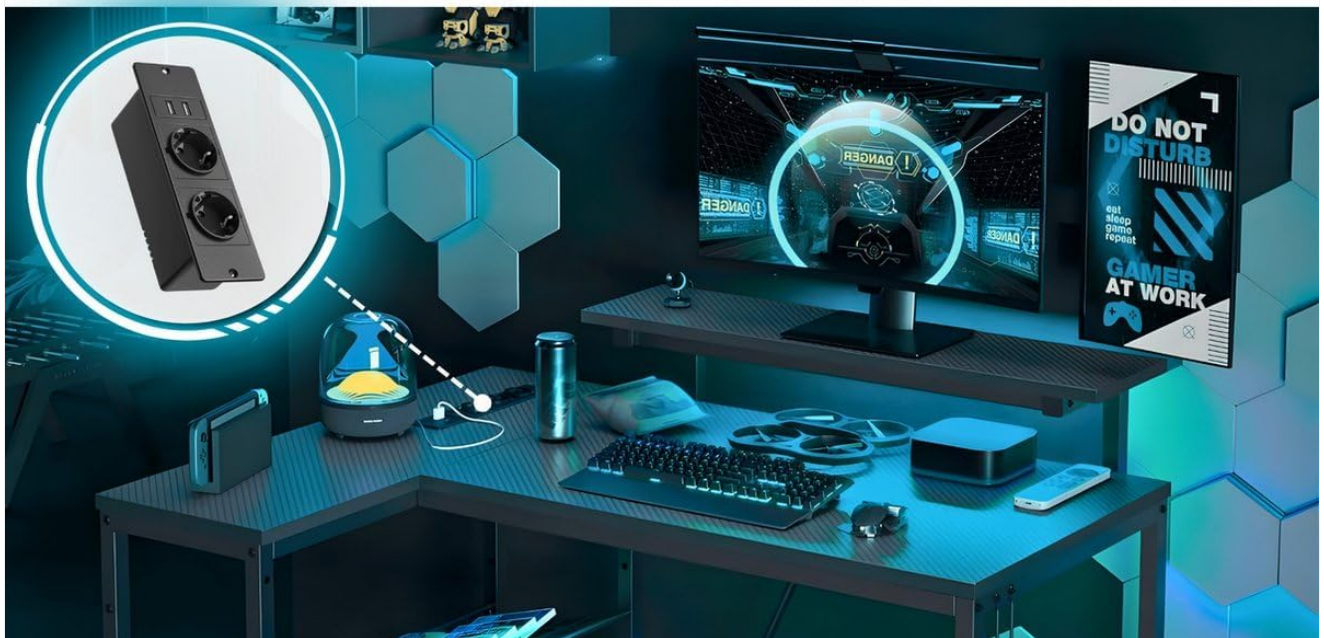
Figure 4.3: Close-up of the integrated power strip, detailing its two outlets, two USB-A ports, and 140cm cable.