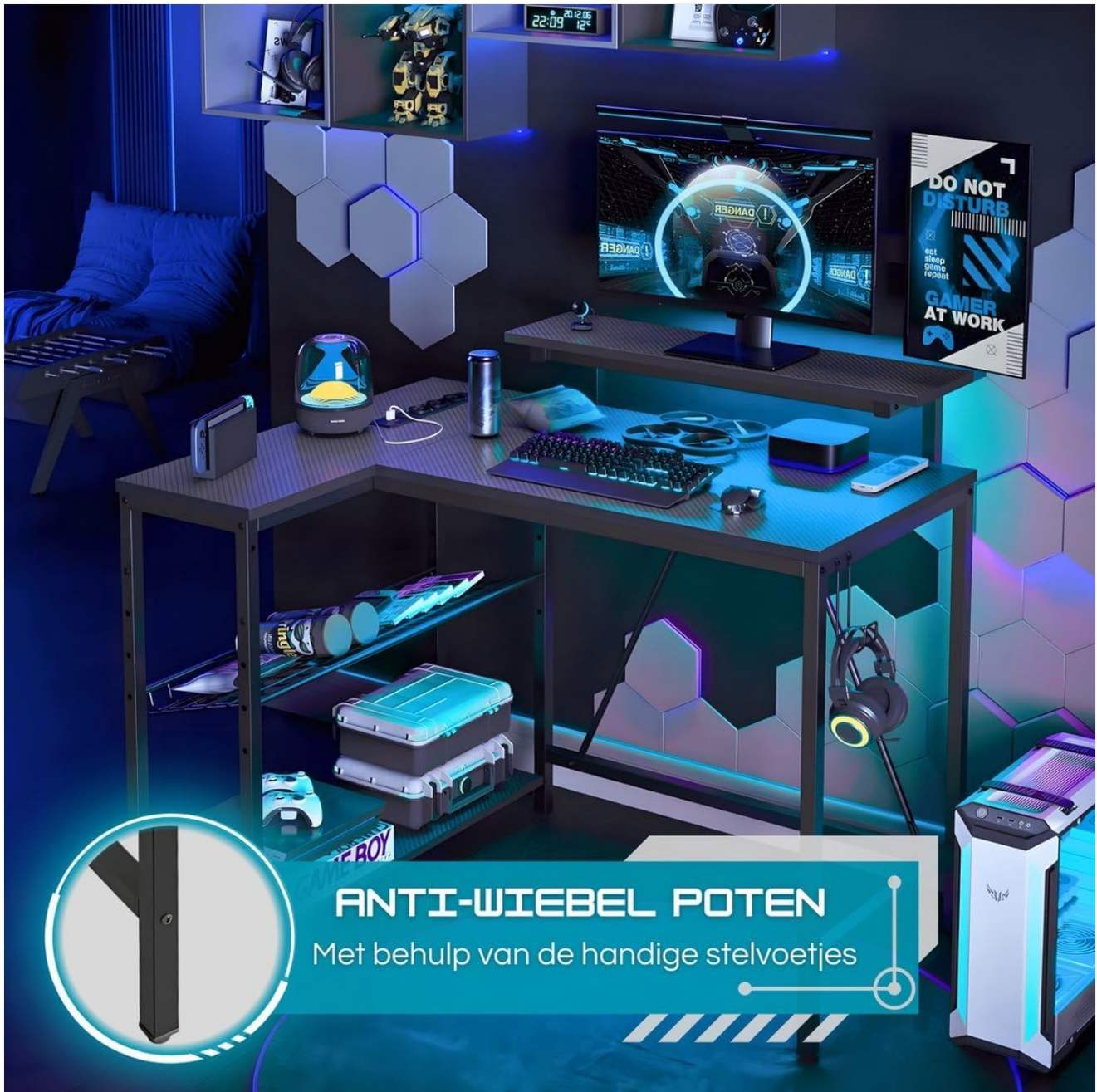
Figure 6.1: Adjustable anti-wobble feet for stabilizing the desk on uneven floors.