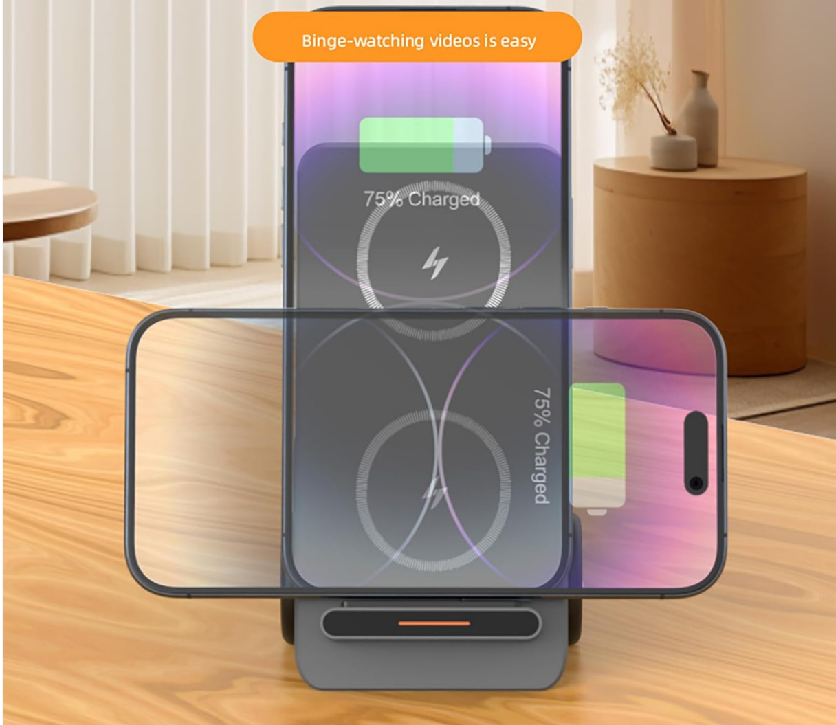
Image: A smartphone charging horizontally on the station, illustrating the dual-coil design that supports both vertical and horizontal device orientation.

It can be filled either way Two coils are automatically identified