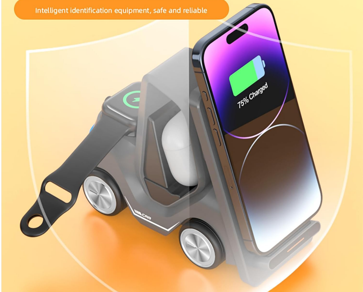
Image: A graphic representation of the charging station with a shield overlay, illustrating the integrated safety protection mechanisms.

Intelligent identification equipment, safe and reliable