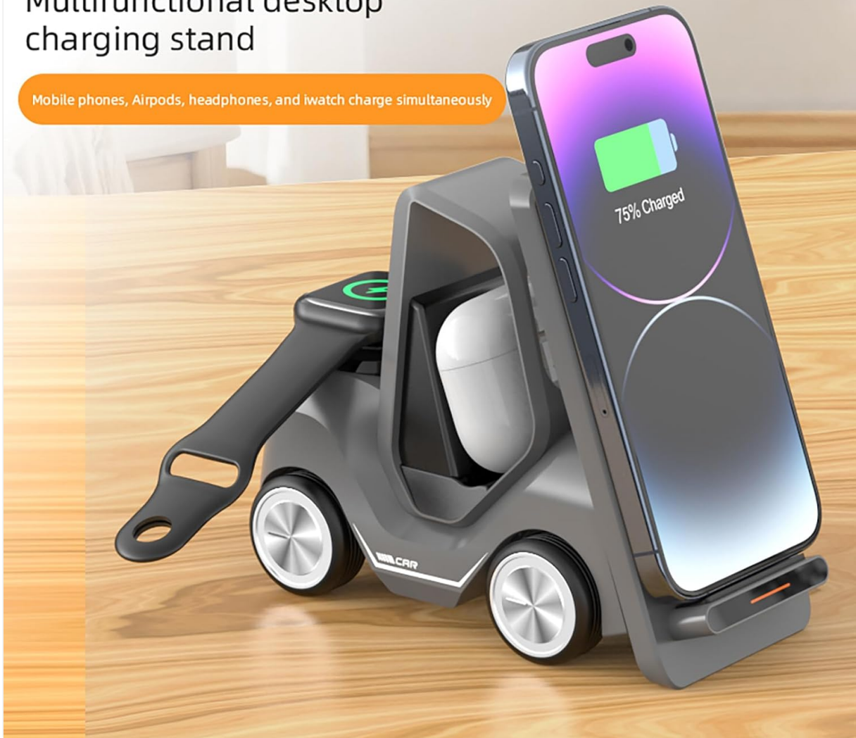
Image: The Diecallan T20S charging station integrated into a desk setup, demonstrating its compact and organized placement.

Mobile phones, Airpods, headphones, and iwatch charge simultaneously