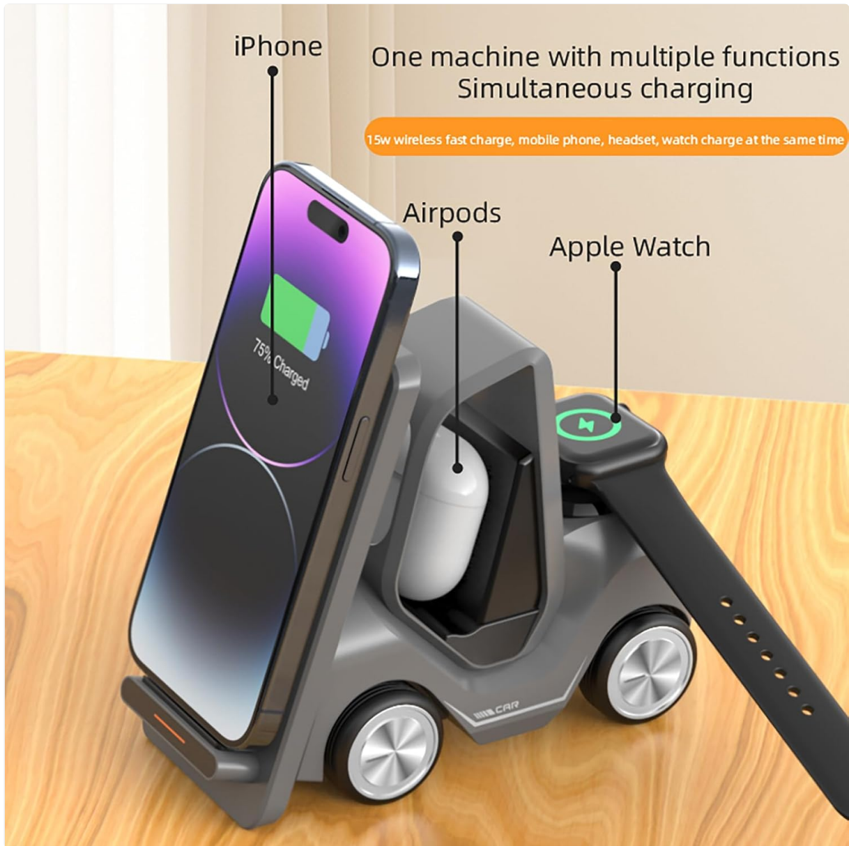
Image: Overview of the Diecallan T20S Wireless Charging Station, highlighting the dedicated charging zones for an iPhone, AirPods, and Apple Watch.