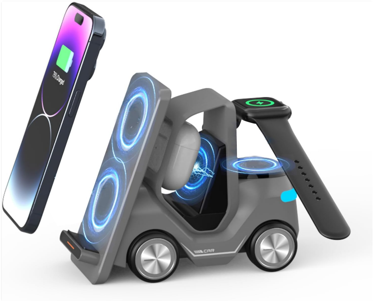
Image: The Diecallan T20S charging station in use, demonstrating simultaneous charging of a smartphone, earbuds, and smartwatch.