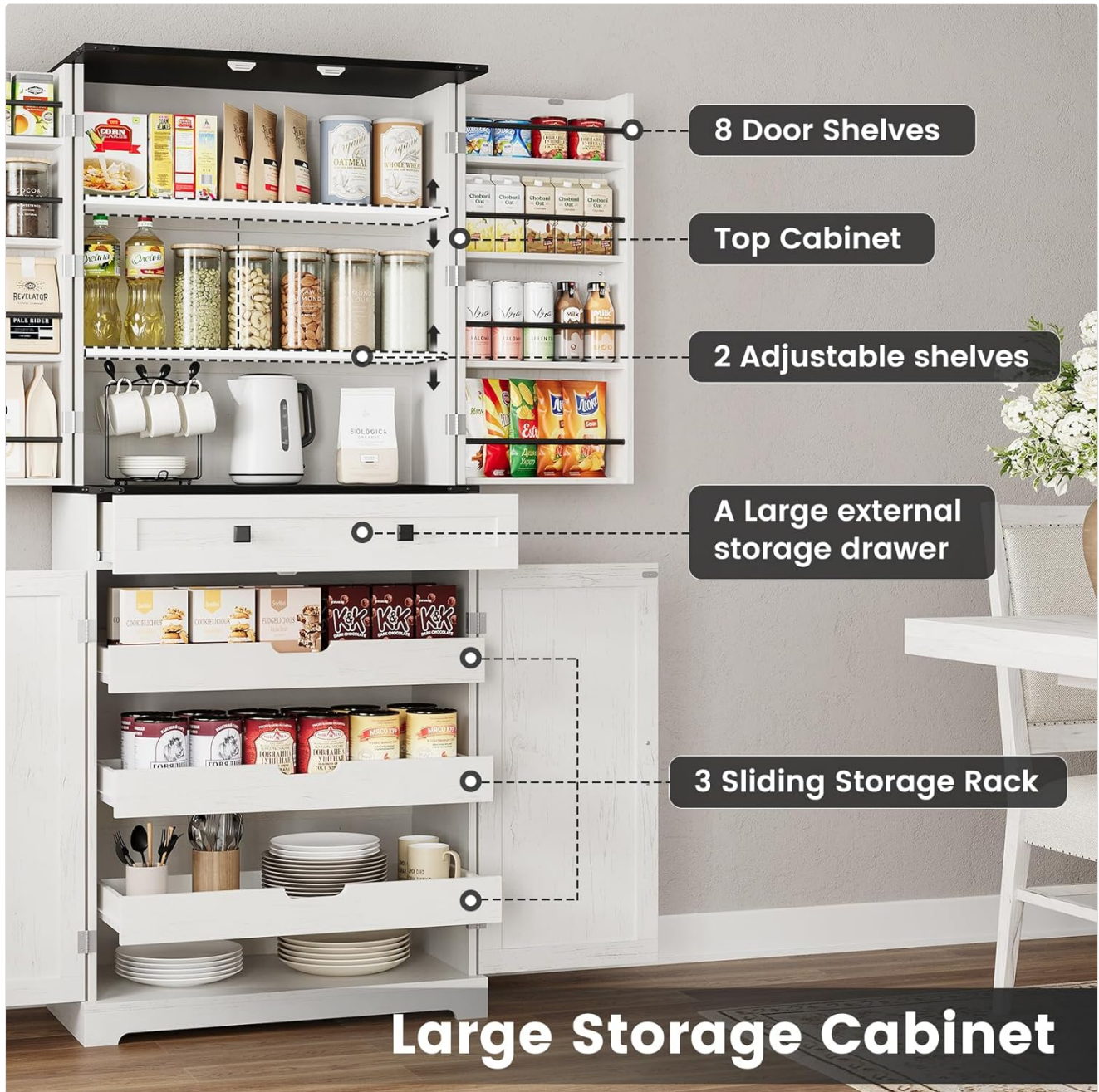
Figure 5.1: Detailed view of the cabinet's internal storage features.