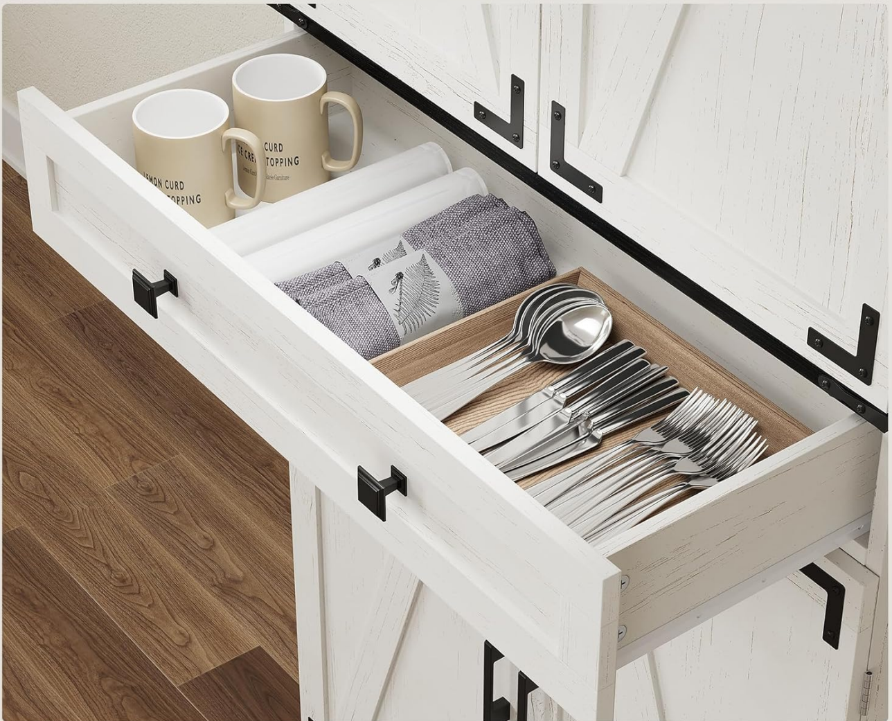
Figure 5.3: The spacious central slide-out drawer.

The slide-out drawer offers easy access and organization, ensuring that items inside are always within reach.