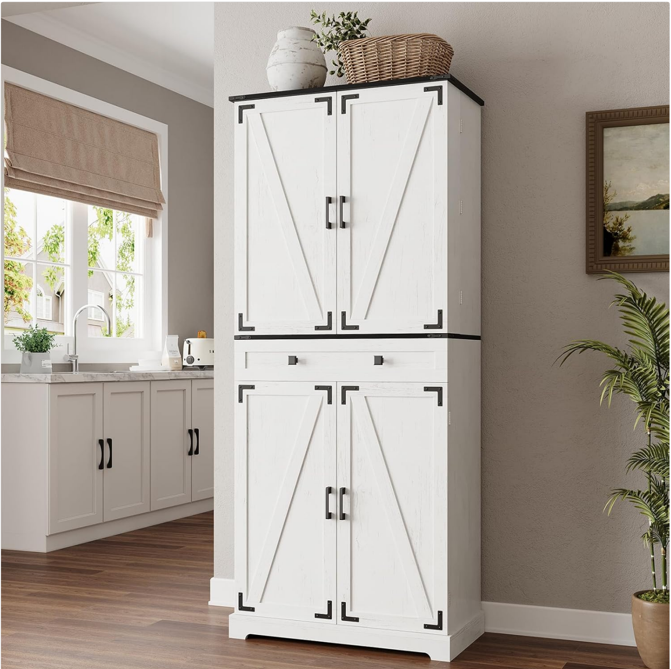
Figure 4.2: ELYKEN Pantry Cabinet in a typical home setting, closed.