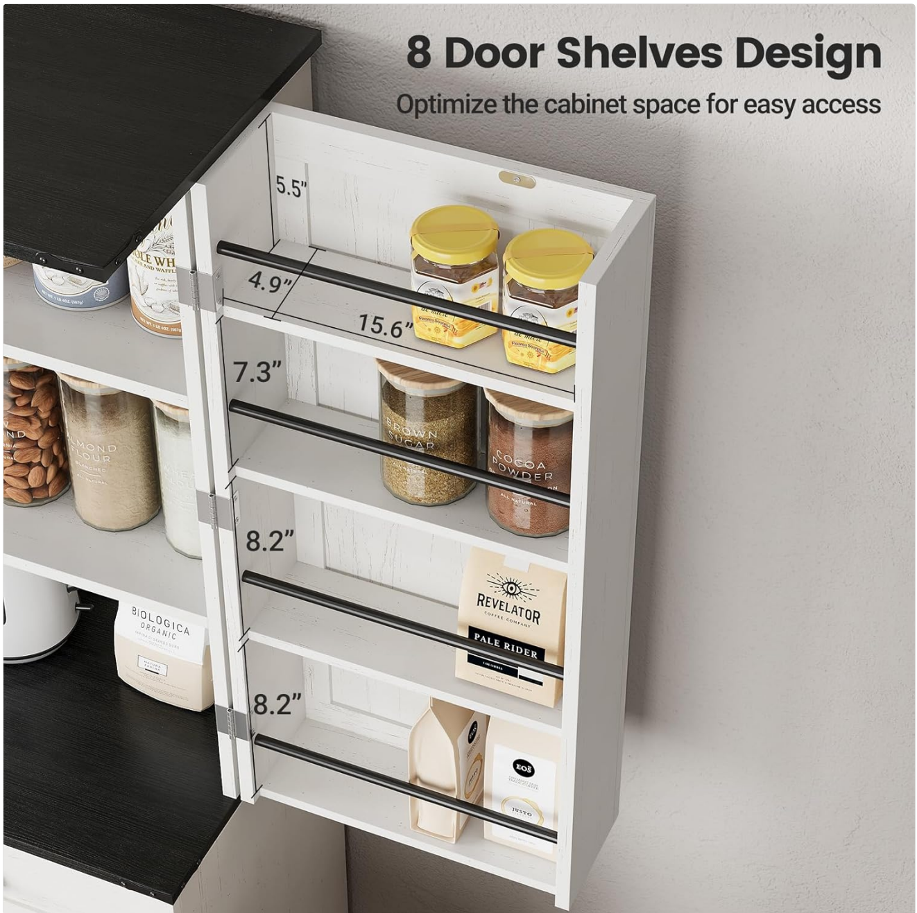
Figure 5.2: Close-up of the eight door shelves for small item organization.

Optimize the cabinet space for easy access