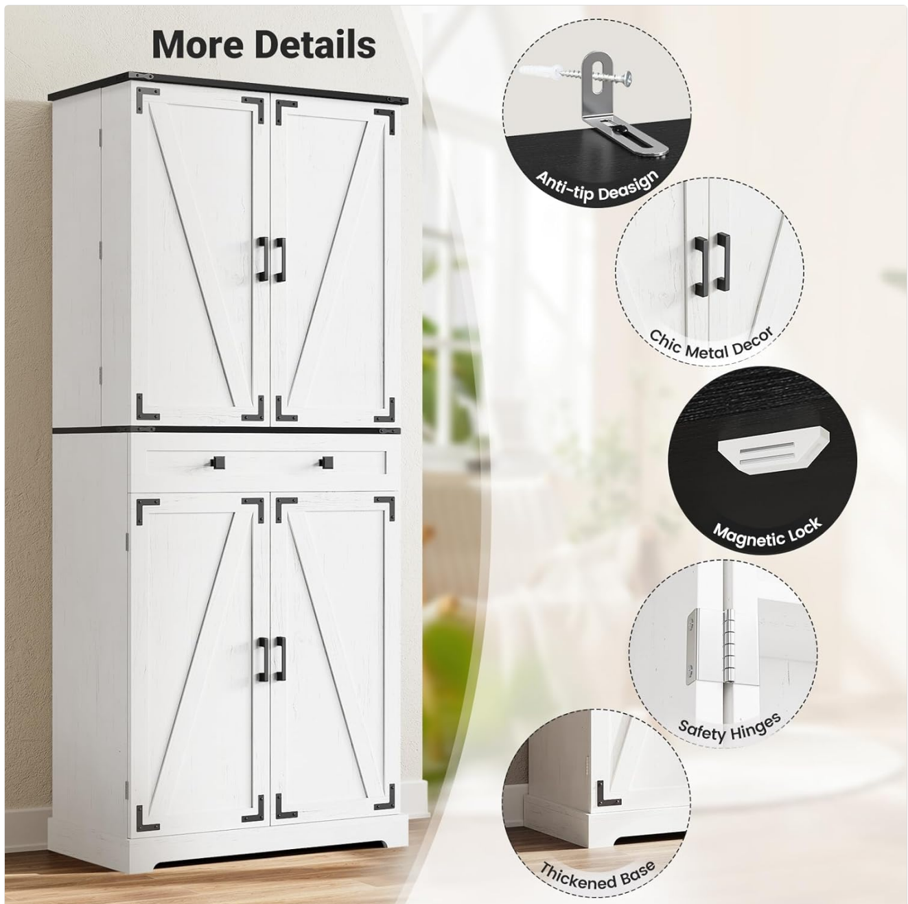
Figure 5.5: Key design and safety details.