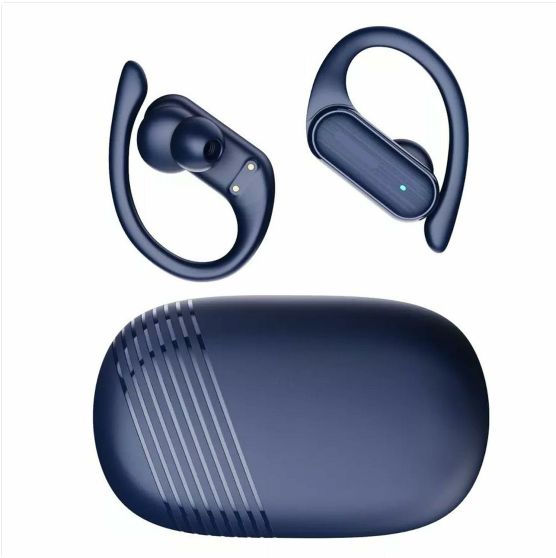
Image: The A520 True Wireless Earbuds shown outside their charging case, alongside the compact charging case.