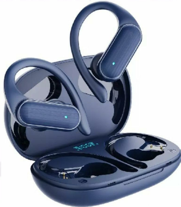
Image: The A520 charging case with earbuds inserted, displaying the digital battery indicator and illustrating the magnetic suction charging feature.