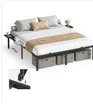
Image: Detail of the powder-coated metal frame components, highlighting their robust construction.