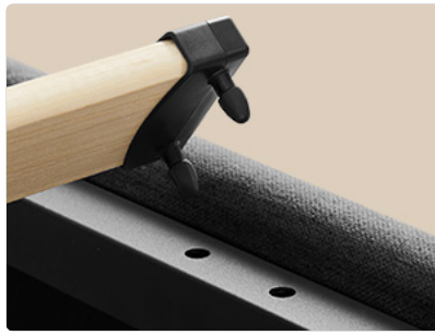
Image: Detail of the sponge pads on the frame, which prevent friction and noise.