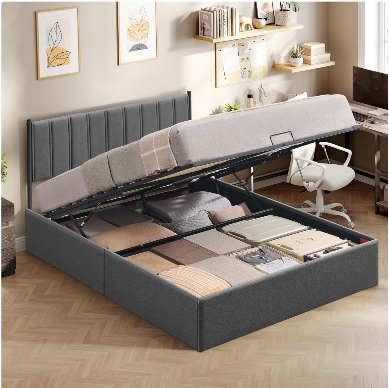
Image: The VASAGLE bed frame with its hydraulic lift mechanism raised, revealing a large storage compartment underneath. Various items like luggage, blankets, and clothes are neatly stored within.