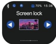
Screen lock Bloqueo de pantalla