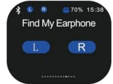
Find My Earphone Busca mis auriculares