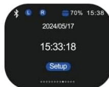
Time display Visualización del tiempo