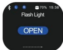
Flash Light Flash