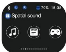
Spatial sound Sonido espacial