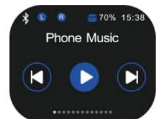
Phone Music Música móvil