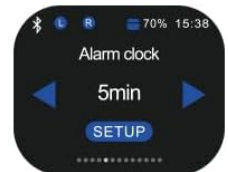
Alarm clock Despertador