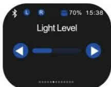
Light Level Nivel de luz