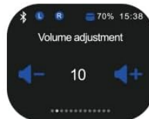
Volume adjustment Ajuste de volumen