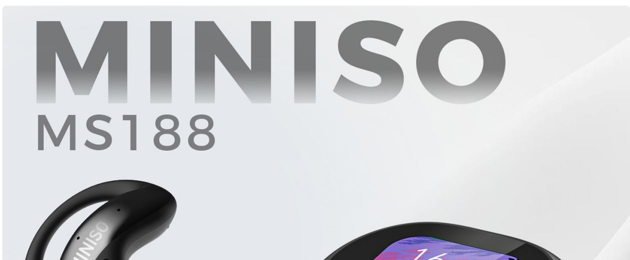
Figure 1: MINISO MS188 AI Language Translation Earbuds Overview

The MINISO MS188 Ai Language Translator Earbuds are designed to facilitate seamless communication across language barriers. These innovative earbuds combine real-time translation capabilities with high-quality audio, all managed through an intuitive LCD touchscreen charging case. Their open-wearable stereo (OWS) design ensures comfort for extended use while maintaining environmental awareness.