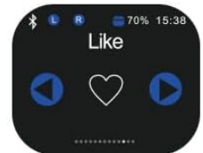
Give the thumbs-up Levanta el pulgar