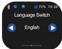
Language Switch Cambio de lenguaje