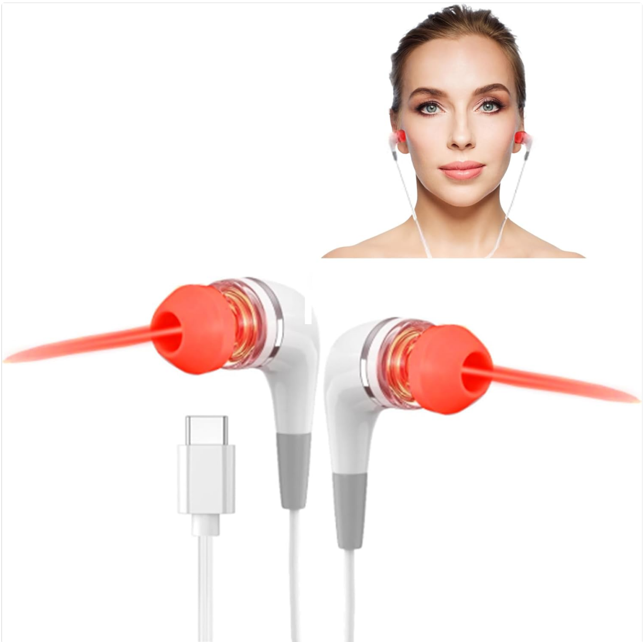
Image: The Red Light Earbuds with their USB connector, showing the red light emission. An inset image displays a user wearing the earbuds.