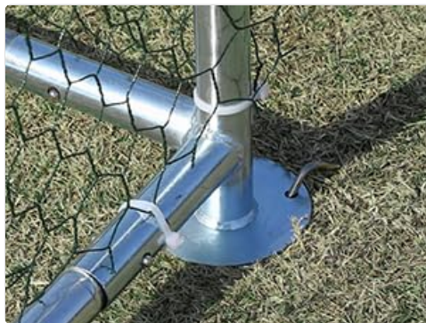
Image 4.2: Detail of the durable metal bottom connection point, essential for ground anchoring.