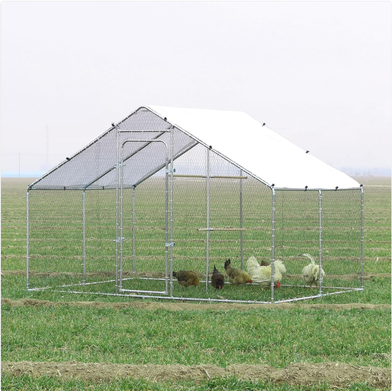
Image 1.1: Fully assembled walnest chicken coop providing a secure outdoor space for poultry.