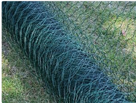
Image 3.1: Example of PVC coated hexagonal wire mesh included in the package.