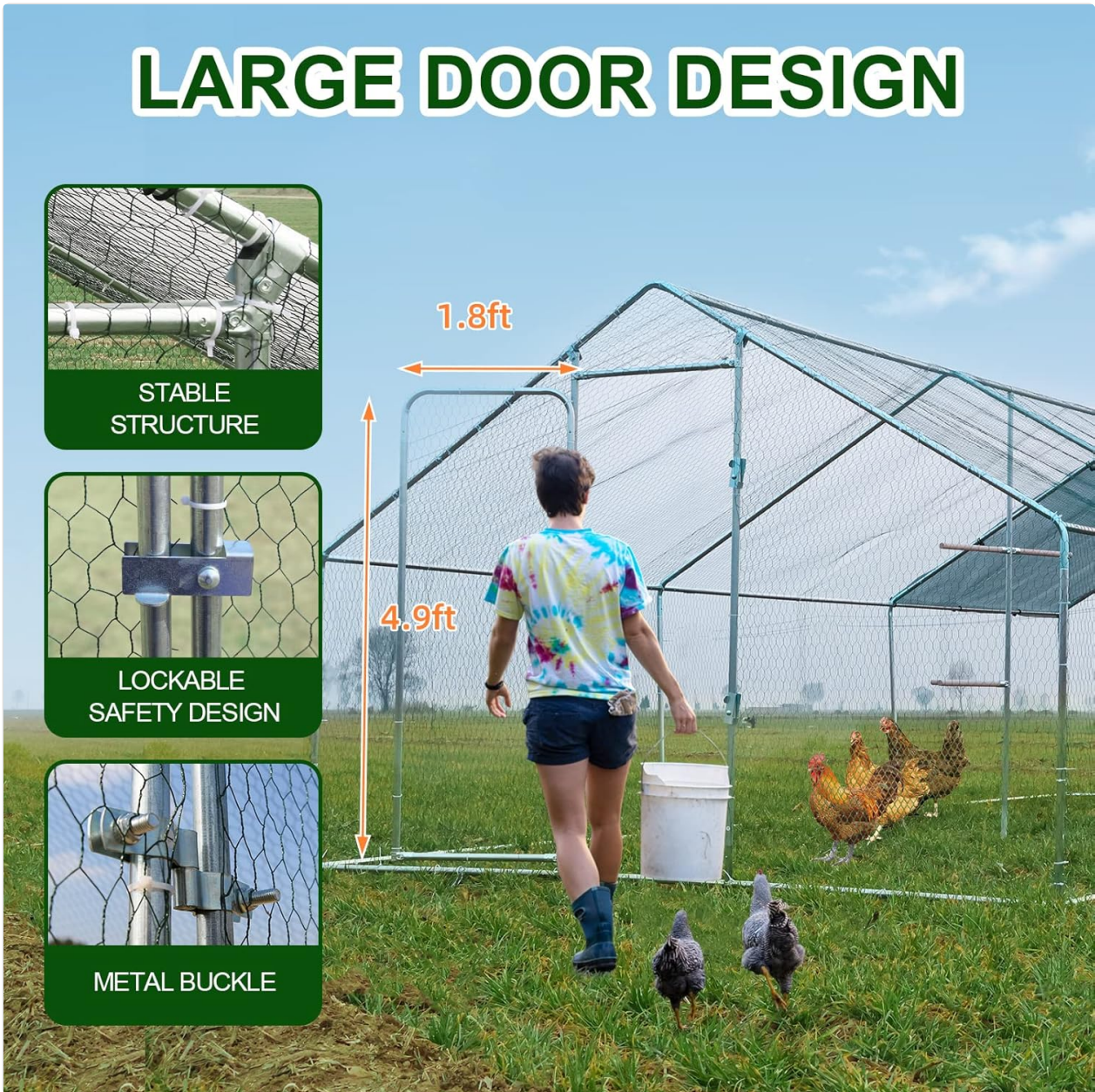
Image 5.1: The large door design facilitates easy access for caregivers.