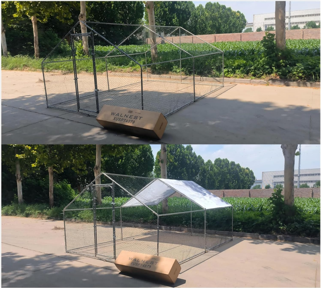
Image 4.1: Assembly progression showing the frame structure and the roof cover installation.