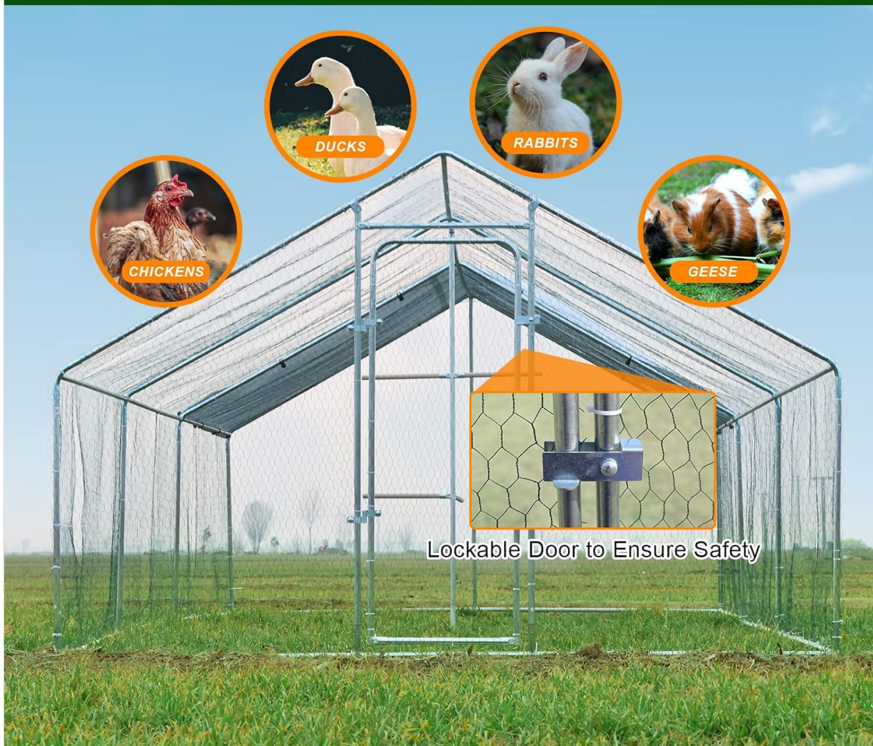
Image 5.2: The coop is suitable for a variety of small pets to rest and play.