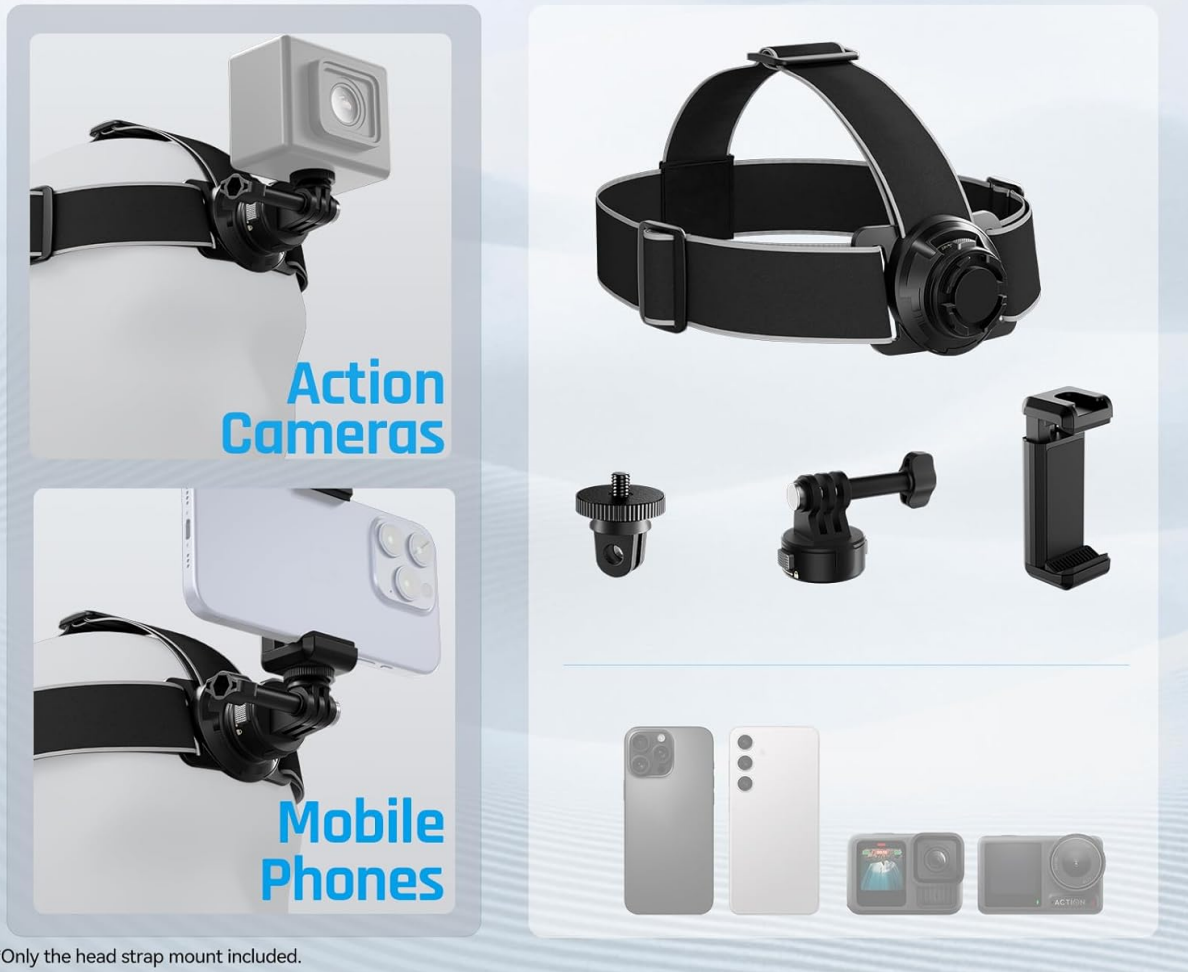
Image: The head mount shown with both an action camera and a smartphone attached, highlighting its wide compatibility. Various camera and phone models are depicted as examples of compatible devices.

Comes with a phone clip (width: 6cm- 9cm), which is compatible with most action cameras and mobile phones.