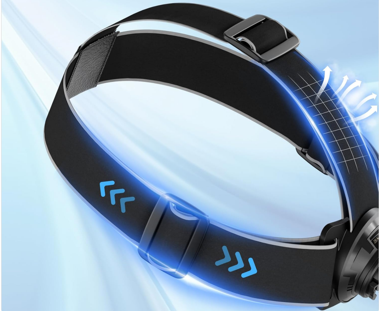
Image: A detailed view of the high-quality elastic head strap, featuring adjustable buckles for a comfortable and secure fit. The design also indicates breathability for extended wear.

Use high-quality elastic band to fit comfortably even when recording videos for a long time.