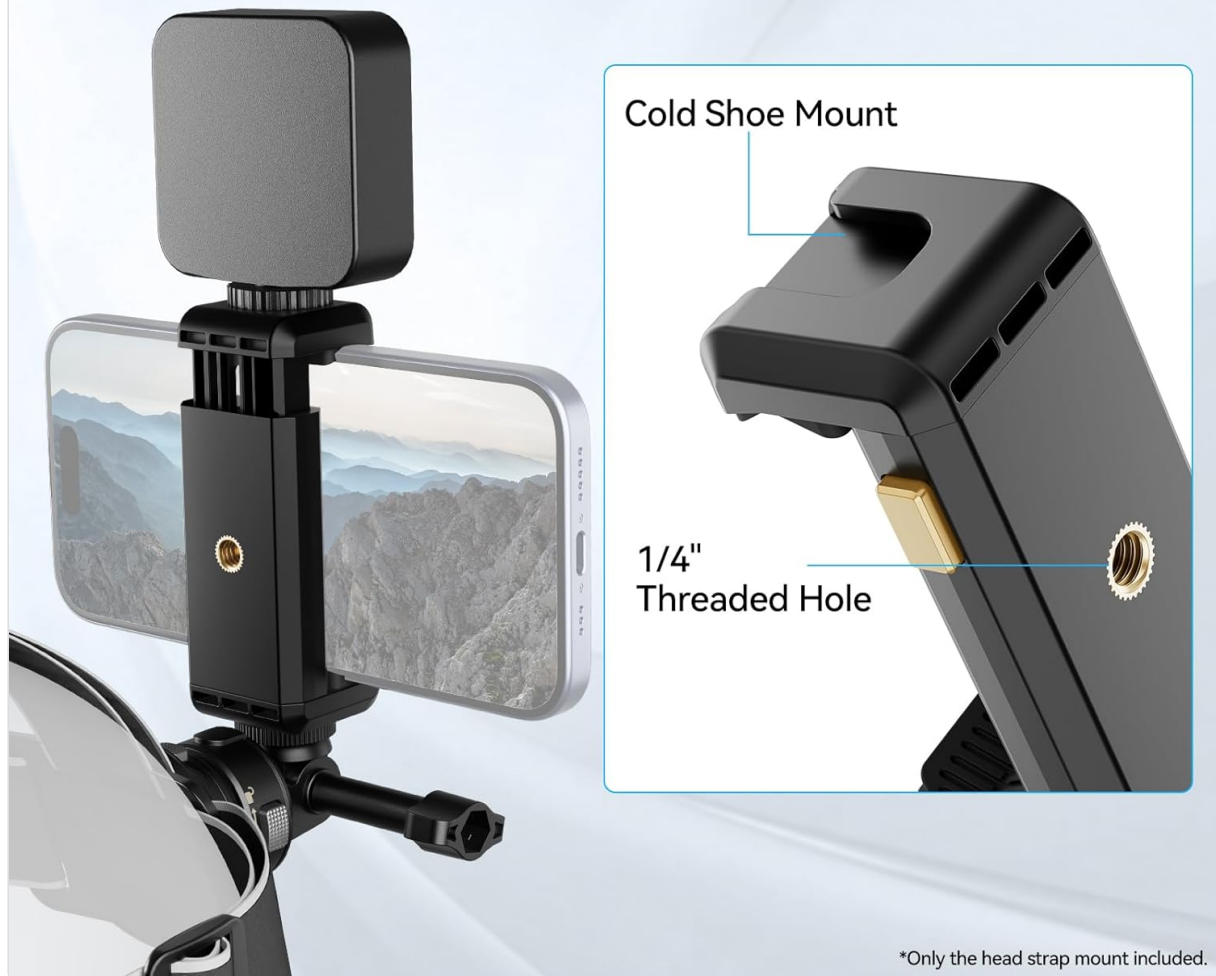
Image: A close-up of the phone clamp accessory, detailing its 1/4-inch threaded hole for mounting on the head strap and a cold shoe mount for attaching additional accessories like lights or microphones.