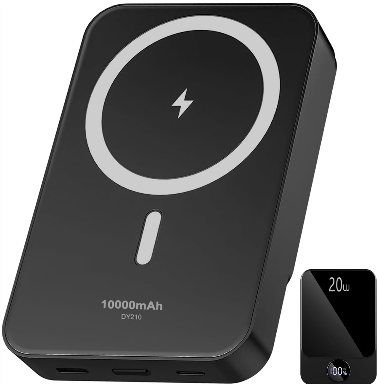
Image 2.1: Front view of the Matast DY210 Magnetic Portable Charger, showing the magnetic charging area and 10000mAh capacity label.