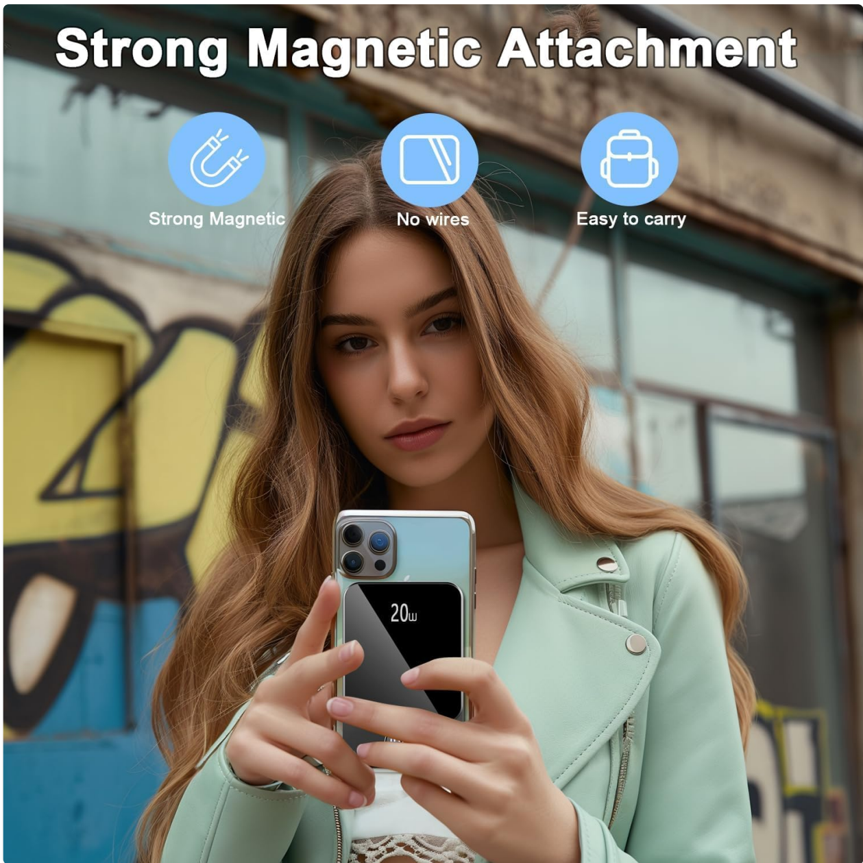
Image 5.2: A user holding a smartphone with the Matast DY210 securely attached for magnetic wireless charging.

This image shows the power bank's strong magnetic attachment to a phone, allowing for portable wireless charging.