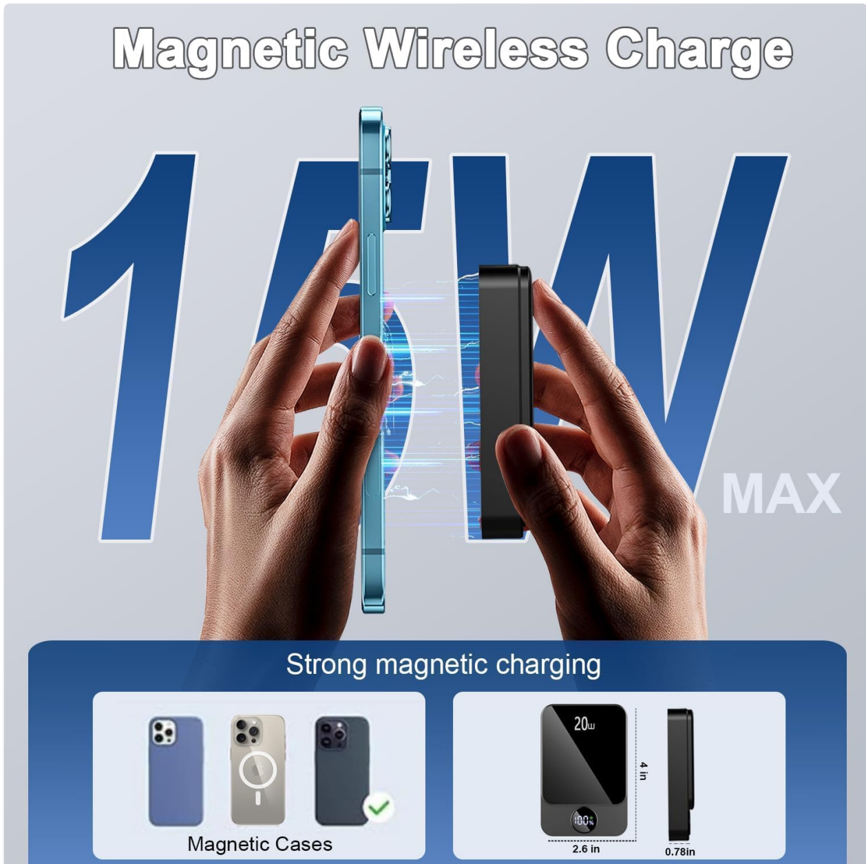
Image 5.1: A smartphone being charged wirelessly by the Matast DY210 via magnetic attachment.

This image demonstrates the magnetic attachment of the power bank to a smartphone for wireless charging.