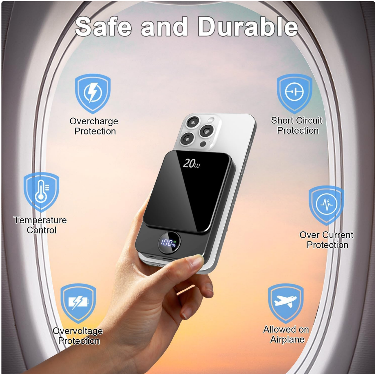
Image 8.1: Visual representation of the Matast DY210's integrated safety protections.

This image highlights the various safety features built into the power bank, such as protection against overcharge, short circuits, and temperature control.