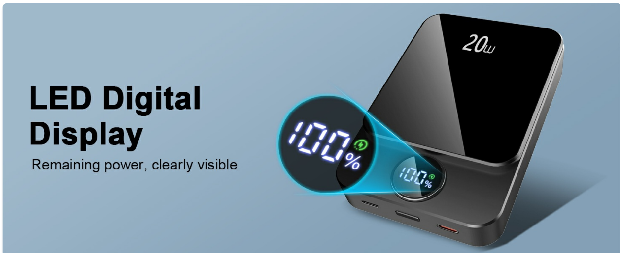
Image 4.1: The LED digital display showing the battery percentage.

This image provides a clear view of the power bank's digital display, indicating the remaining charge.