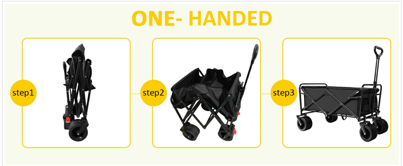
Image: Visual guide demonstrating the three-step process of unfolding the wagon from its compact state to its operational form.