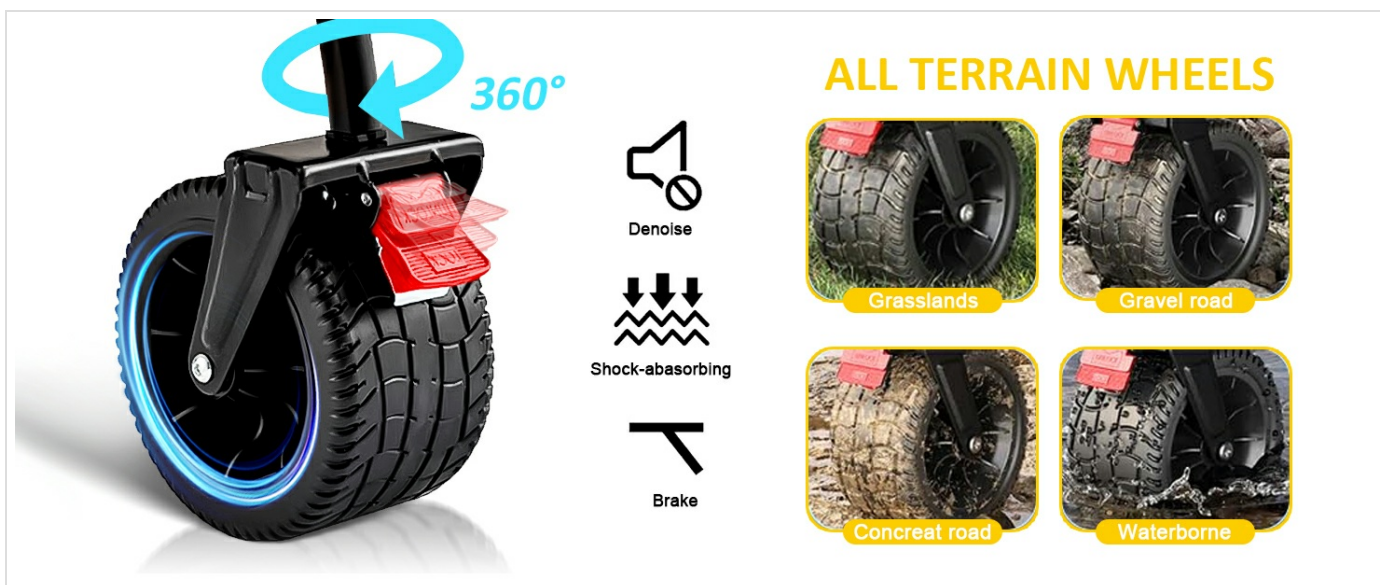
Image: Detailed view of the all-terrain wheel, illustrating its shock-absorbing, low-noise design, and the brake function, suitable for diverse ground types.