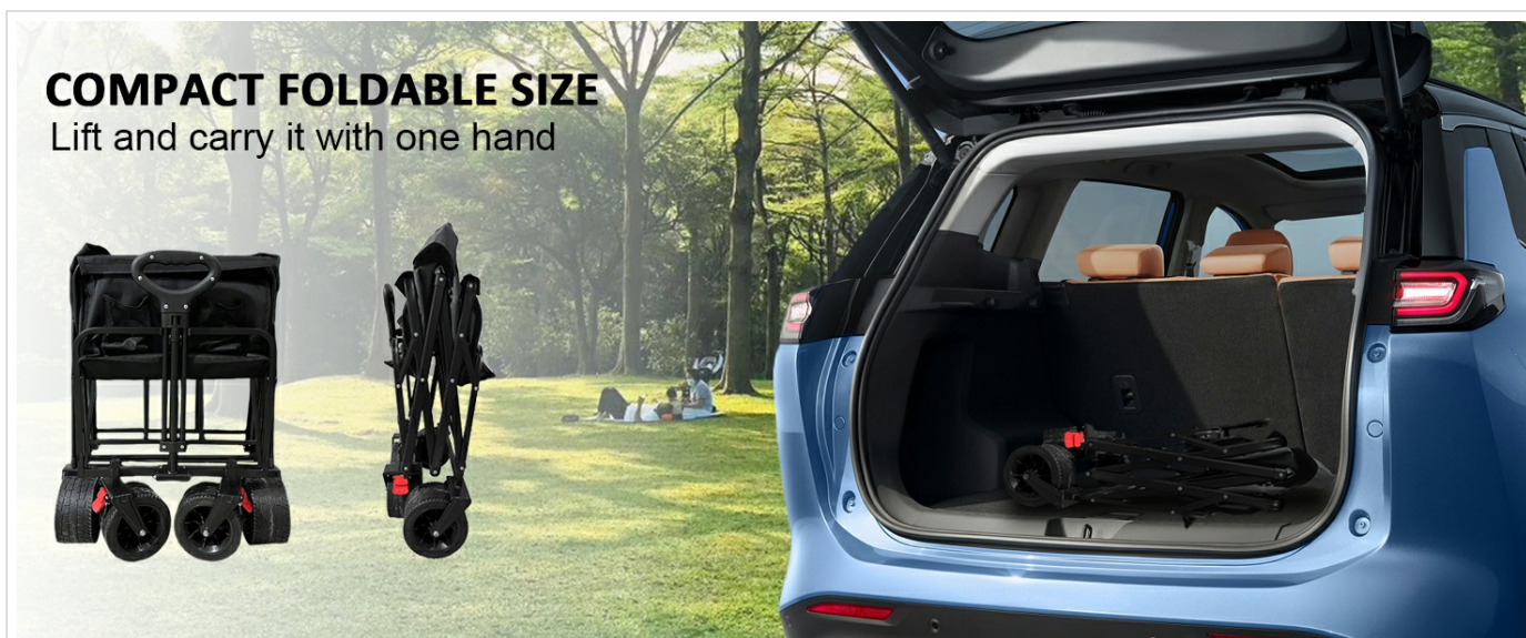
Image: The wagon in its compact, folded state, demonstrating how easily it can be stored in a vehicle's trunk, highlighting its portability.