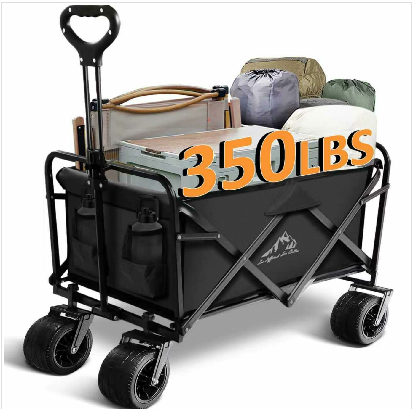
Image: The VOYSIGN Foldable Wagon Cart in its fully assembled, open configuration, showcasing its spacious interior and sturdy wheels.