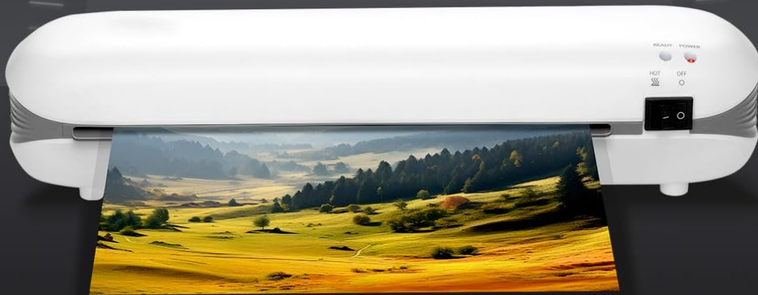
Image 4.1: The laminator features a quick preheat time of 3-4 minutes and a laminating speed of 13.4 inches per minute for efficient performance.