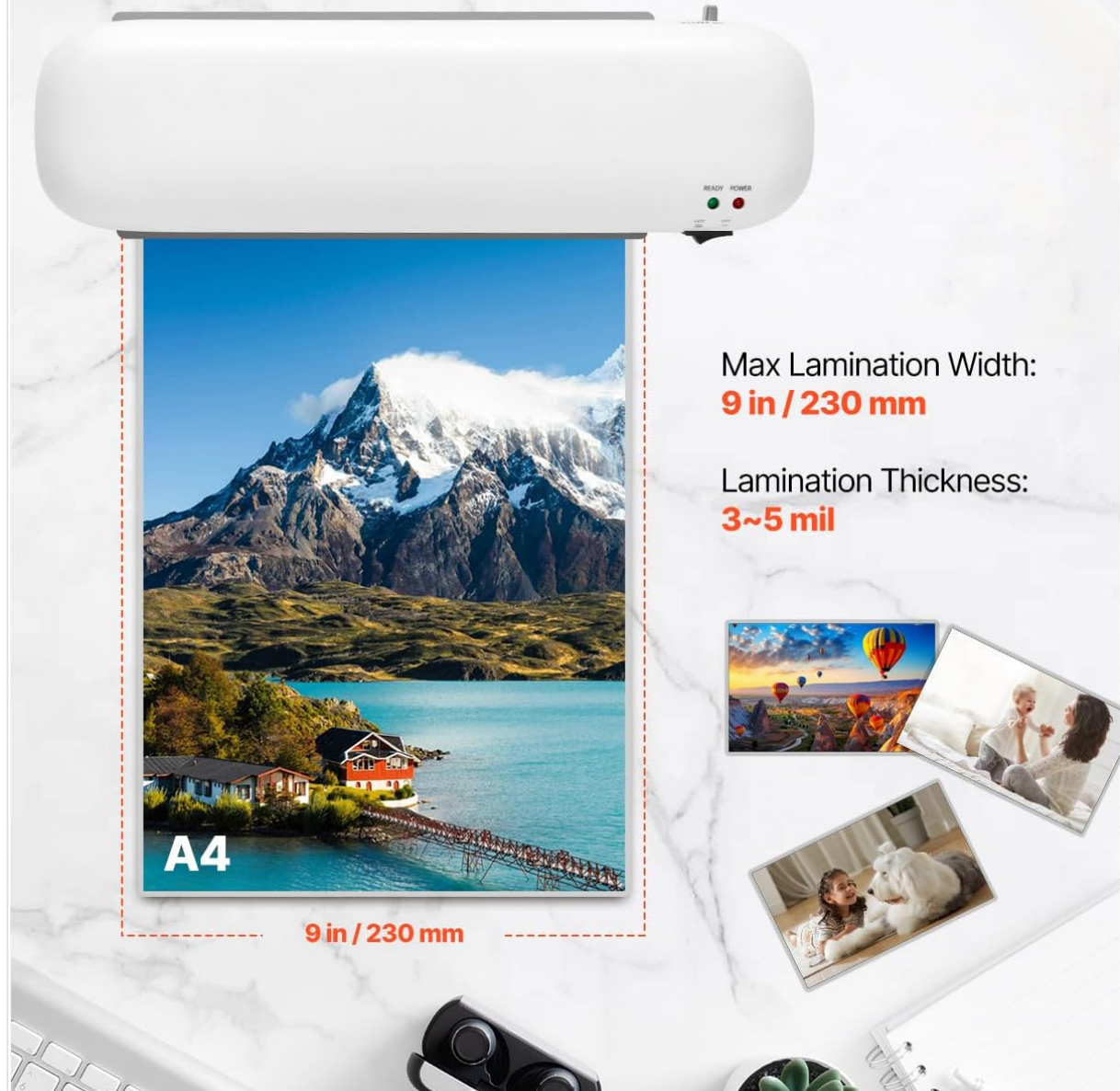
Image 5.1: The Happybuy SL288 laminator supports A4 and smaller paper sizes, with a maximum lamination width of 9 inches and film thickness of 3-5 mil.