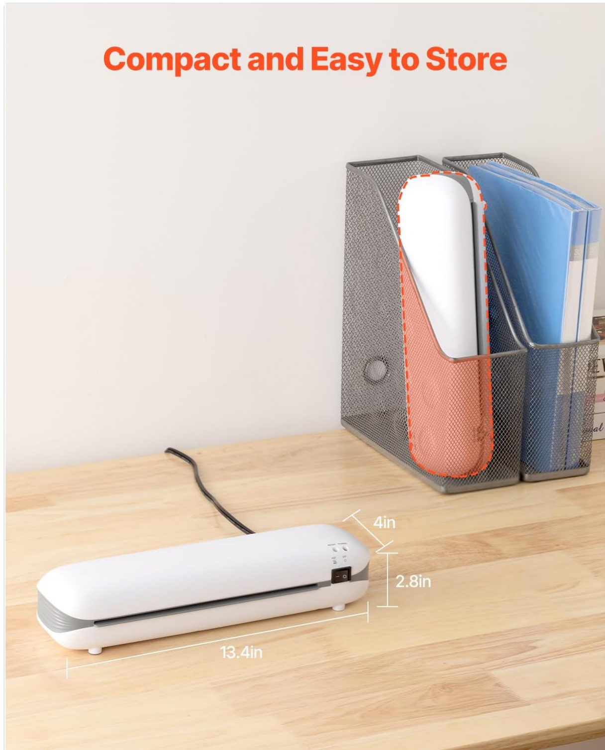
Image 6.1: The compact design of the Happybuy SL288 laminator makes it easy to store on a desk or in a small space.

When not in use, store the laminator in a dry, dust-free environment. Its compact design allows for easy storage.