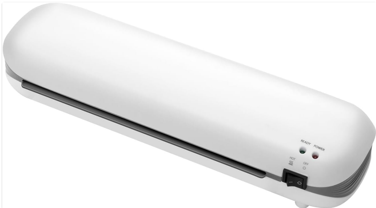
Image 3.1: Front view of the Happybuy SL288 laminator, highlighting the power switch, power indicator, and ready indicator lights.