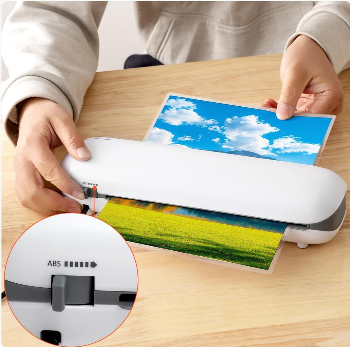
Image 5.2: The one-touch ABS button allows for quick removal of jammed documents, protecting your valuable items.

Simply Press the ABS Button to Quickly Remove the Film