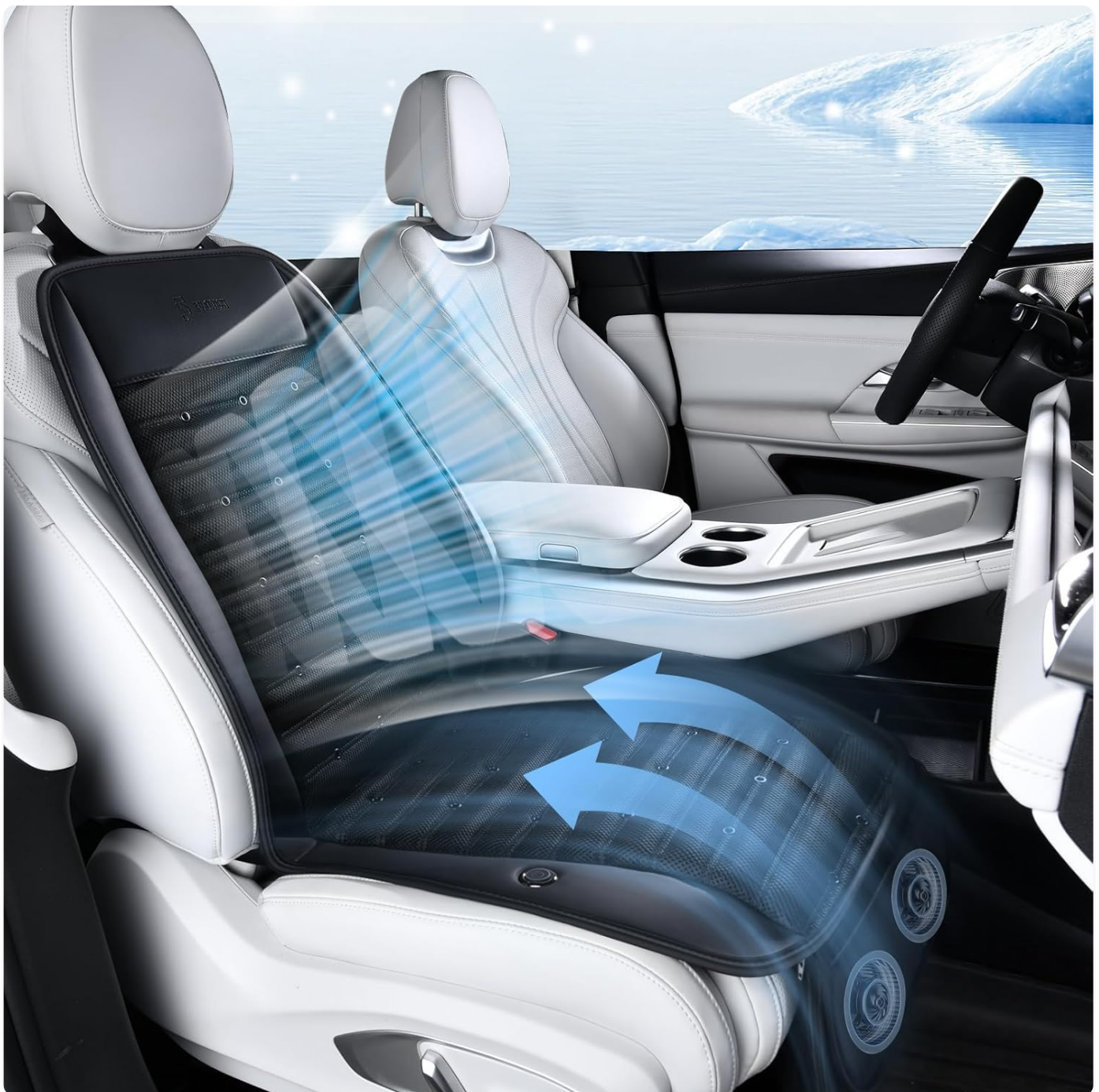
Image: The FLORICH Cooling Car Seat Cover in a car interior, illustrating the cooling airflow.