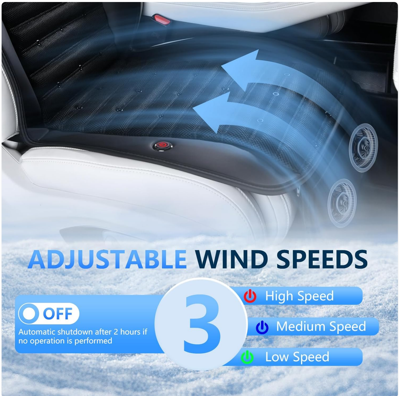
Image: Control interface for adjusting wind speeds and auto-off feature.