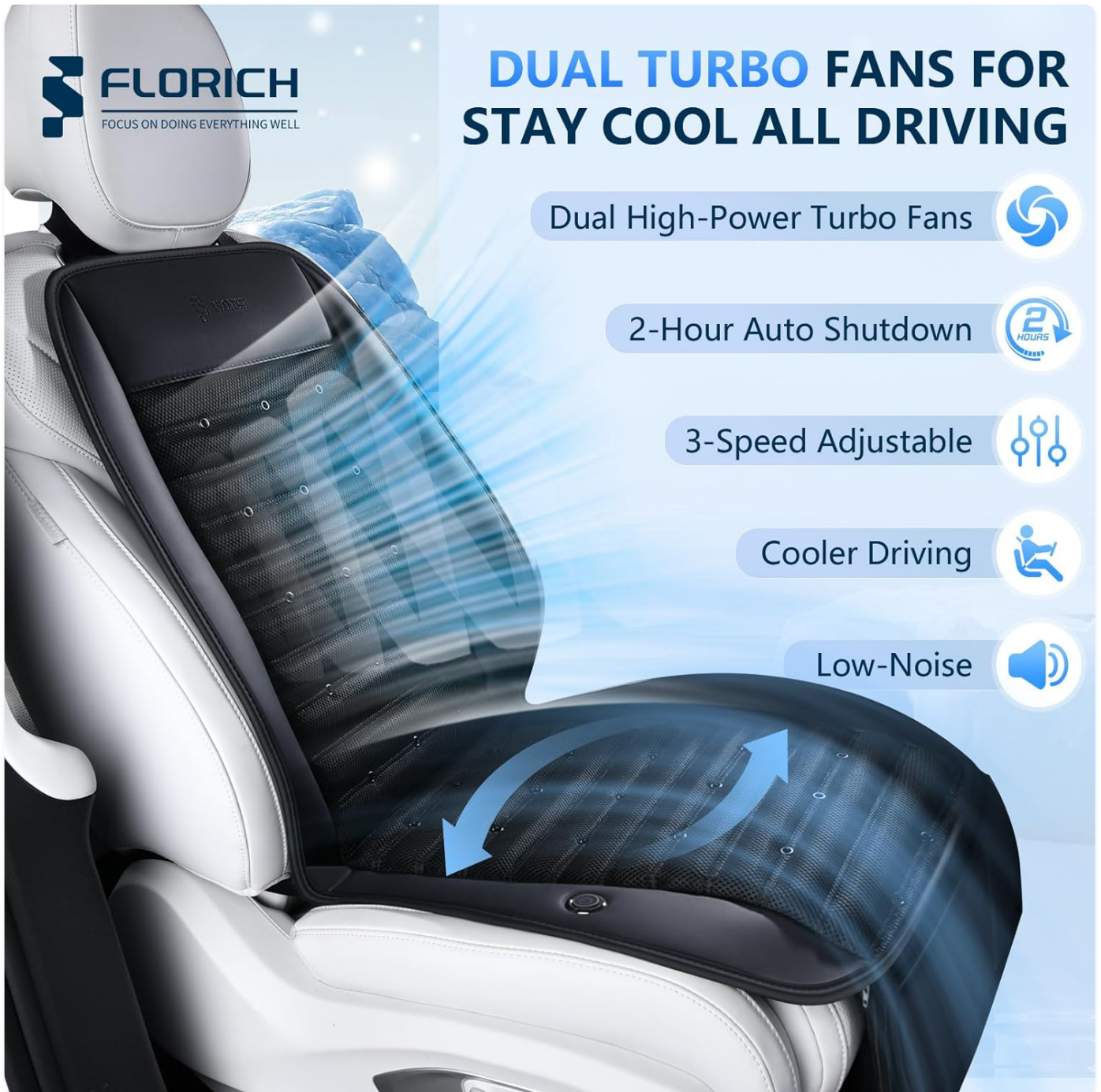
Image: Visual representation of the dual turbo fans and key features of the seat cover.