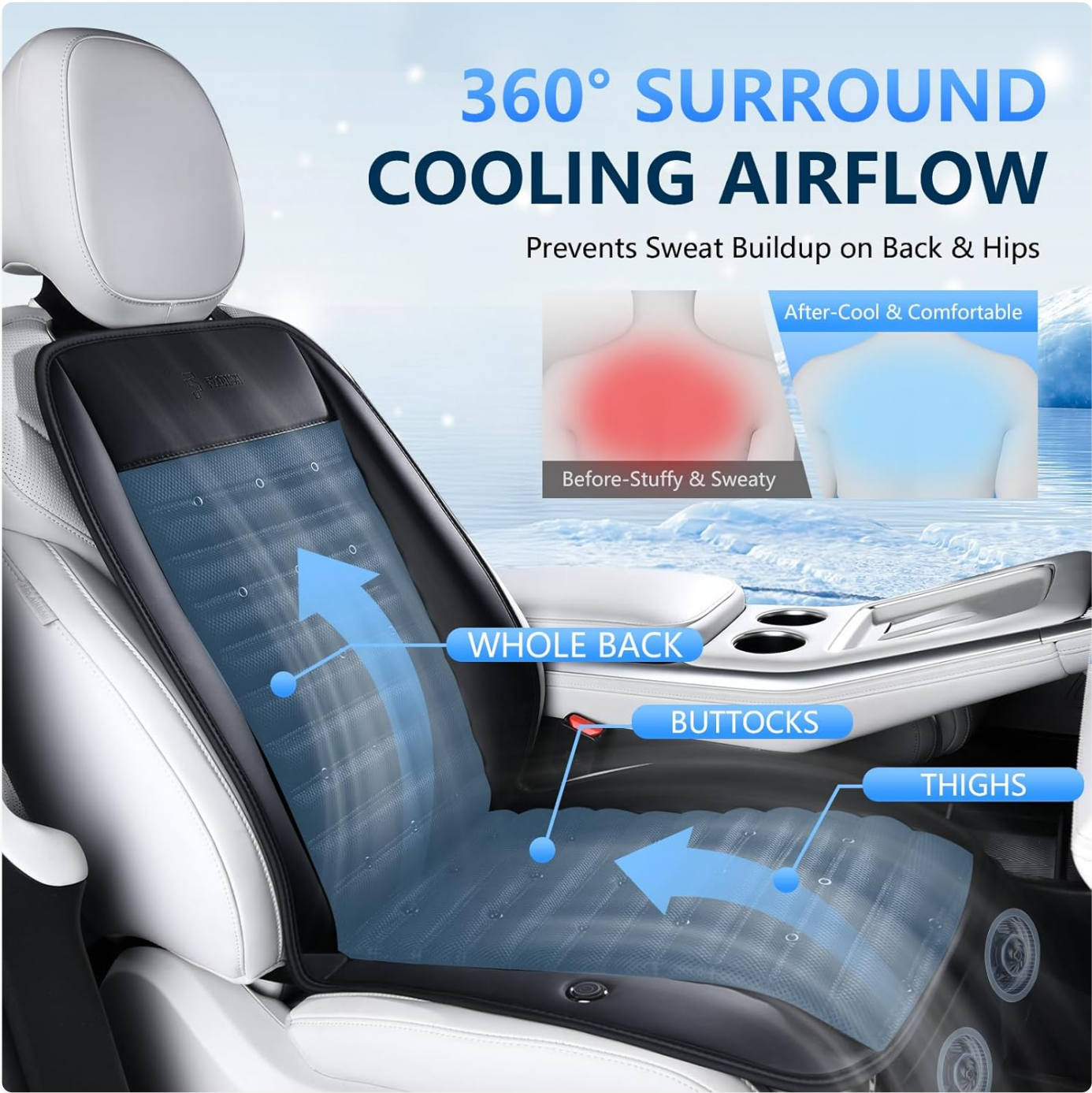
Image: Illustration of the 360-degree surround cooling airflow across the seat.