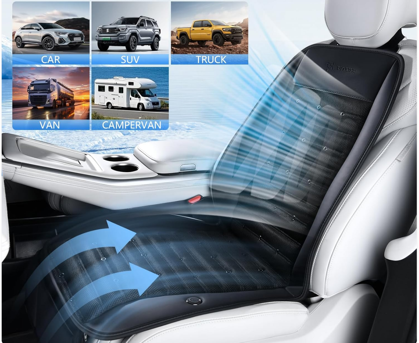
Image: Depiction of the universal design, fitting various vehicle types.