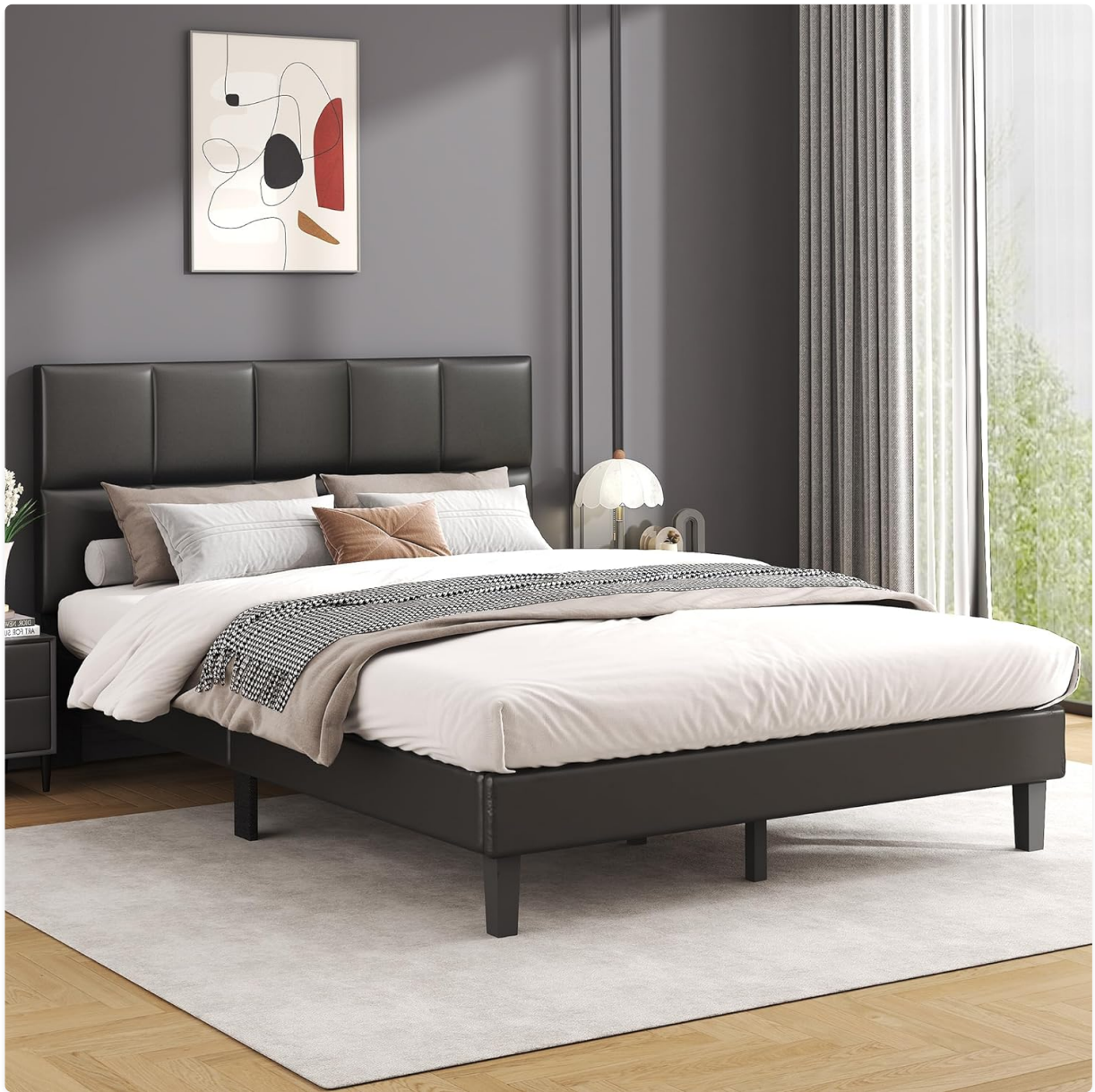
A fully assembled Shintenchi Full Size Bed Frame with a black leather upholstered headboard, shown in a modern bedroom.