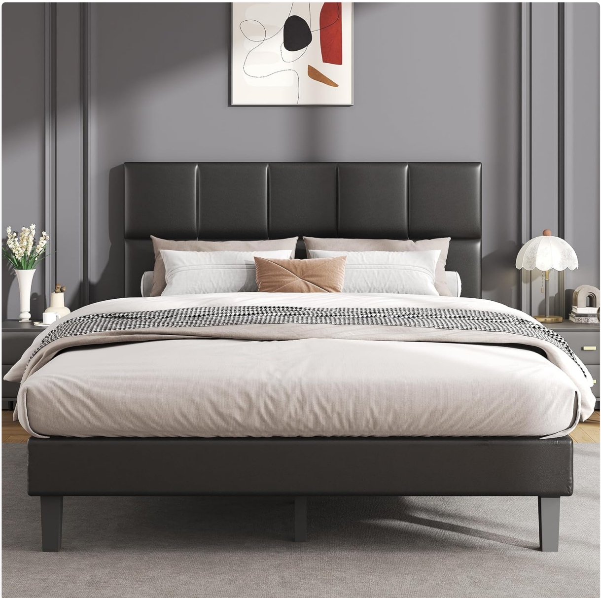
The Shintenchi Full Size Bed Frame viewed from the front, highlighting the black leather upholstered headboard and the overall structure.