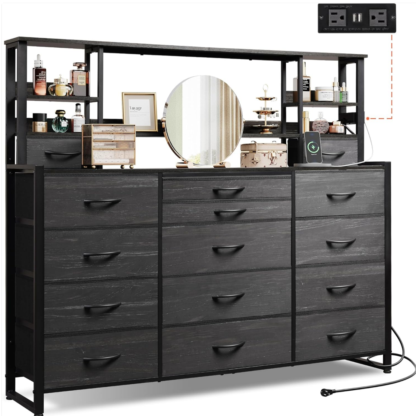
Figure 1: Overall view of the WLIVE Storage Organizer Unit, showcasing its multiple drawers and open shelving.