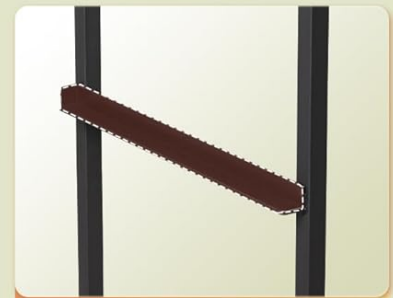
Solid Drawer Slides