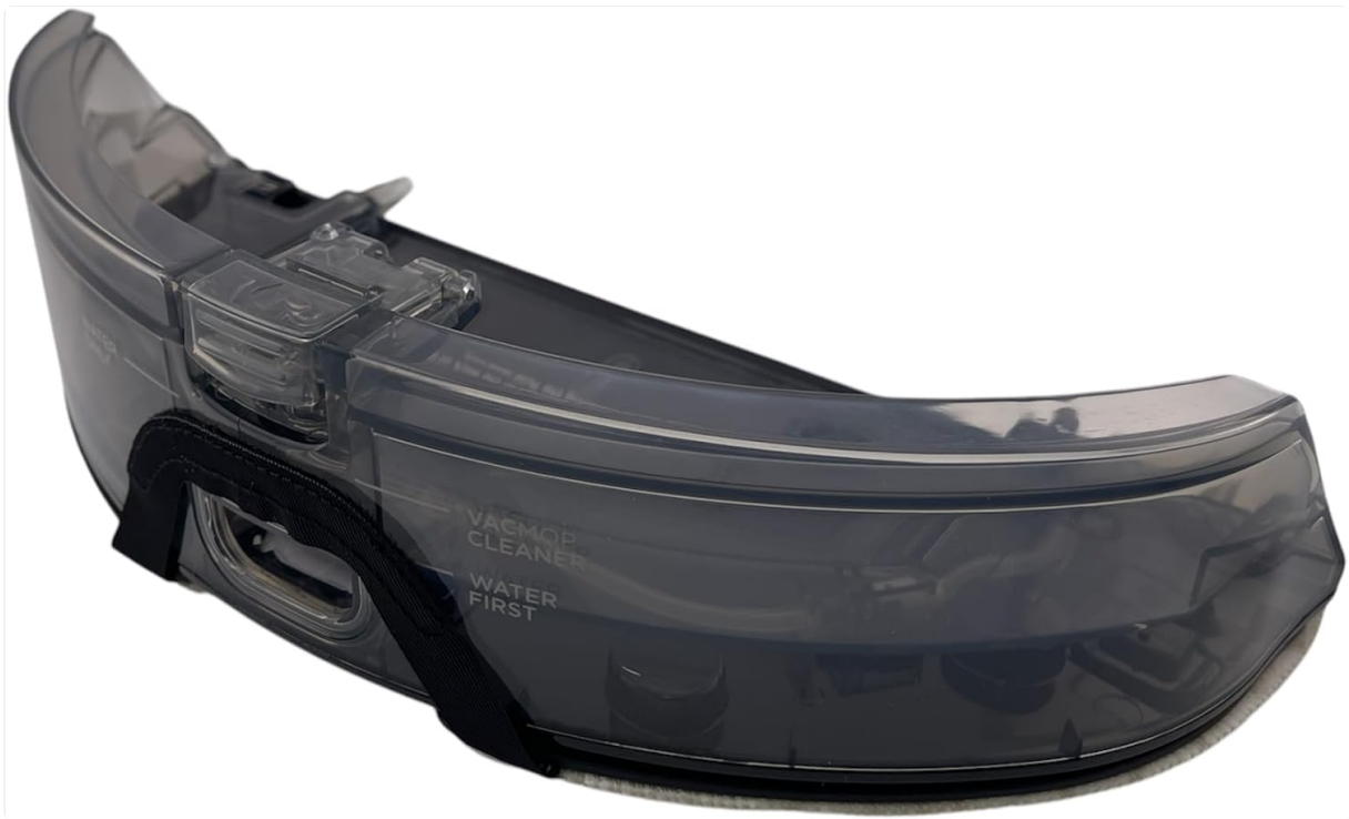
Figure 4: Side view of the replacement water tank with the included mop pad attached.