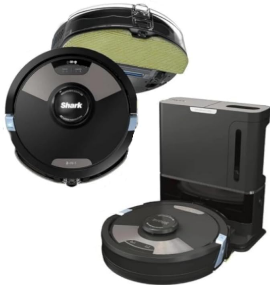
Figure 2: Visual guide for compatible and incompatible Shark robot vacuum models.

RV2400WD, RV2400WXUS, RV2402WD, RV2402WXUS, RV2410WD, RV2410W0US, UR2450WXUS, UR2450WD, RV2600WD, RV2610WD, RV2610WDCA, RV2610WFUS, RV2610WZUS, RV2620WD, RV2620WDCA, RV2620WFCA, RV2620WFUS, RV2620WZUS