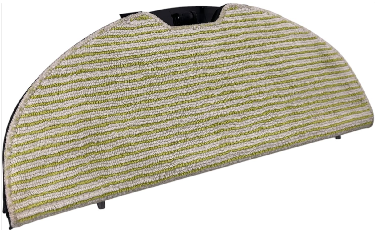
Figure 5: Close-up view of the replacement mop pad.