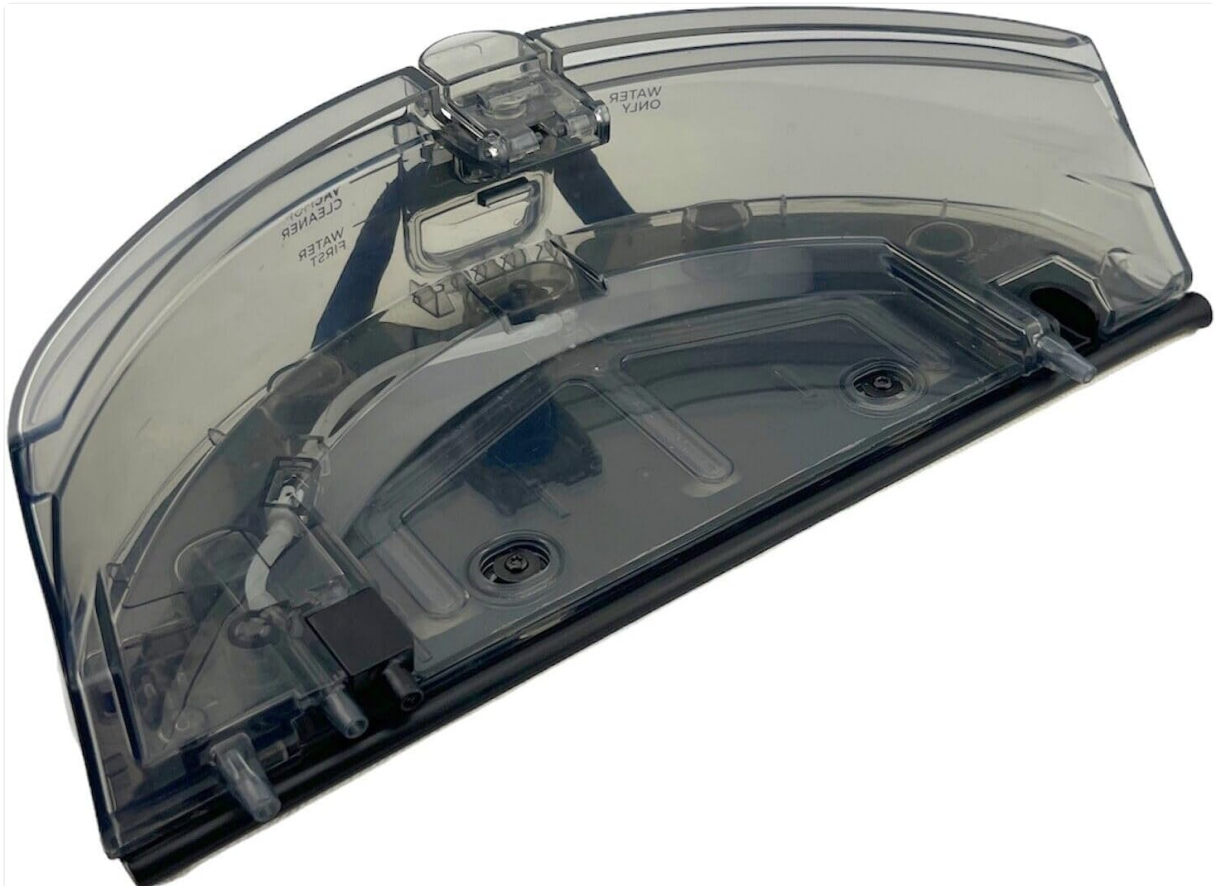
Figure 1: Goodsby Replacement Solution Reservoir Water Tank.

This manual provides instructions for the installation, operation, and maintenance of your Goodsby Replacement Solution Reservoir Water Tank. This product is designed to replace the original water tank in compatible Shark AI Ultra Robot Vacuums, ensuring continued optimal cleaning performance.