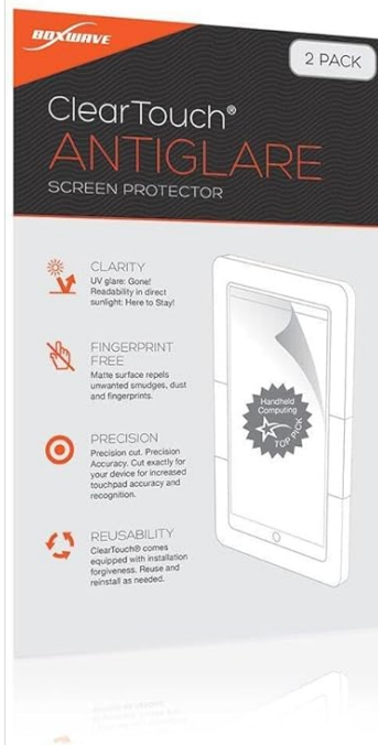
Image 1.1: APROTII Monitor AR 7+ with the BoxWave ClearTouch Anti-Glare Screen Protector applied, demonstrating its fit and anti-glare properties.