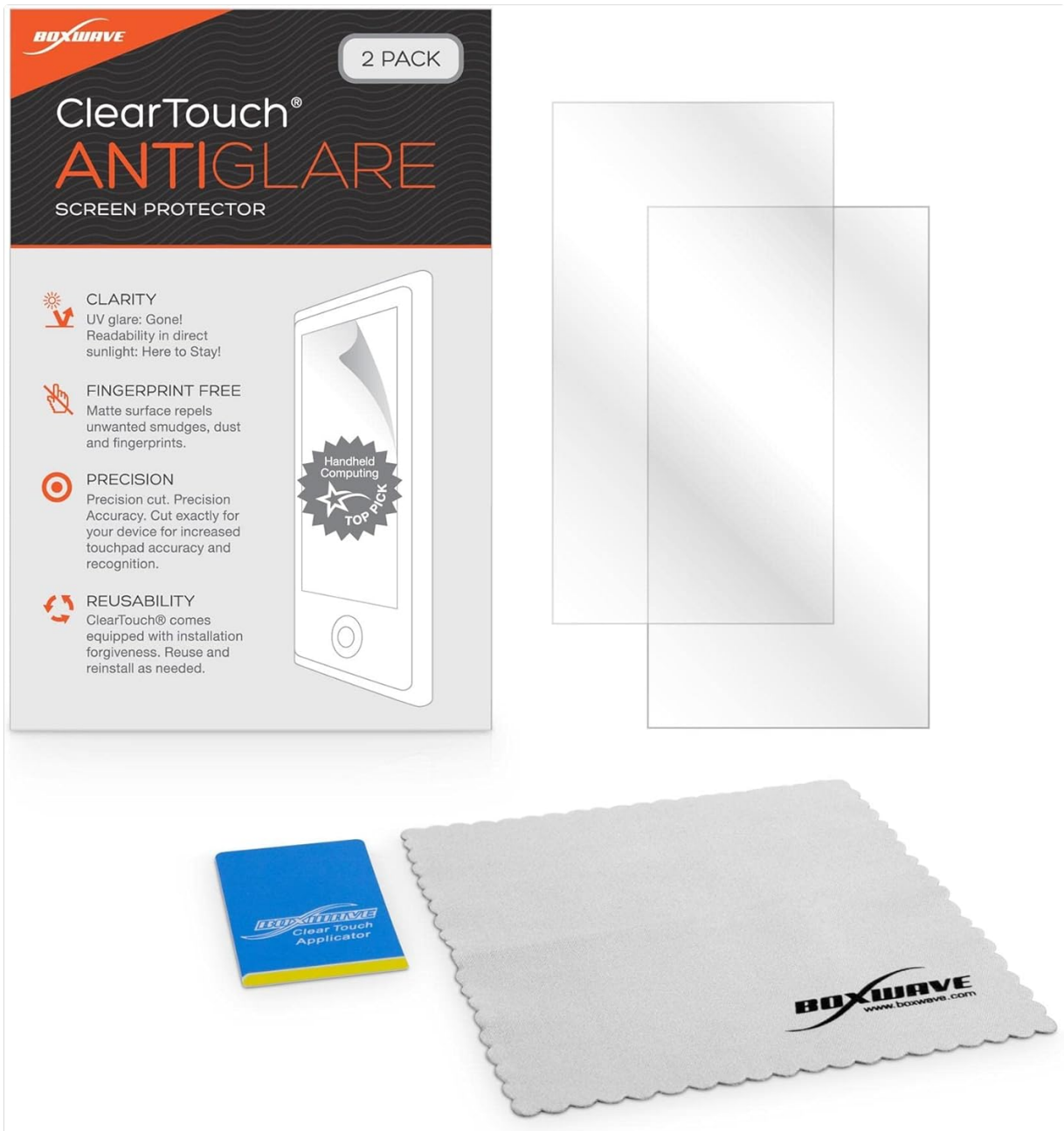
Image 2.2: A detailed view of the installation accessories: an applicator card, a microfiber cleaning cloth, and a dust removing sticker.