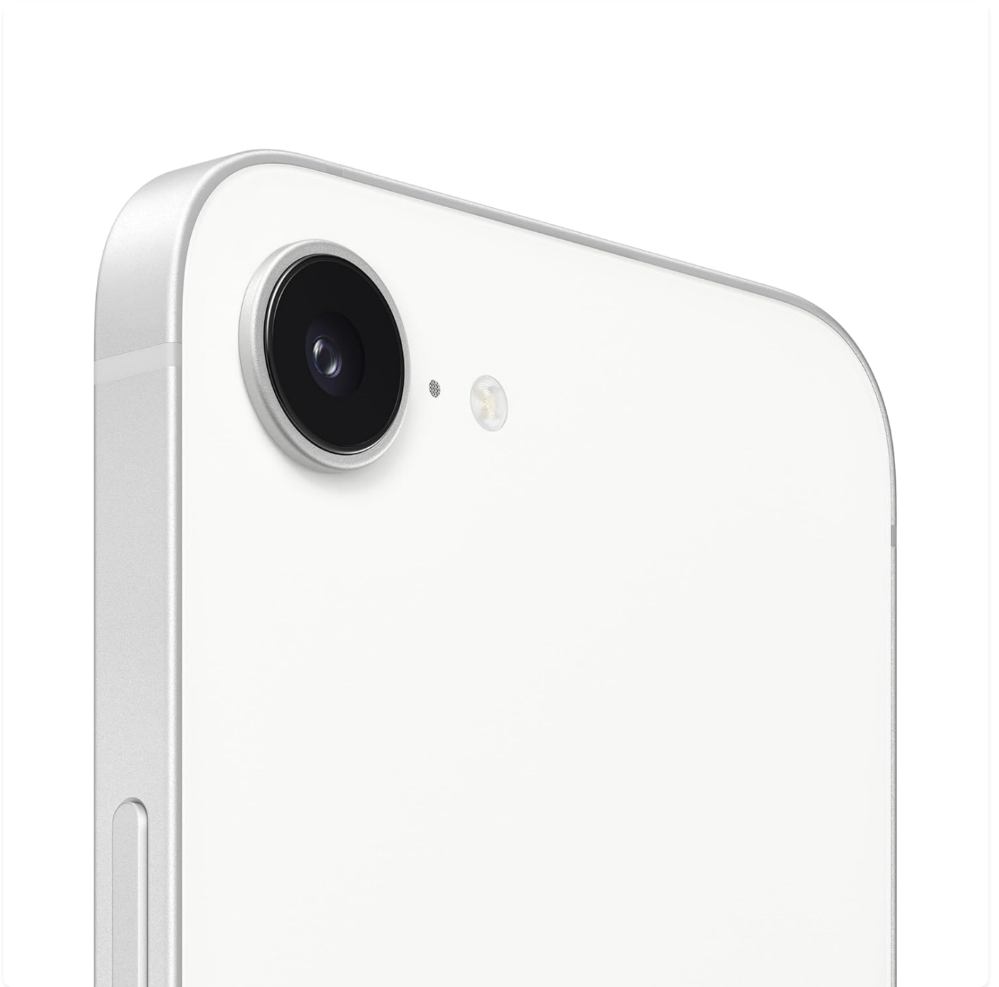
Image: A detailed view of the iPhone 16e's rear camera, highlighting the lens and flash components.