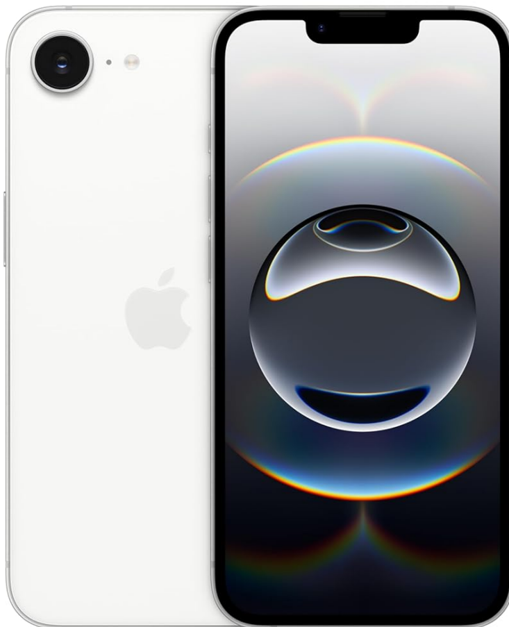
Image: Front and rear view of the iPhone 16e, showcasing its display and back panel design.

the bottom to go home, swipe down from the top-right for Control Center, and swipe down from the top-left for notifications.