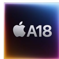
Image: Key features of the iPhone 16e, highlighting Apple Intelligence, the 48MP Fusion camera, extended battery life, and the A18 chip.