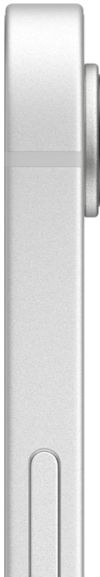
Image: Side profile of the iPhone 16e, illustrating the placement of the Action Button and other side controls.