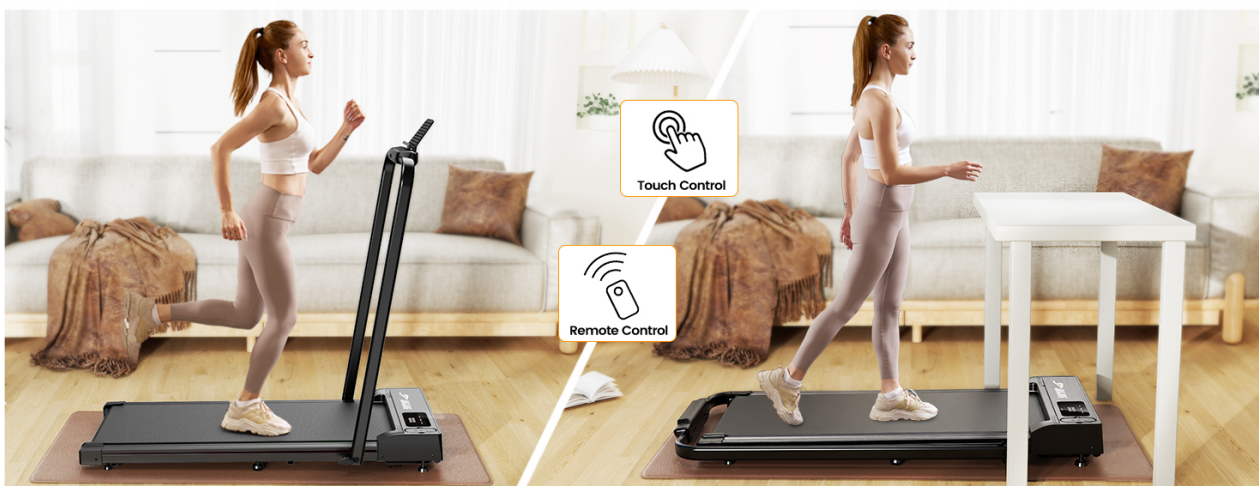
Image 1.1: The JAGJOG JT51-3 features a 2.5 HP motor, low noise operation (under 45dB), a speed range of 0.6 to 6.2 MPH, and a weight capacity of 265 lbs.

The JAGJOG JT51-3 Foldable Walking Pad Treadmill is designed for home and office use, offering a versatile 2-in-1 design. It functions as a walking pad with the handle folded down and a treadmill with the handle raised. This unit features a powerful yet quiet 2.5 HP motor, a non-slip running belt, and convenient control options including touch controls on the handlebar and a remote control. The integrated LED display provides real-time tracking of time, speed, calories, and distance. Its compact, foldable design and built-in transport wheels ensure easy storage and portability, making it suitable for small spaces.