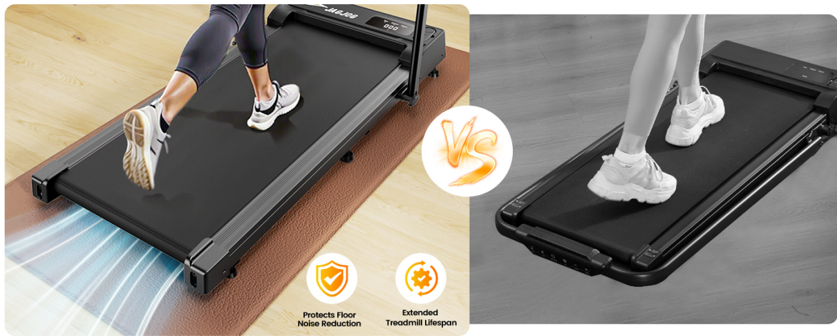
Image 4.1: The treadmill is shown with the included premium mat, which protects floors and assists with heat dissipation.