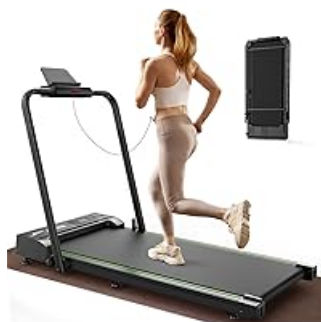
Image 5.1: The treadmill can be controlled via touch buttons on the handlebar or with the included remote control.