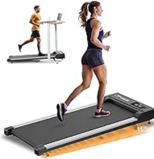
Image 5.2: Different operating modes and their respective speed ranges for walking, jogging, and running.