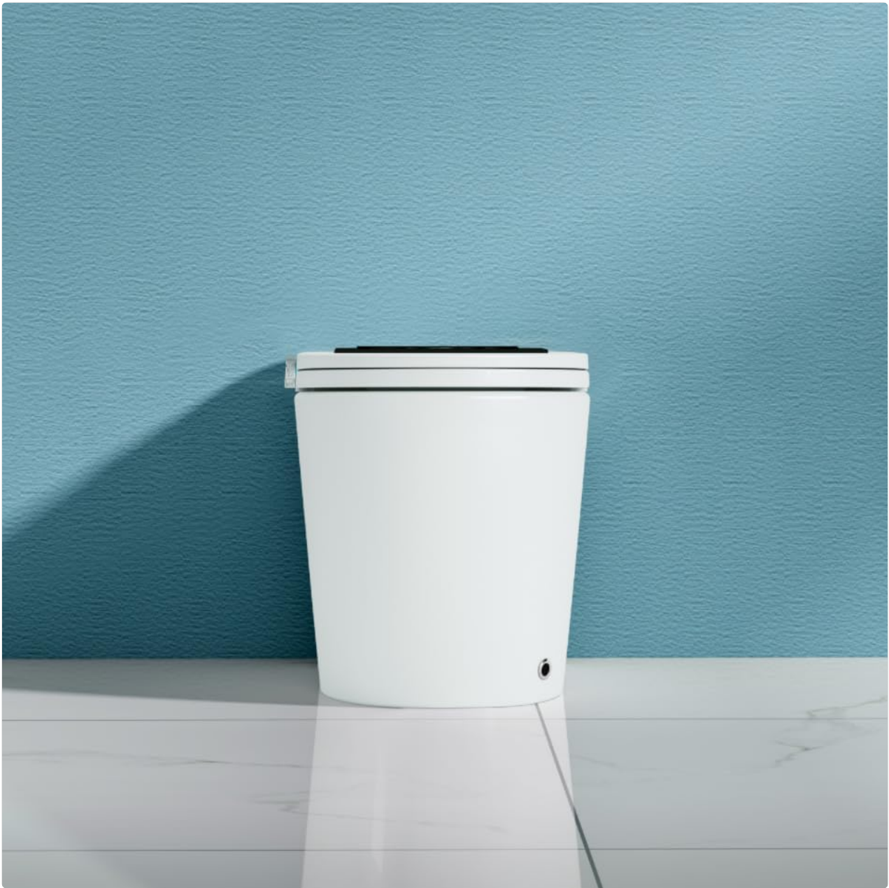
Image: Front view of the Loniko Smart Toilet.