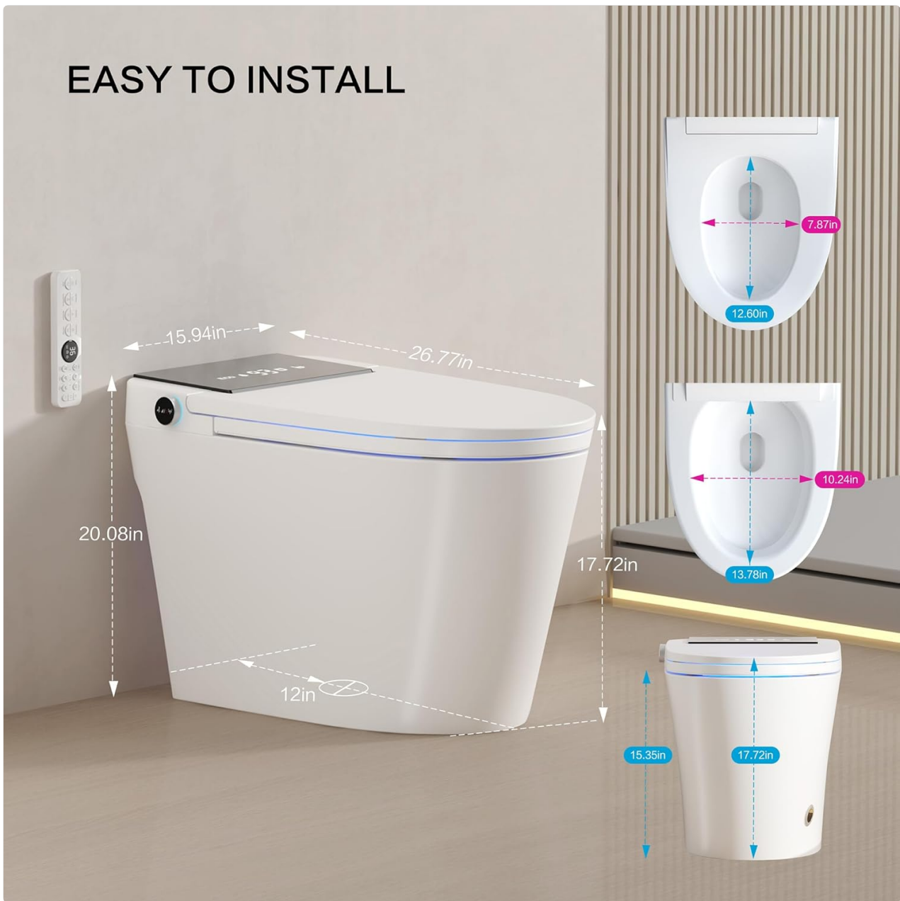
Image: Diagram showing key dimensions and components for easy installation, including rough-in distance.