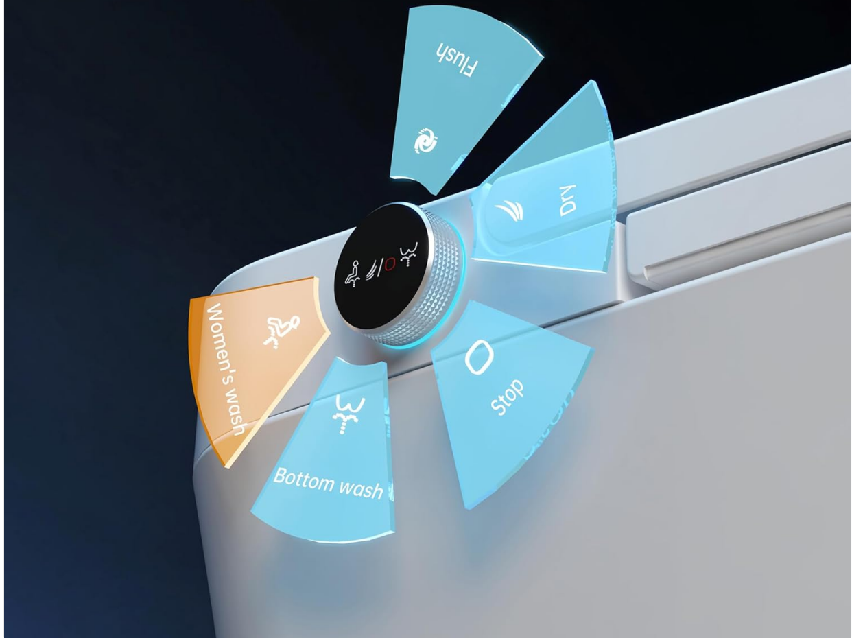
Image: Detail of the one-touch knob for simplified control of washing, drying, and flushing functions.