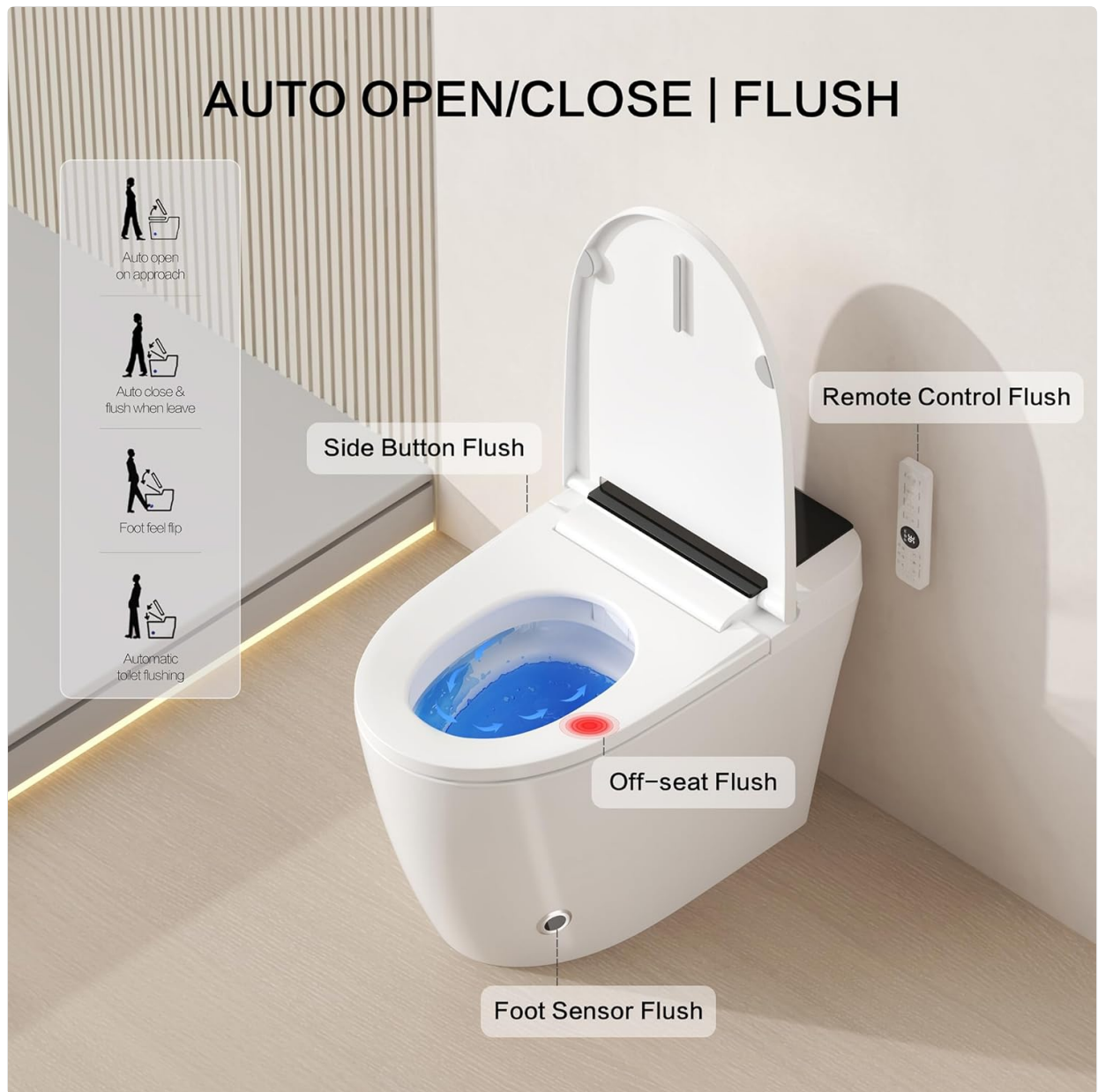
Image: Visual representation of automatic lid opening, closing, and various flushing methods including foot sensor and remote control.