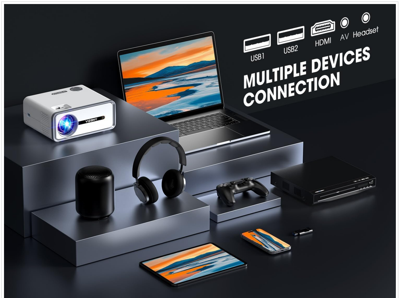
Image: The VIZONY DP04 Pro projector shown with various connected devices including a laptop, game console, smartphone, headphones, and a portable speaker, illustrating its wide compatibility.