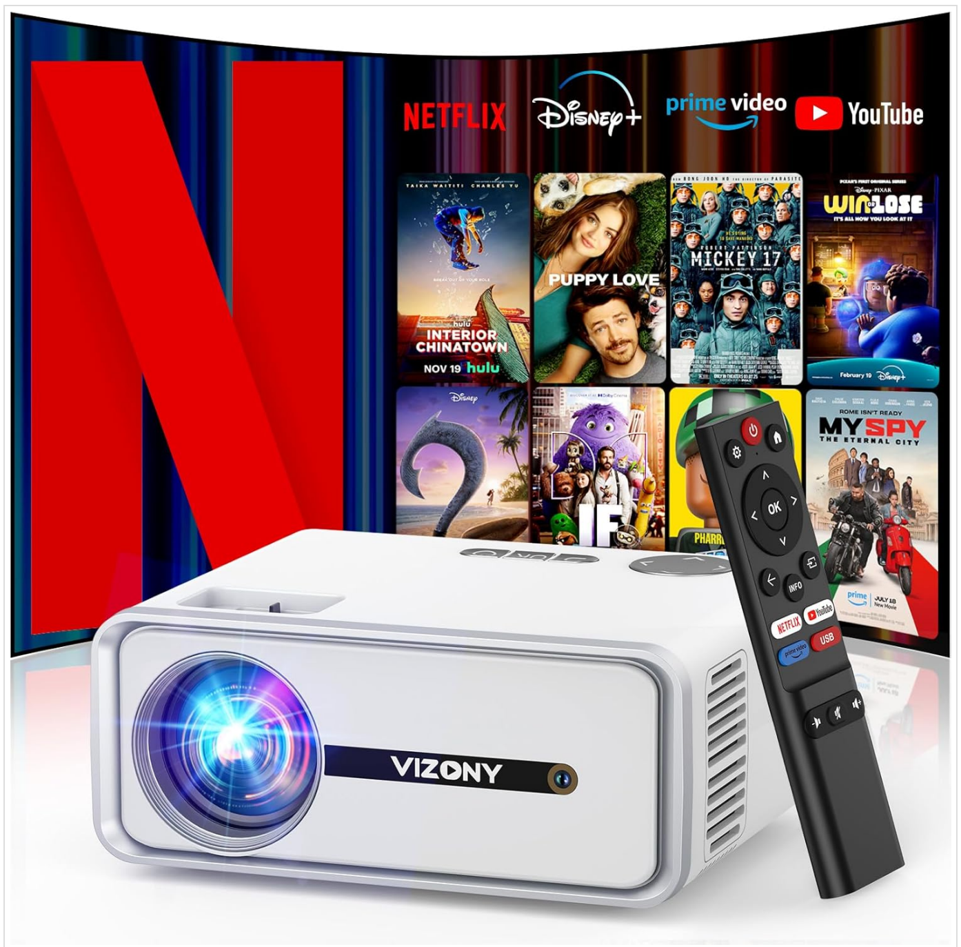
Image: The VIZONY DP04 Pro Smart Projector, its remote control, and a display showing various streaming application interfaces like Netflix, Disney+, Prime Video, and YouTube.