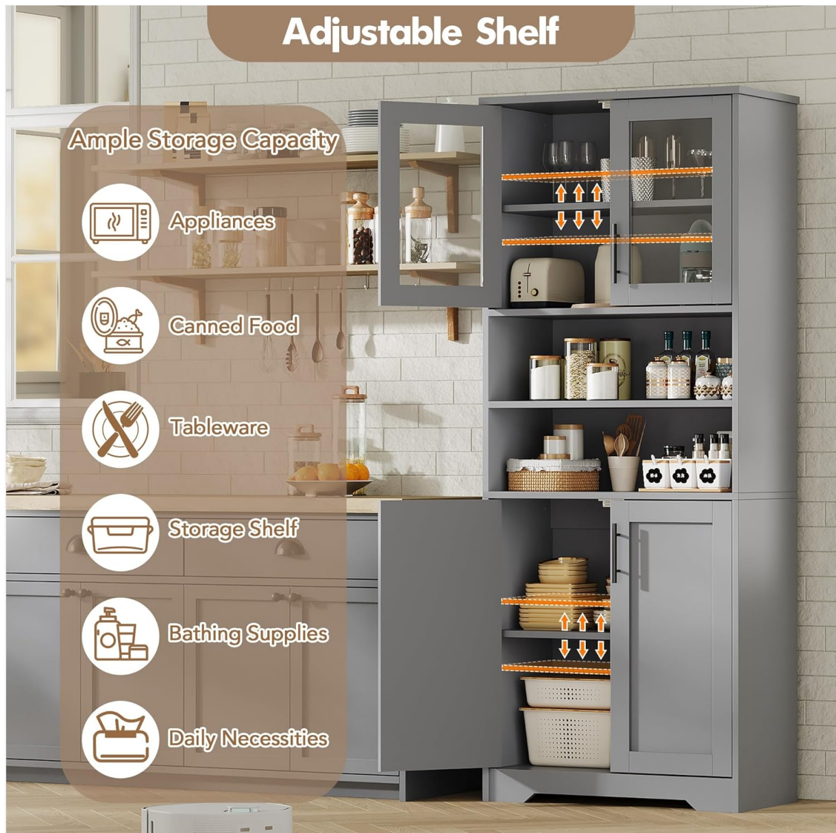
Image: Detail showing the adjustable shelf pegs and holes, indicating how shelves can be moved up or down to customize storage space.