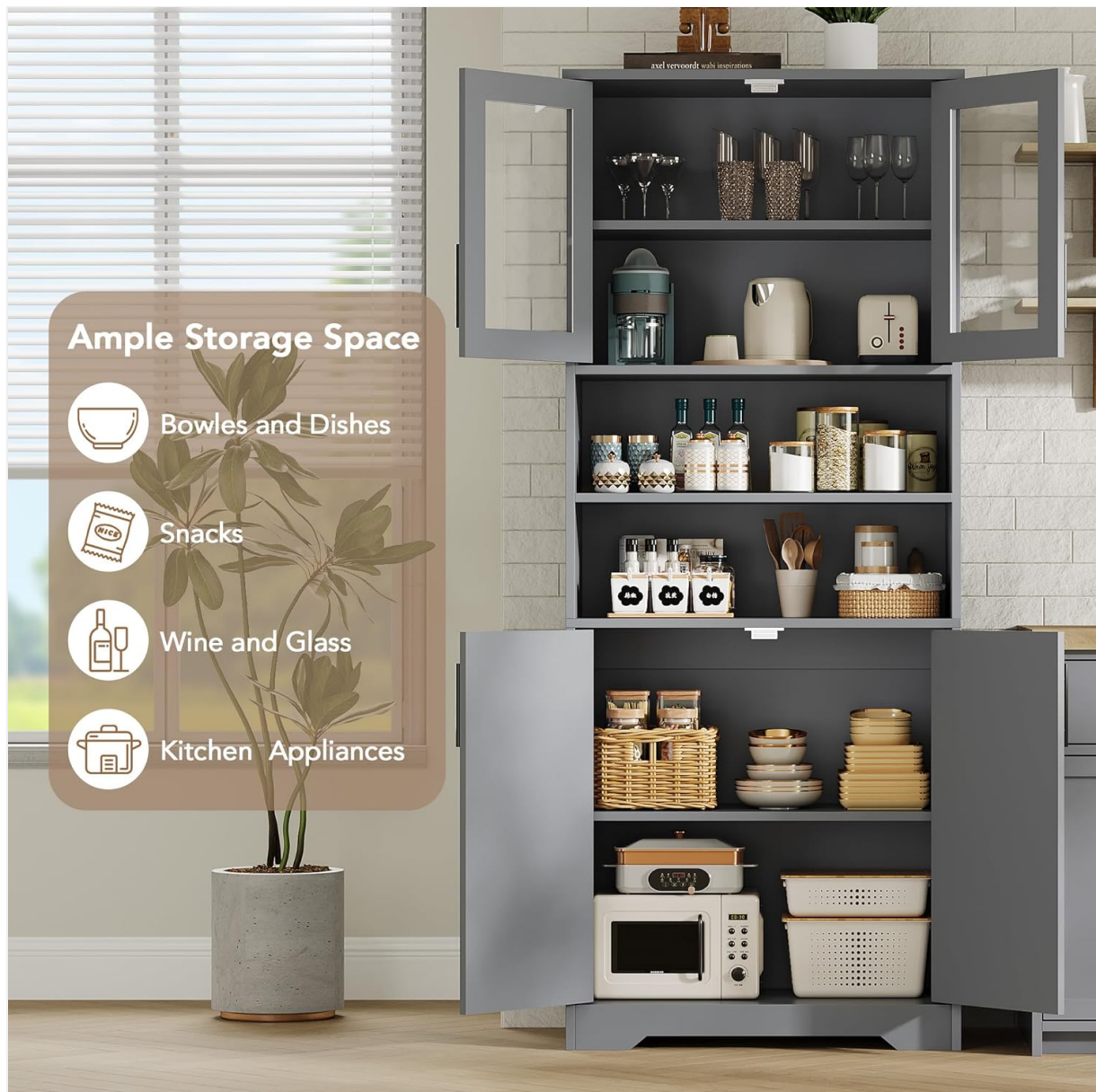
Image: The cabinet interior displaying various items like bowls, dishes, snacks, wine, and kitchen appliances, demonstrating ample storage space.