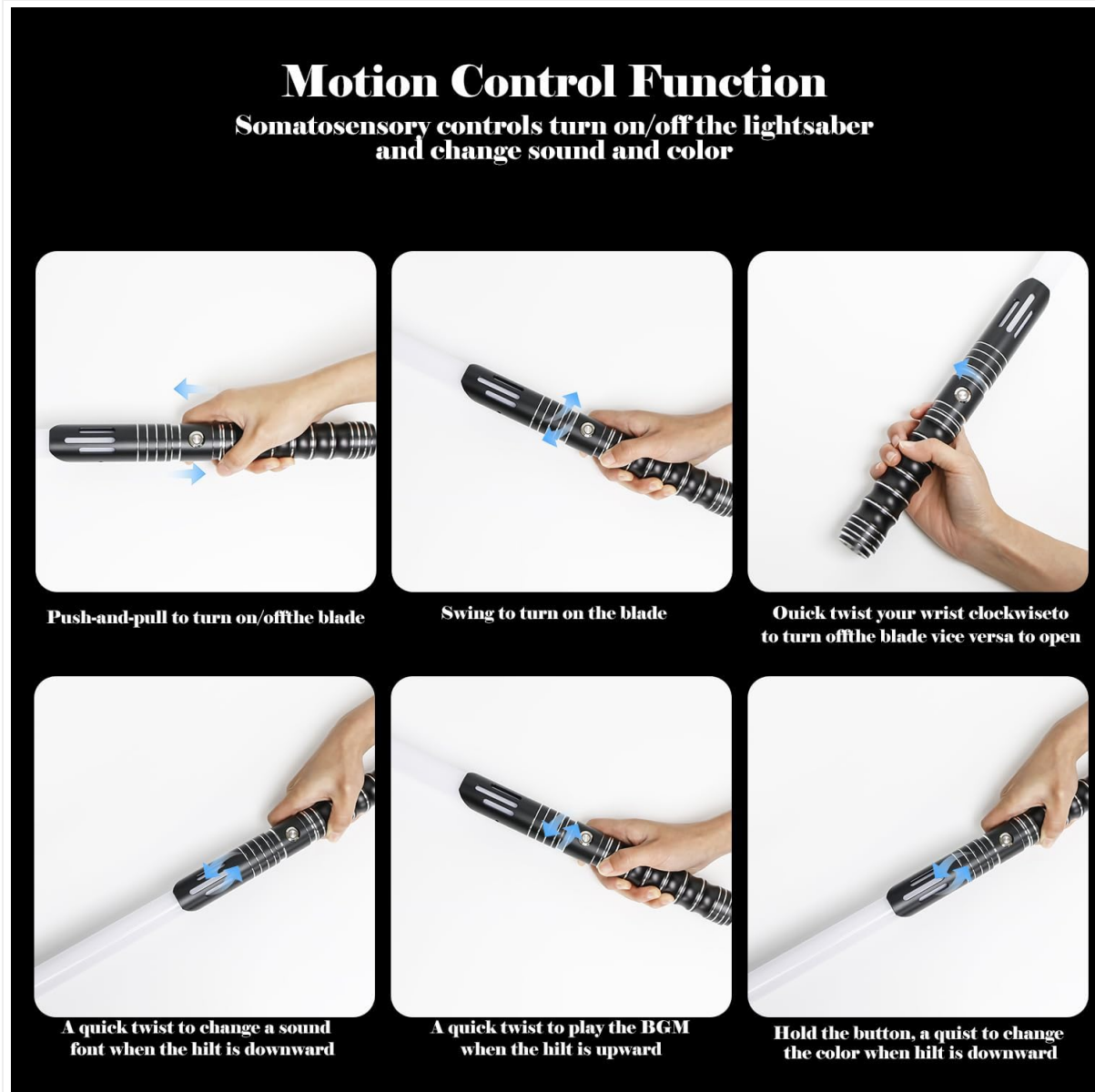
Image: Visual guide illustrating different motion control gestures for operating the lightsaber, including turning on/off, changing sound fonts, and playing BGM.

Your browser does not support the video tag.