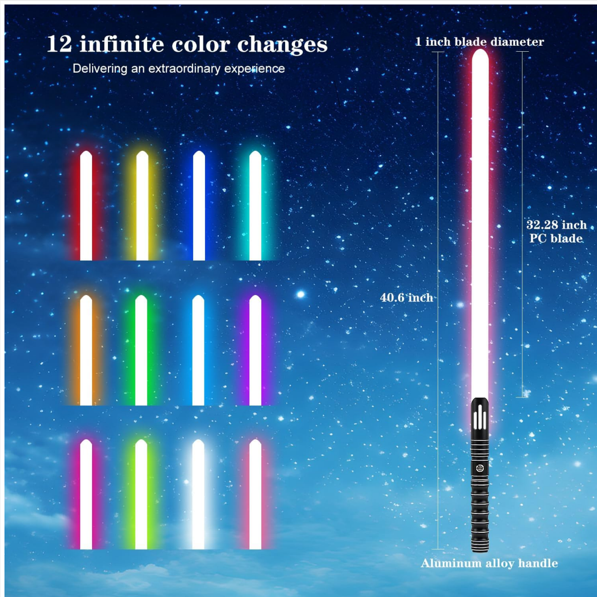
Image: Visual representation of the lightsaber's dimensions (40.6 inches total length, 32.28 inch PC blade, 1 inch blade diameter) and a display of 12 infinite color options.