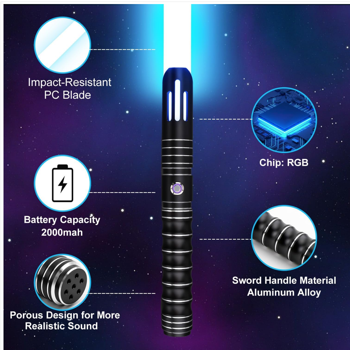
Image: Detailed view of the lightsaber hilt's internal components, highlighting the 2000mAh battery, RGB chip, and porous design for enhanced sound.