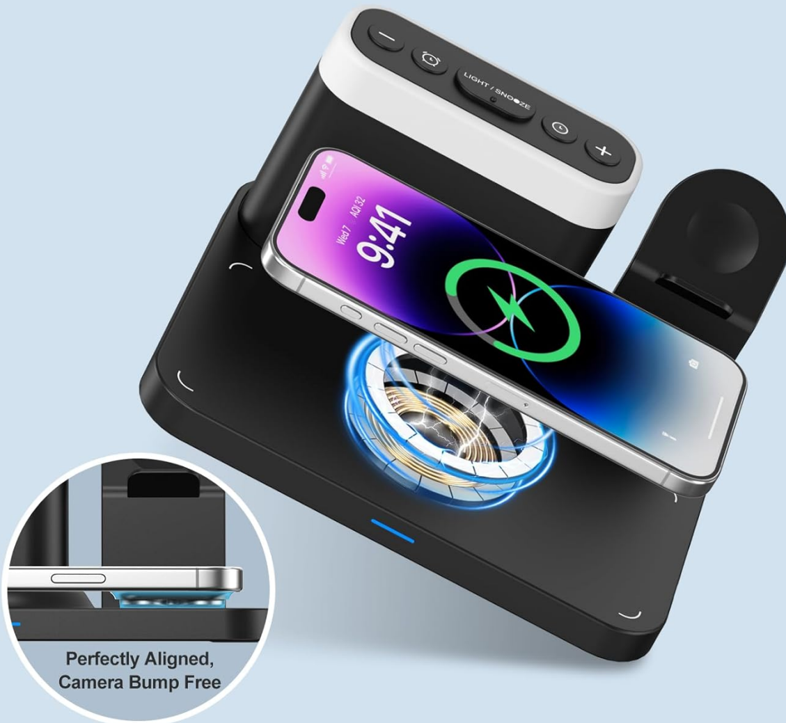
Figure 3.1: Magnetic alignment for iPhone charging, ensuring a secure and efficient connection.

Strong Magnetic Hold for Precise Alignment & Stable Charging