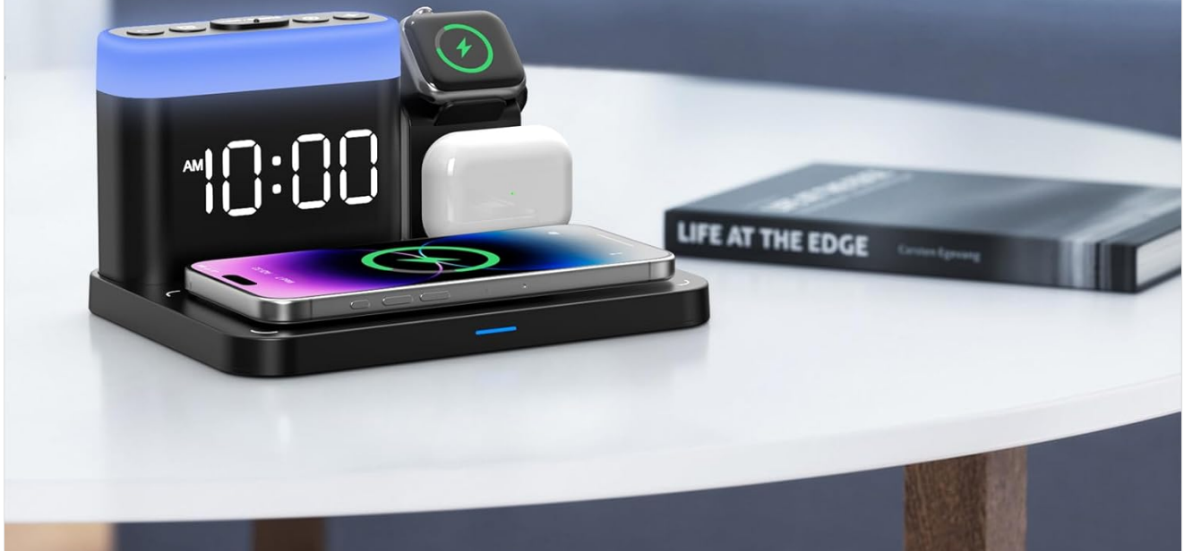
Figure 4.2: The night light offers 7 colors and 10-100% brightness adjustment to suit various moods and needs.