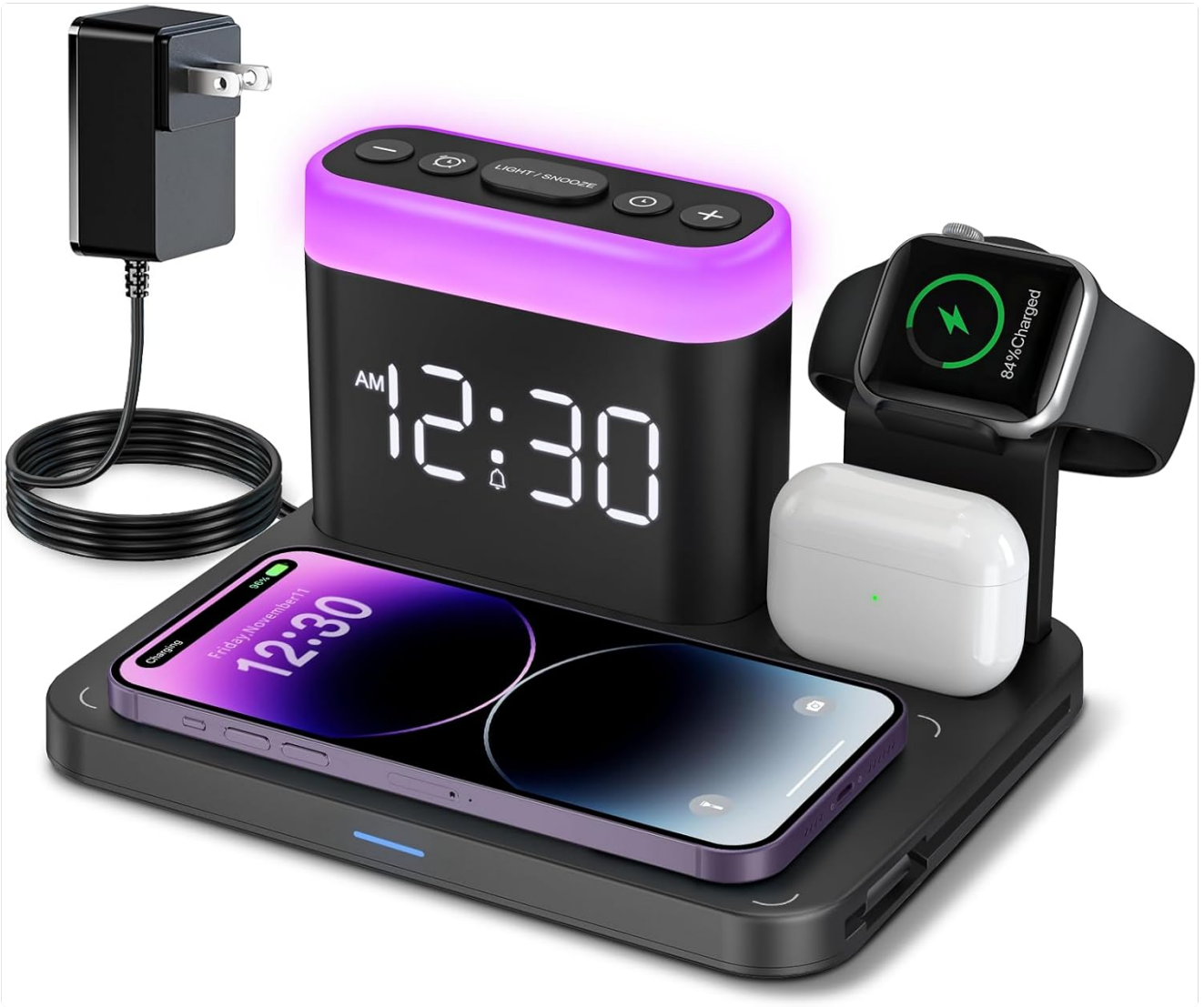
Figure 2.1: ANJANK 5-in-1 Wireless Charging Station with included power adapter.