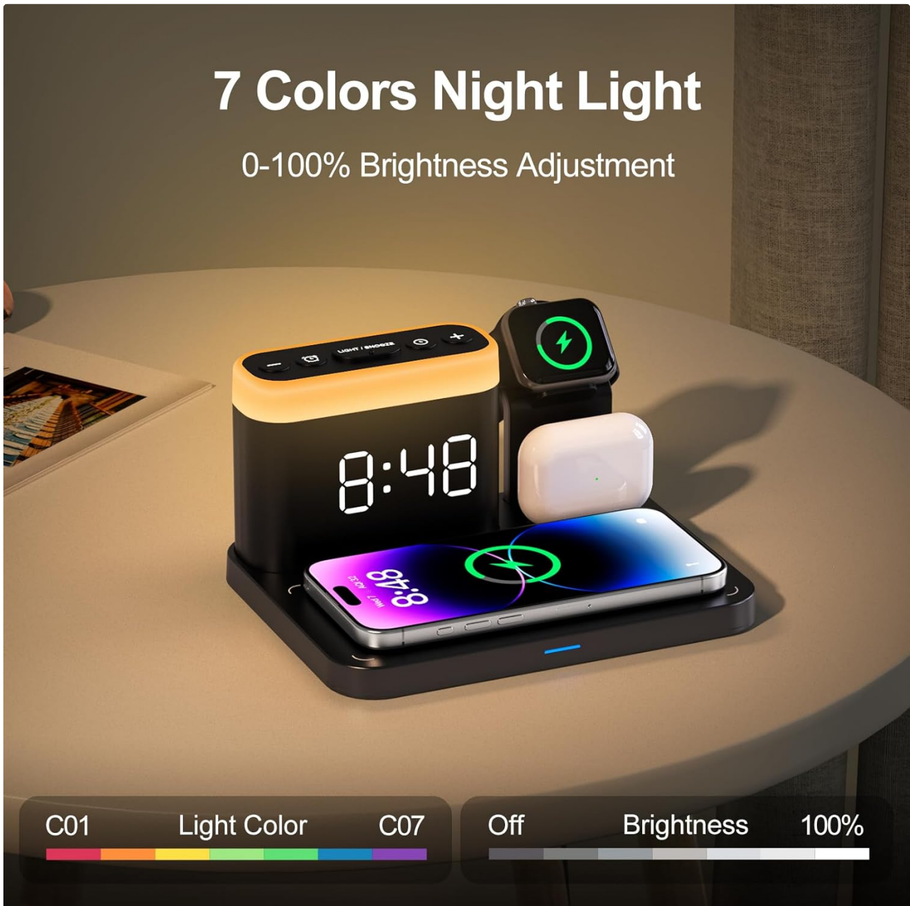
Figure 4.1: Digital alarm clock with 0-100% display dimmer and 3 levels of volume control.