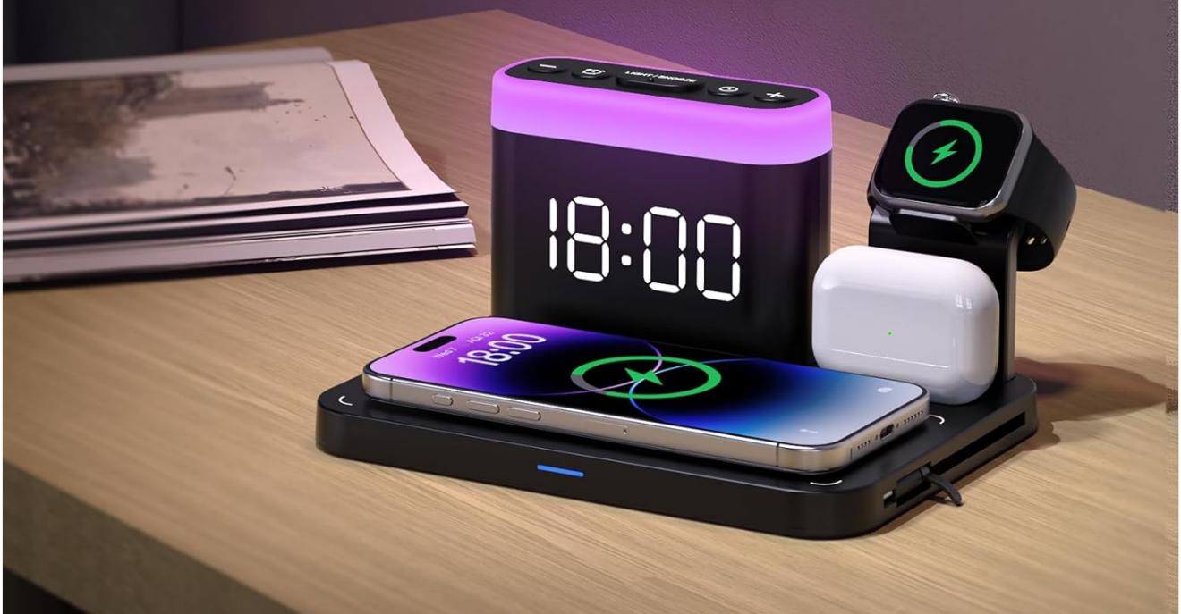
Figure 2.2: Visual representation of the 5-in-1 functionality: Alarm Clock, 3-in-1 Wireless Charging, and 7-Color Night Light.