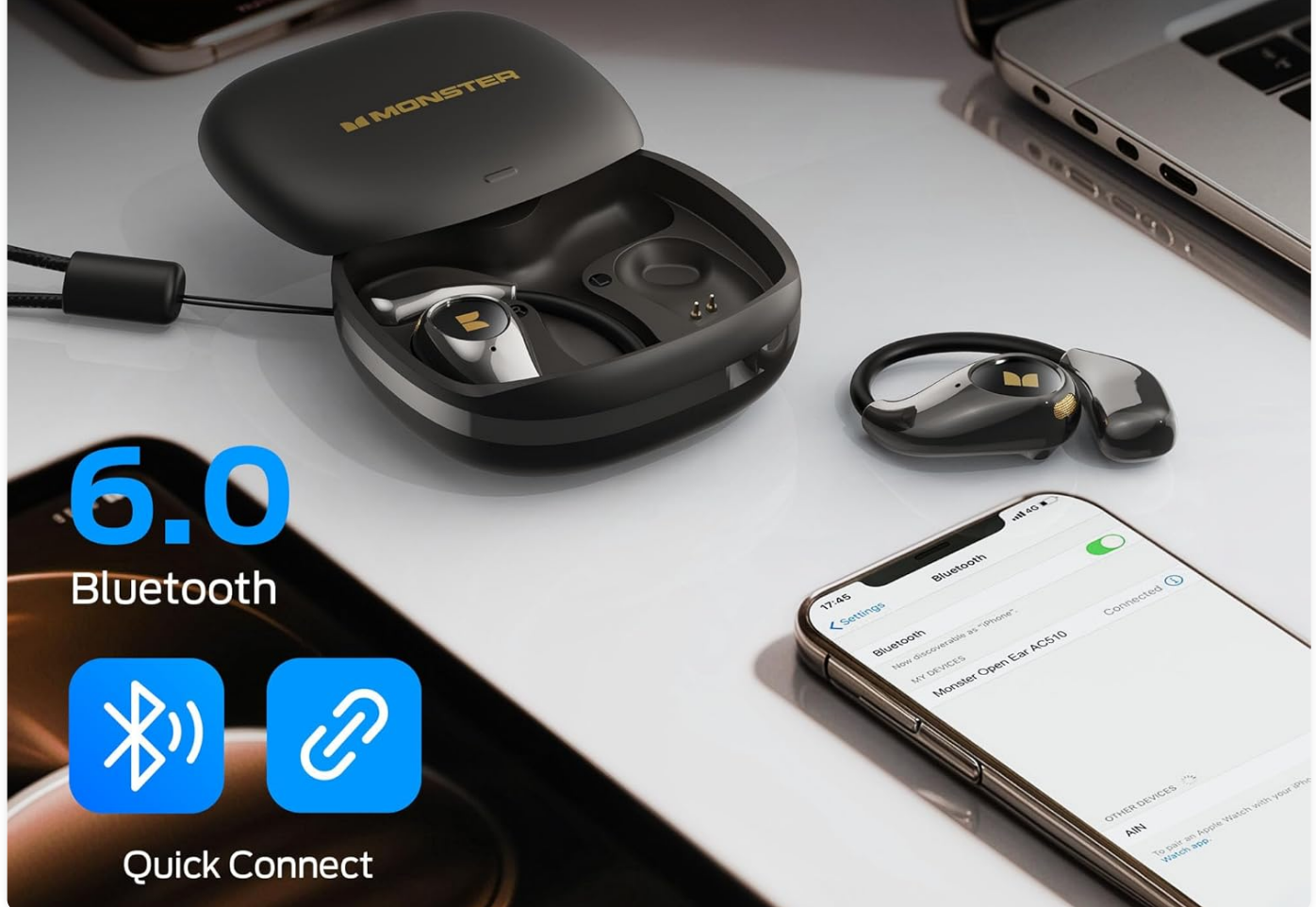
Image: Bluetooth 6.0 quick connect process with a smartphone.