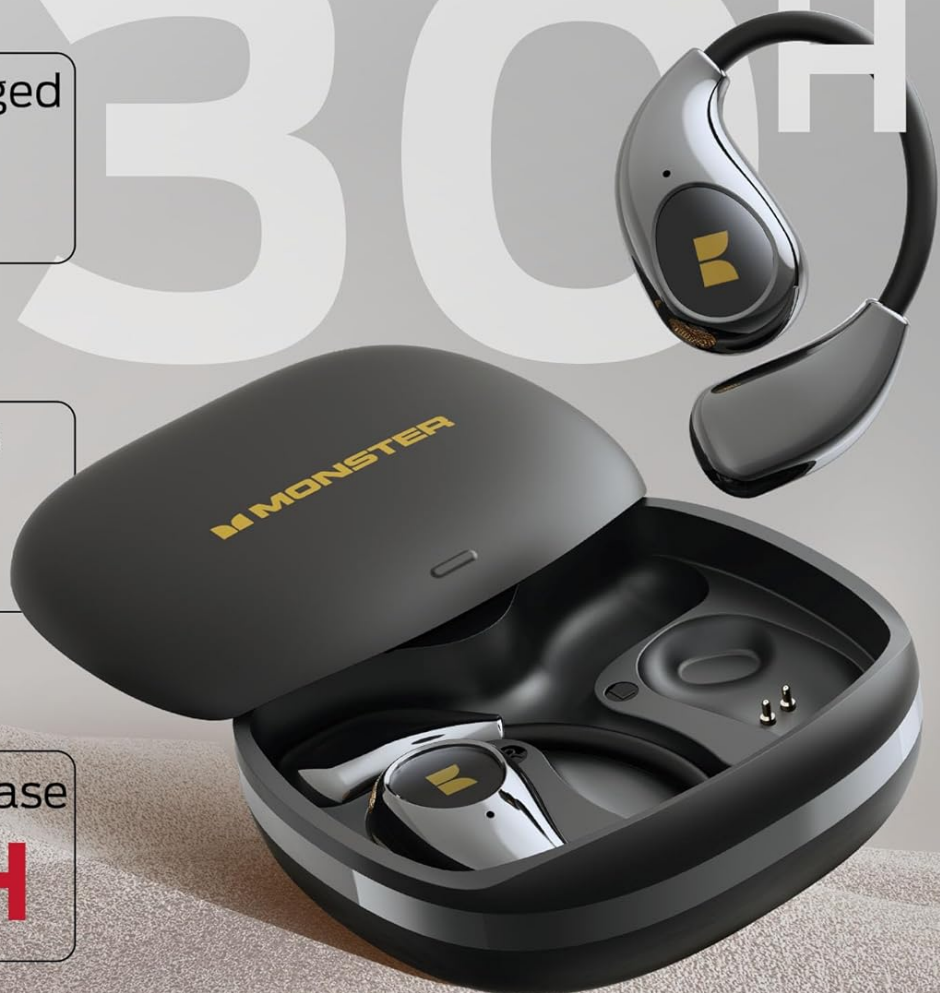
Image: Battery life and charging duration details for the earbuds and charging case.