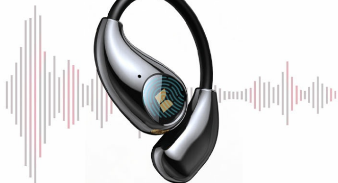
Image: Step-by-step guide on how to wear the Monster Open Ear AC510 earbuds.