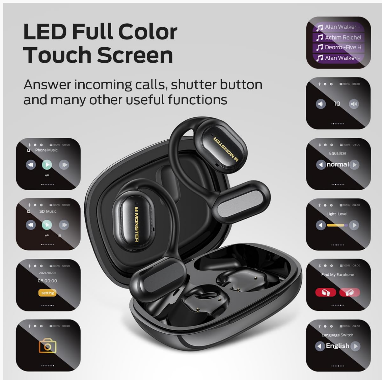
Image: The smart charging case with its LED full-color touch screen, showing icons for music playback, volume, EQ modes, language settings, and other controls.