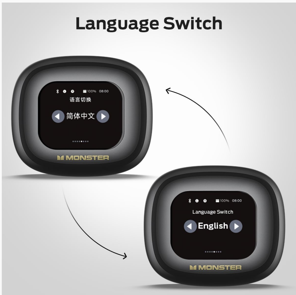
Image: The charging case screen showing the option to switch between different languages, such as English and Chinese.