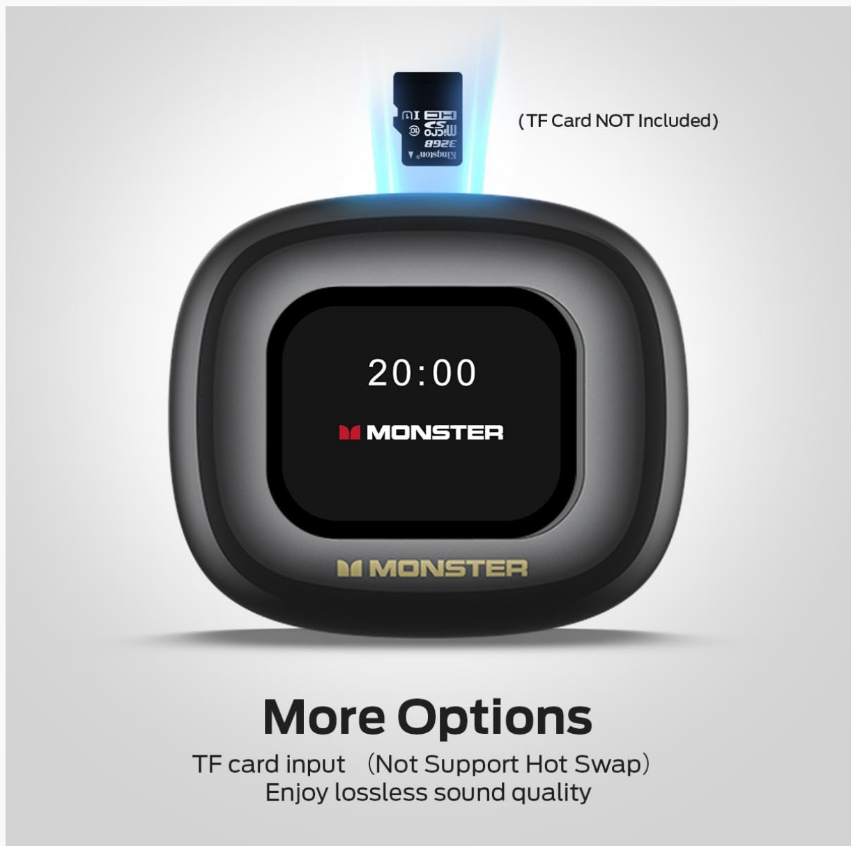
Image: The smart charging case with a TF card being inserted into its dedicated slot, enabling independent music playback.