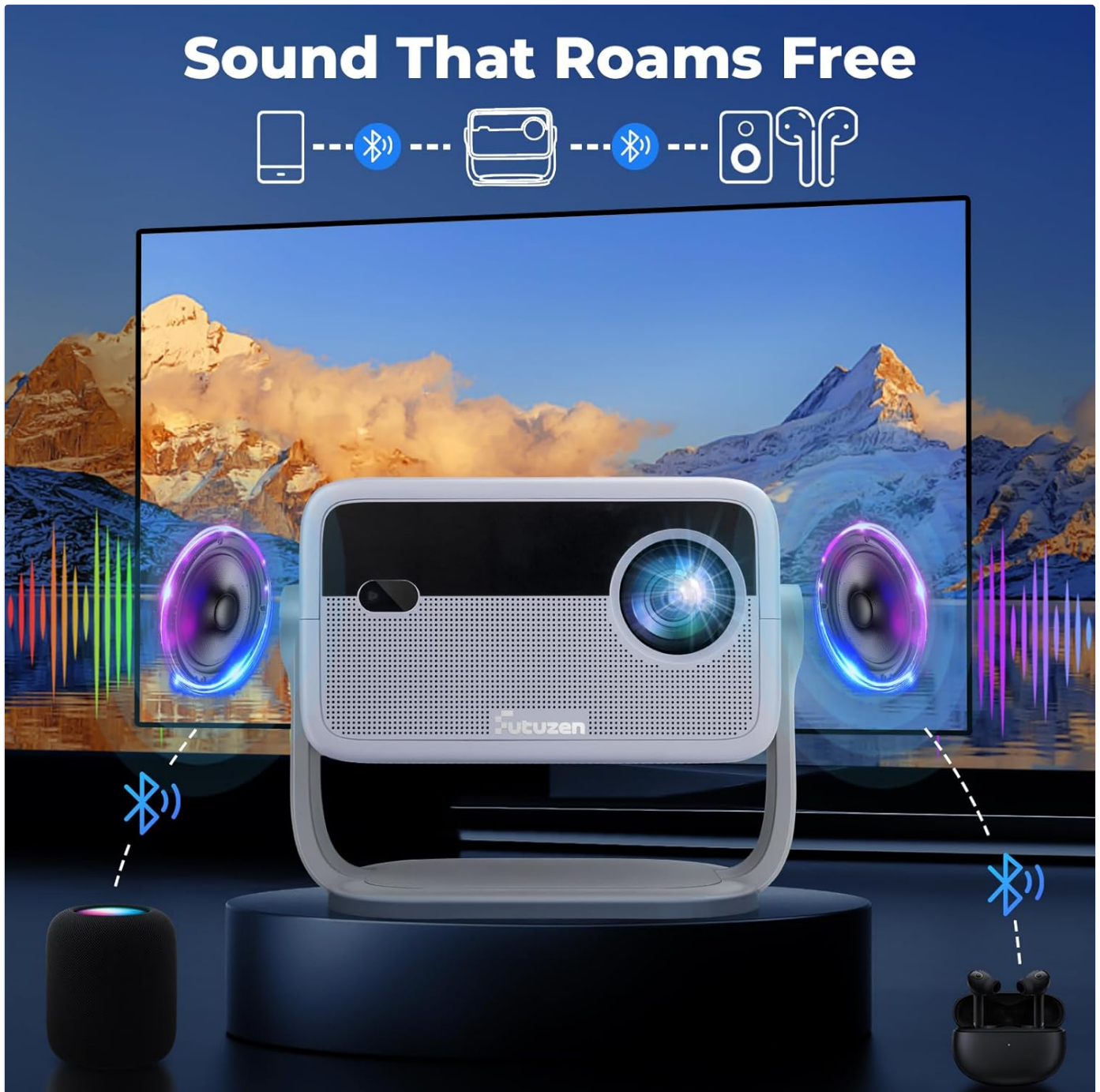
Figure 6: The projector's versatile Bluetooth capabilities for audio input and output.