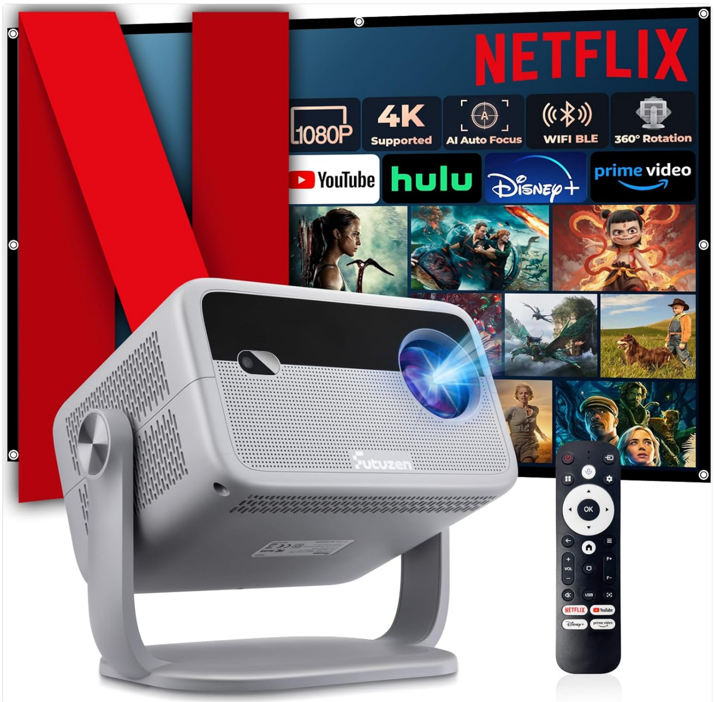
Figure 1: The Futuzen P30 NF-US Smart Projector, showcasing its compact design, integrated stand, and the included remote control. The projected image illustrates the built-in streaming capabilities.