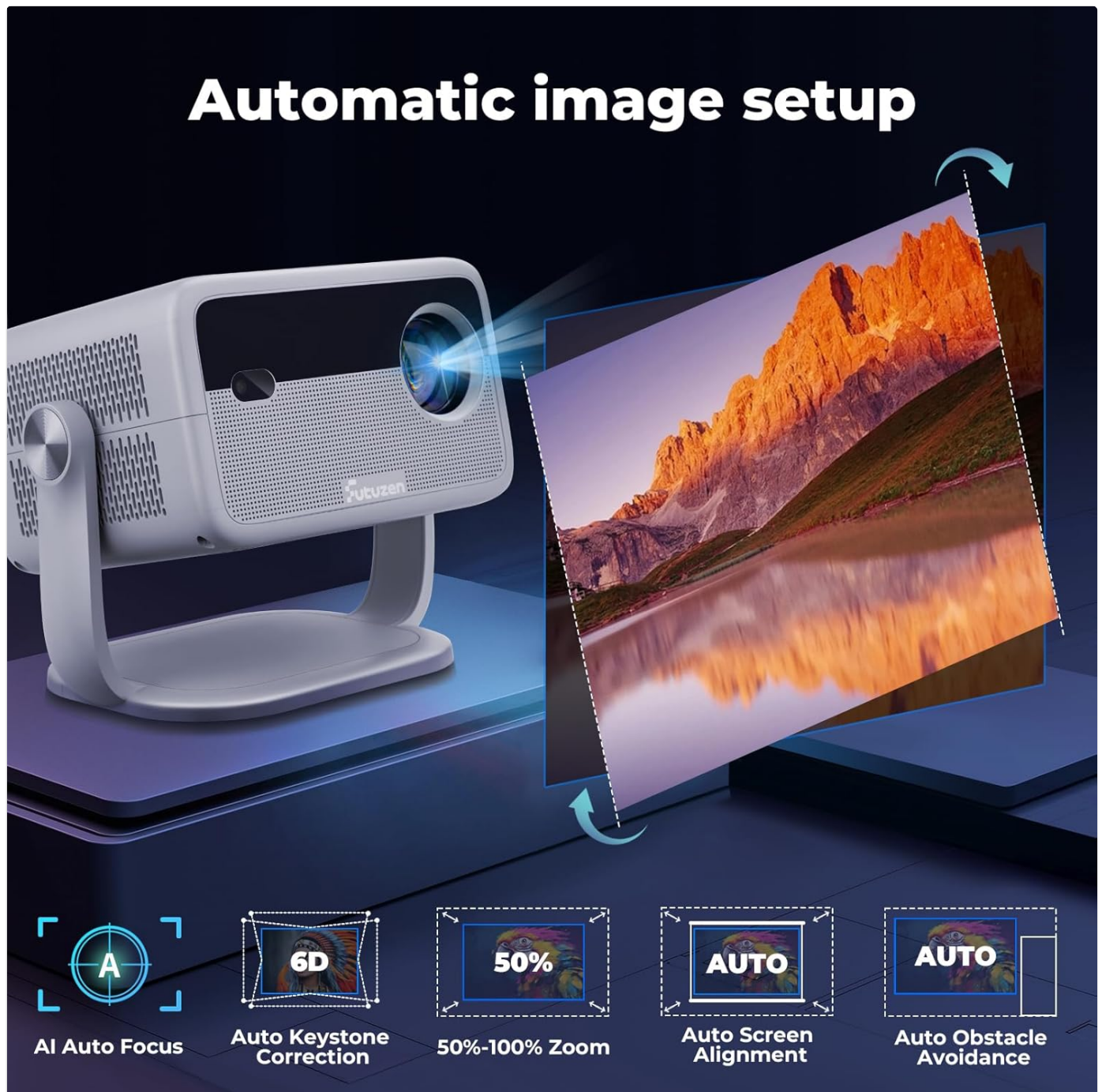
Figure 3: Visual representation of the automatic image setup capabilities, ensuring a perfect picture with minimal user intervention.

You can manually adjust zoom (50%-100%) if needed via the settings menu.