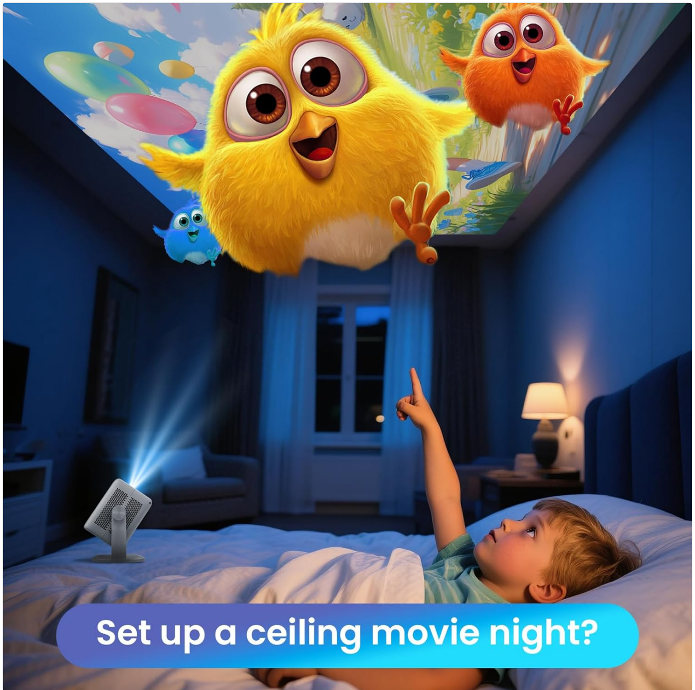
Figure 2: Demonstrating ceiling projection, a convenient feature for comfortable viewing while lying down.

Position the projector on a stable, flat surface. Ensure there are no obstructions in front of the lens. The P30 NF-US can project onto a wall, a dedicated projector screen, or even the ceiling thanks to its 360° rotatable stand. For optimal viewing, ensure the projection surface is smooth and light-colored.