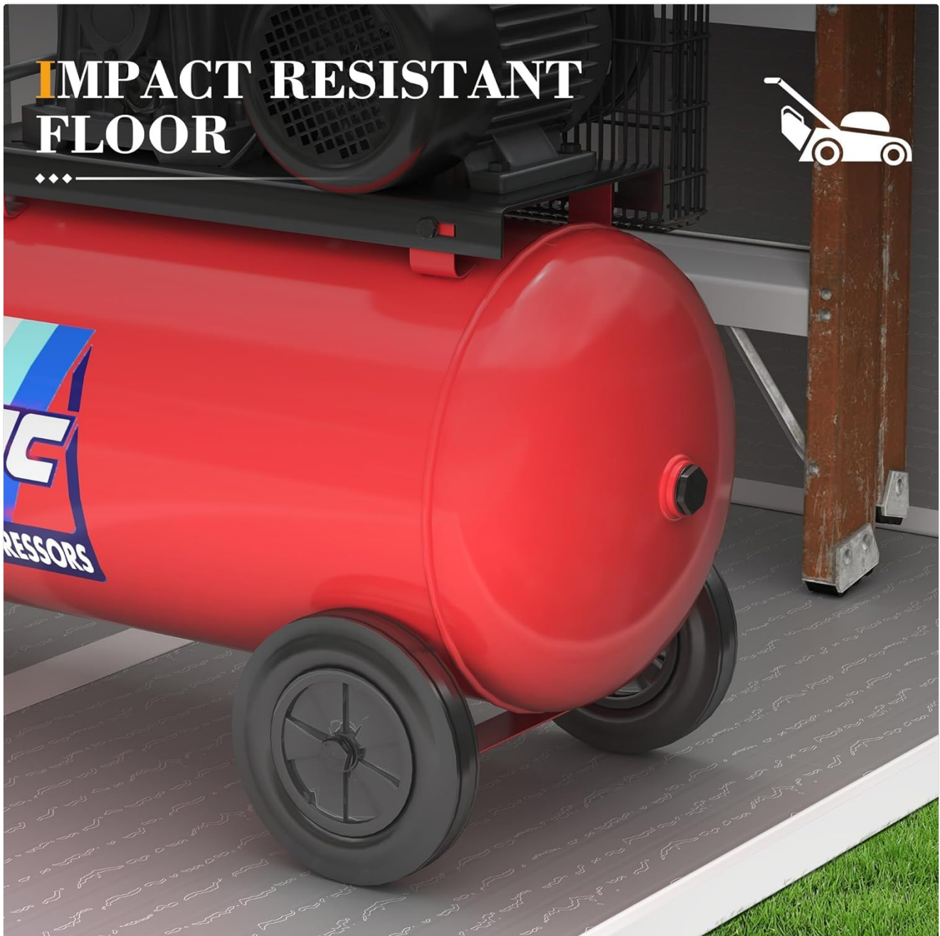
Figure 5: Weather-resistant features of the shed.