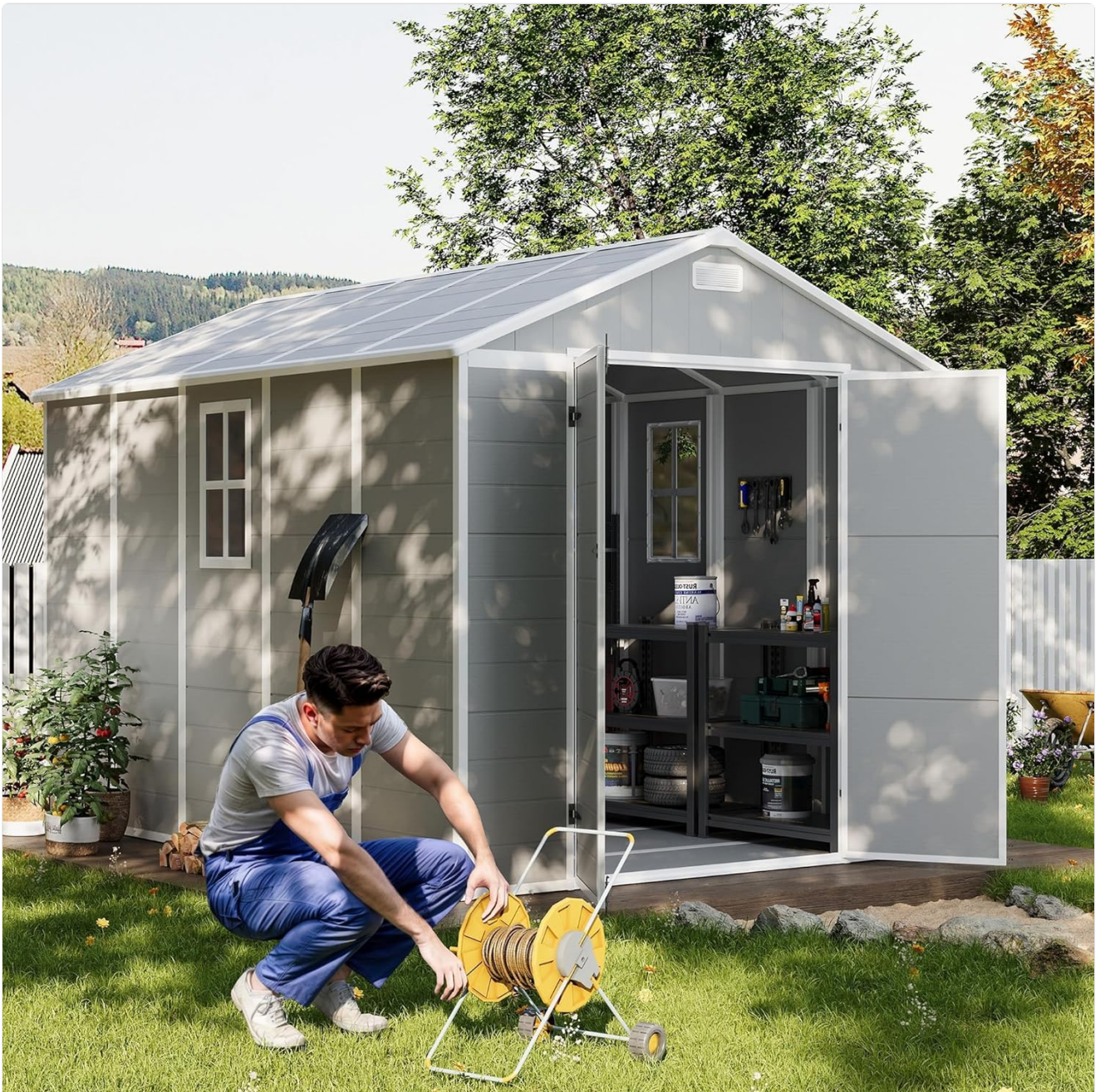
Figure 4: User interacting with the shed in an outdoor setting.

are not blocked by stored items or debris.