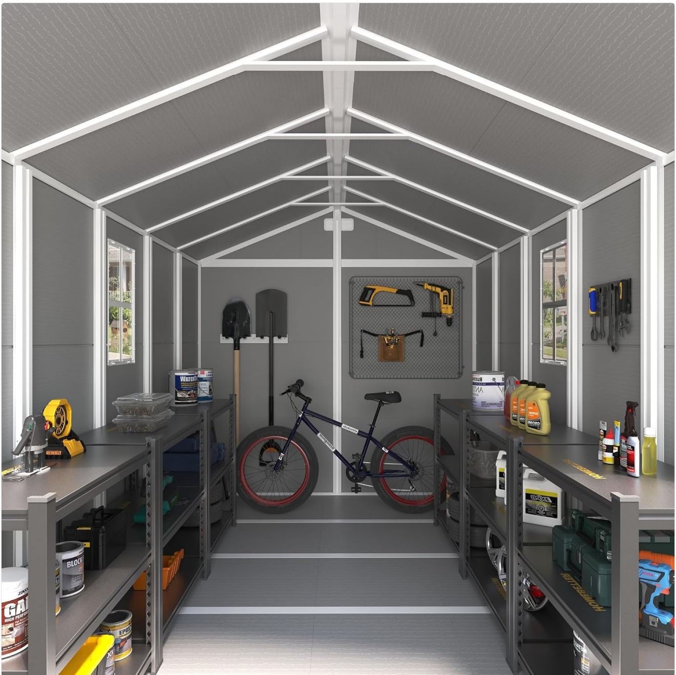
Figure 3: Interior of the shed showing potential storage configurations.