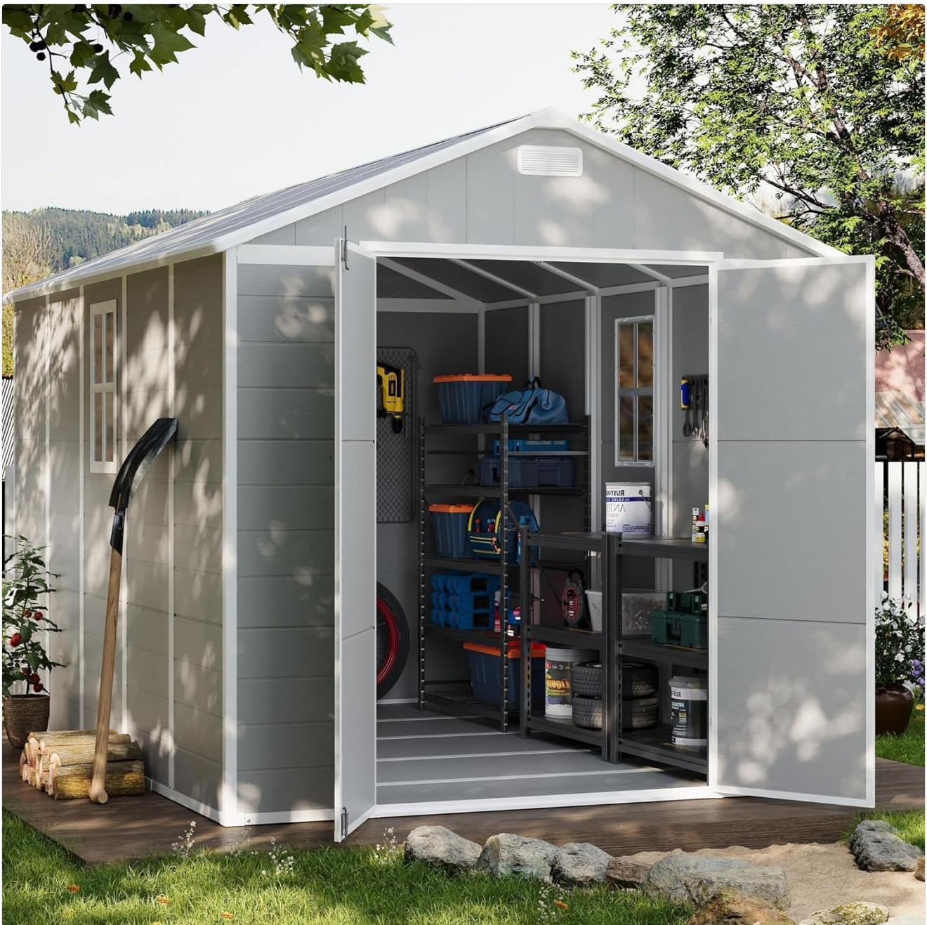
Figure 1: UDPATIO 8x10 FT Outdoor Storage Shed in a garden setting.