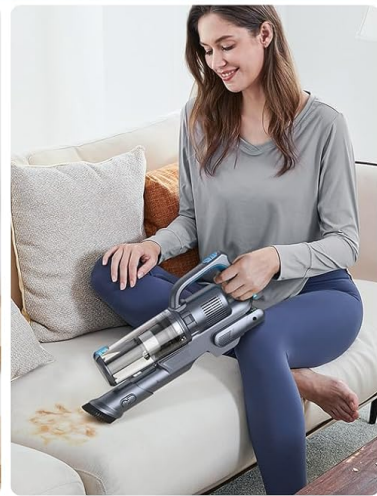
Figure 7: Versatile cleaning with various attachments.