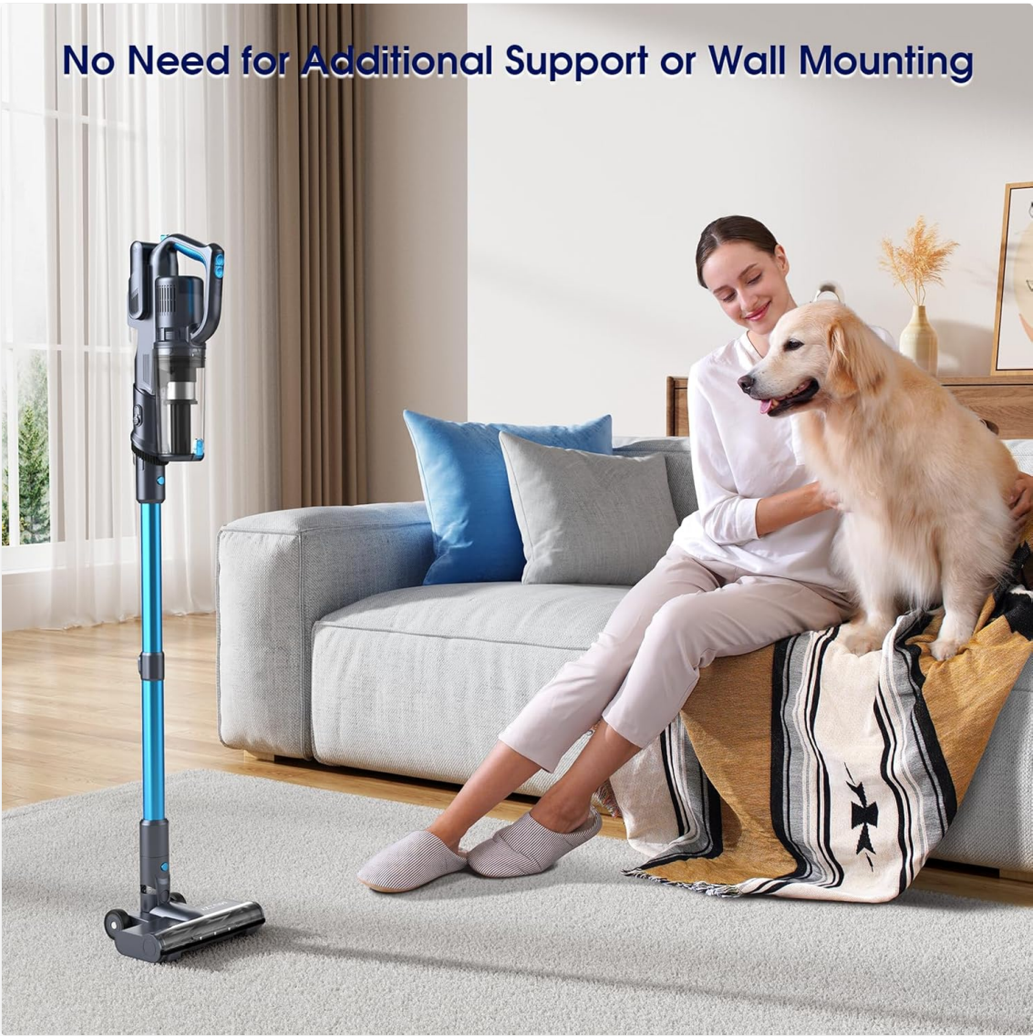
Figure 6: Self-standing design for convenience.