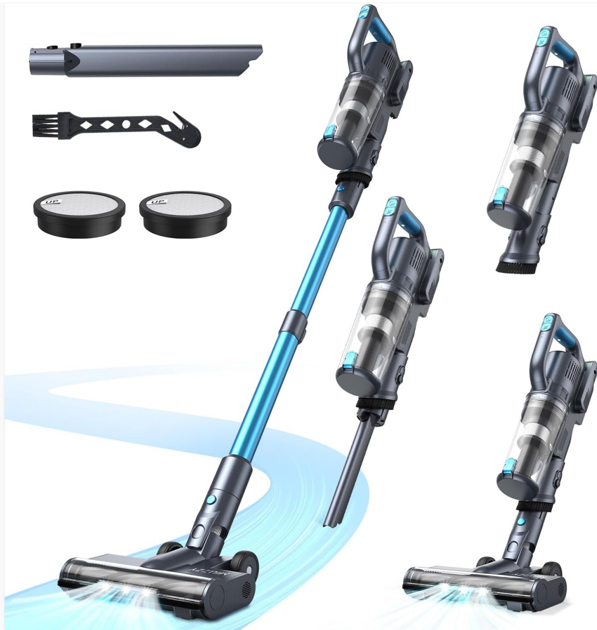
Figure 1: MIUZZY M243 Cordless Vacuum Cleaner and its components.