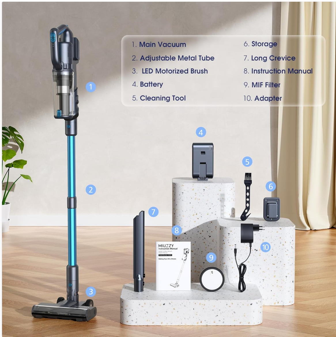
Figure 2: All components included in the MIUZZY M243 package.