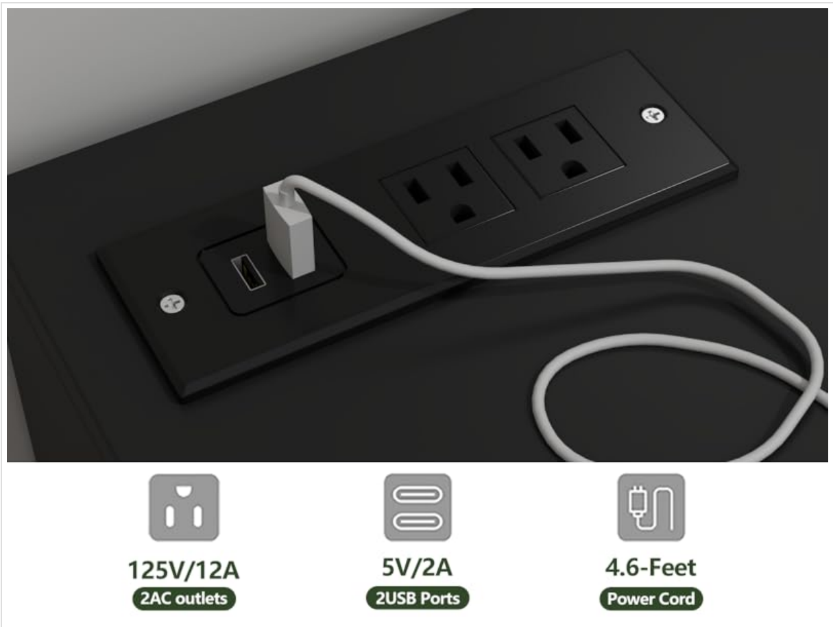
Image 4.2: Specifications for the charging station, including voltage, amperage, and cord length.