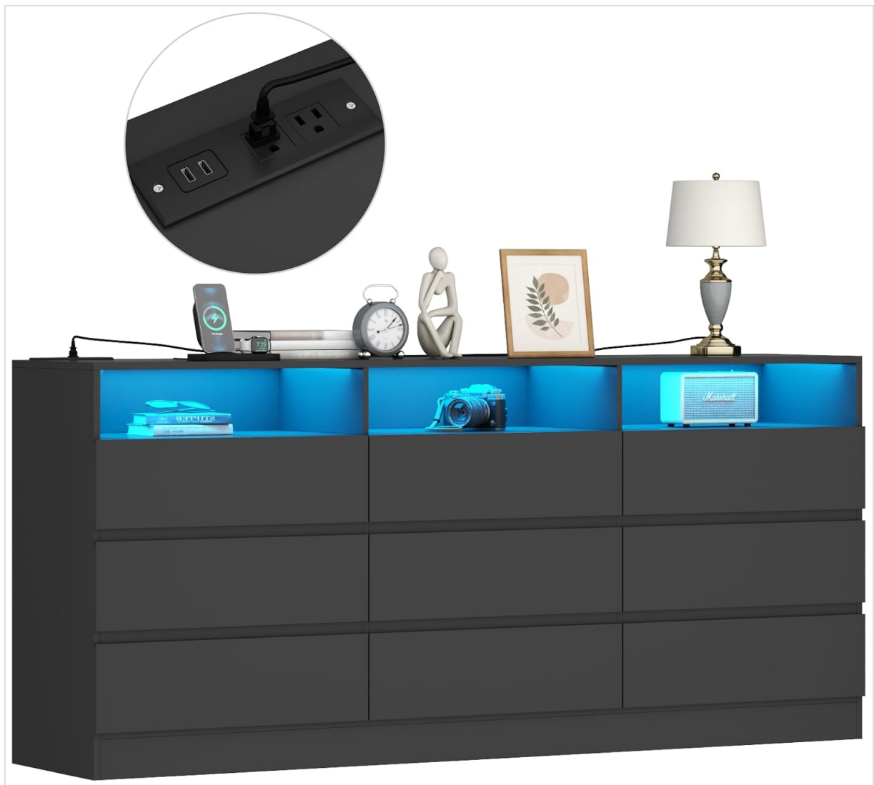
Image 1.1: Front view of the Gyfimoie 9-Drawer Double Dresser with LED lights illuminated.