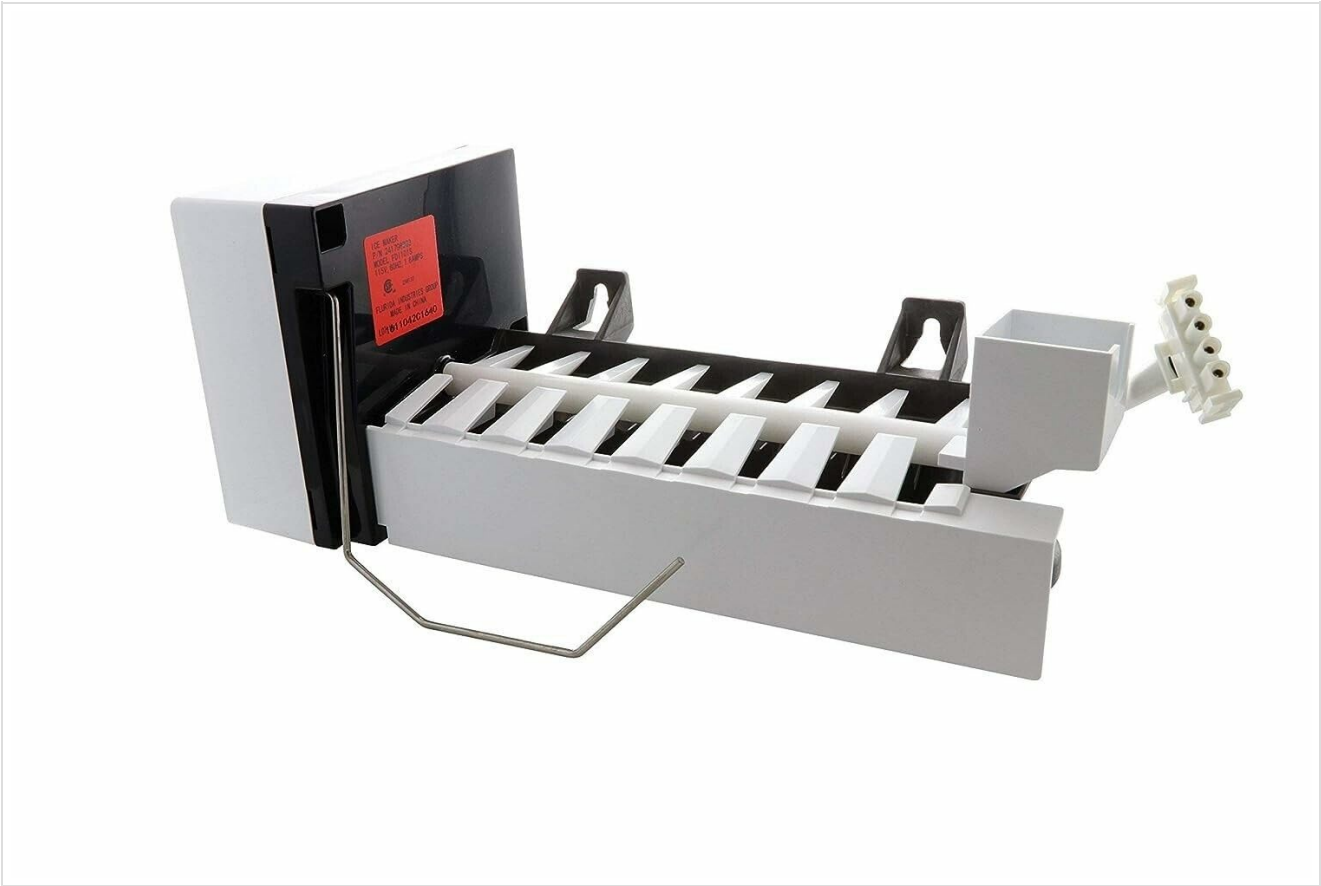
Figure 3: Front view of the Generic LK65C Automatic Ice Maker Kit, showing the control panel (if present) or the general front appearance. This view helps identify the ice maker's operational status or manual controls.