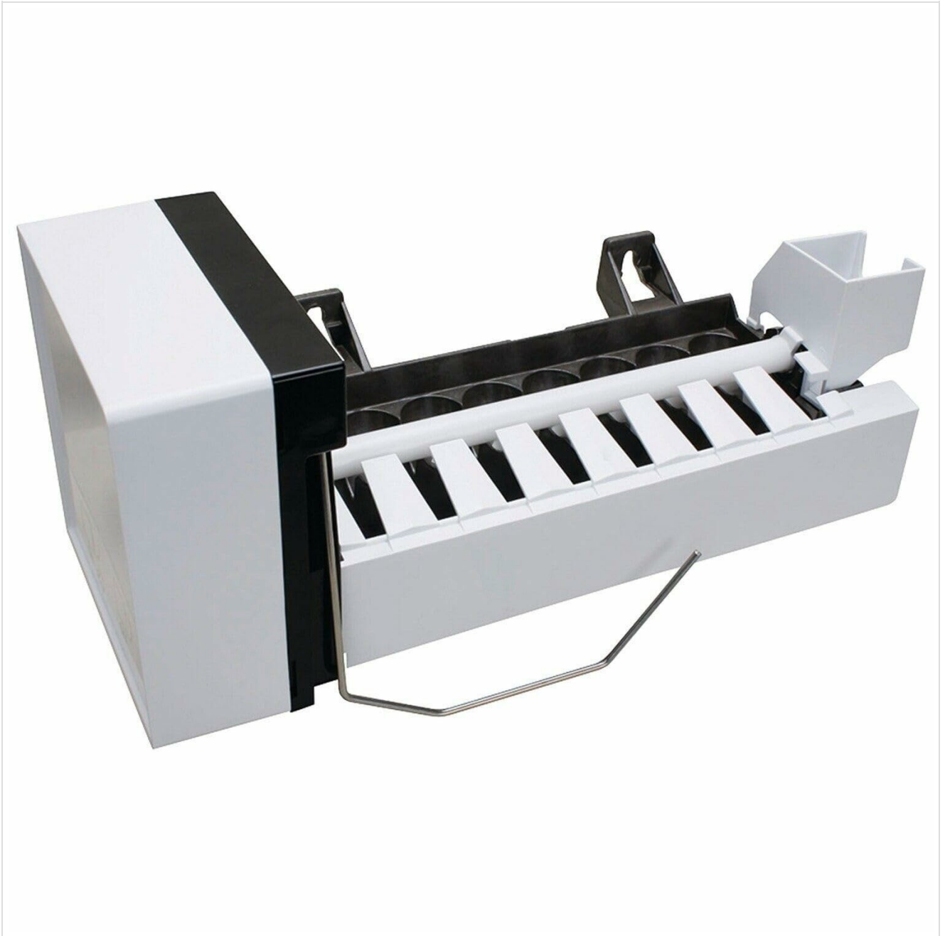
Figure 1: Front-side view of the Generic LK65C Automatic Ice Maker Kit. This image shows the main body, ice mold, and the wire shut-off arm in the down position.

Examine the new LK65C ice maker kit for any visible damage. Ensure all components are present as shown in the product images.