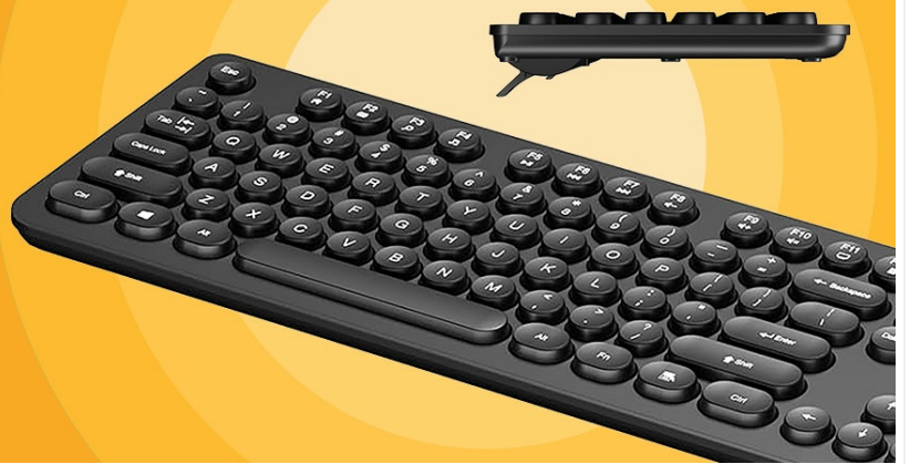
Image: Close-up of the keyboard's keycaps, illustrating its design for easy cleaning.

Designed to match your workflow, this keyboard offers all-day comfort. With an ergonomic build and effortless navigation, it's made to keep you in sync.