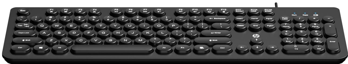
Image: HP K270 Wireless Keyboard, showcasing its full layout.

The HP K270 Wireless Keyboard is designed to provide a comfortable and efficient typing experience. This keyboard features a reliable 2.4 GHz wireless connection, vintage round keycaps, and integrated multimedia controls, making it suitable for various computing tasks. This manual provides essential information for setting up, operating, maintaining, and troubleshooting your keyboard.