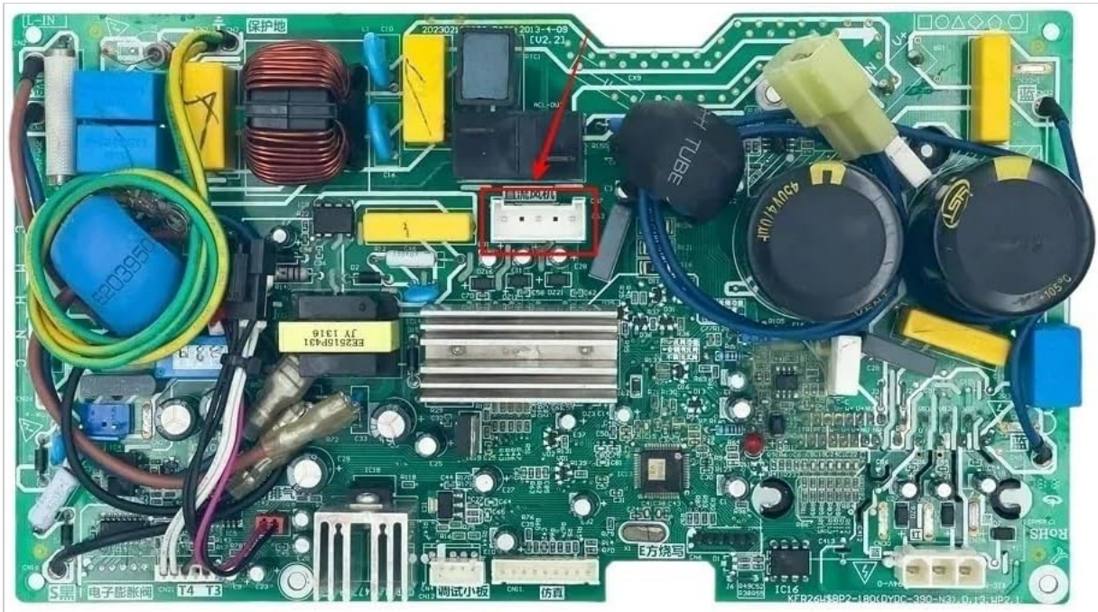
Figure 1: Top-down view of the control board, showing various components and connectors.