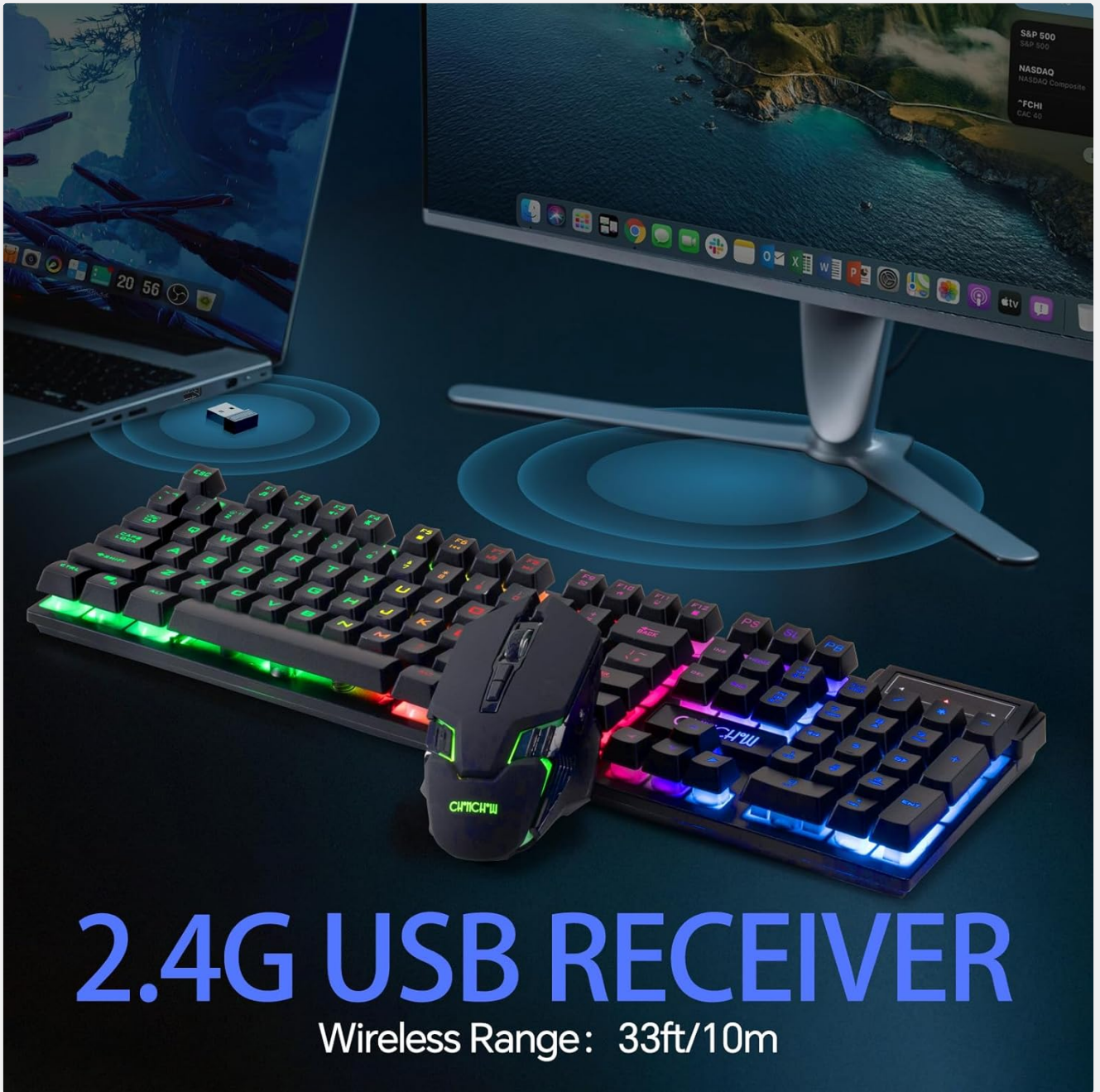
Image: The CHONCHOW G220 Wireless Keyboard and Mouse Combo, showcasing its rainbow LED backlighting and ergonomic design.