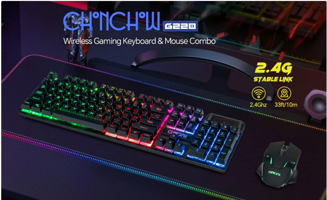
Image: A visual representation of the 2.4G USB receiver plugged into a laptop, demonstrating the wireless connection range of up to 10 meters (33 feet) for the keyboard and mouse.