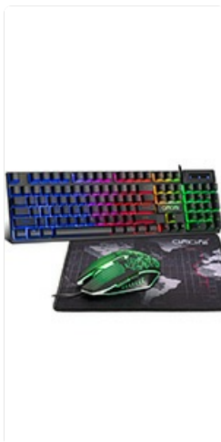
Image: A close-up of the keyboard highlighting the multimedia function keys (F1-F12) and the key combinations for WIN lock and WASD/arrow key exchange.