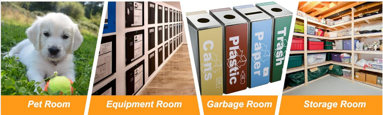
Image: Examples of shed usage: pet room, equipment storage, garbage collection, and general storage.

Your browser does not support the video tag.