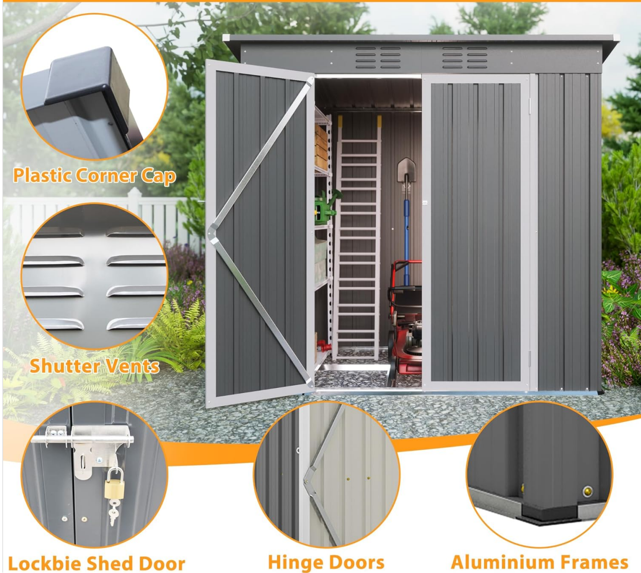
Image: Detailed view of shed features: plastic corner caps, shutter vents, lockable hinged doors, and aluminum frames.