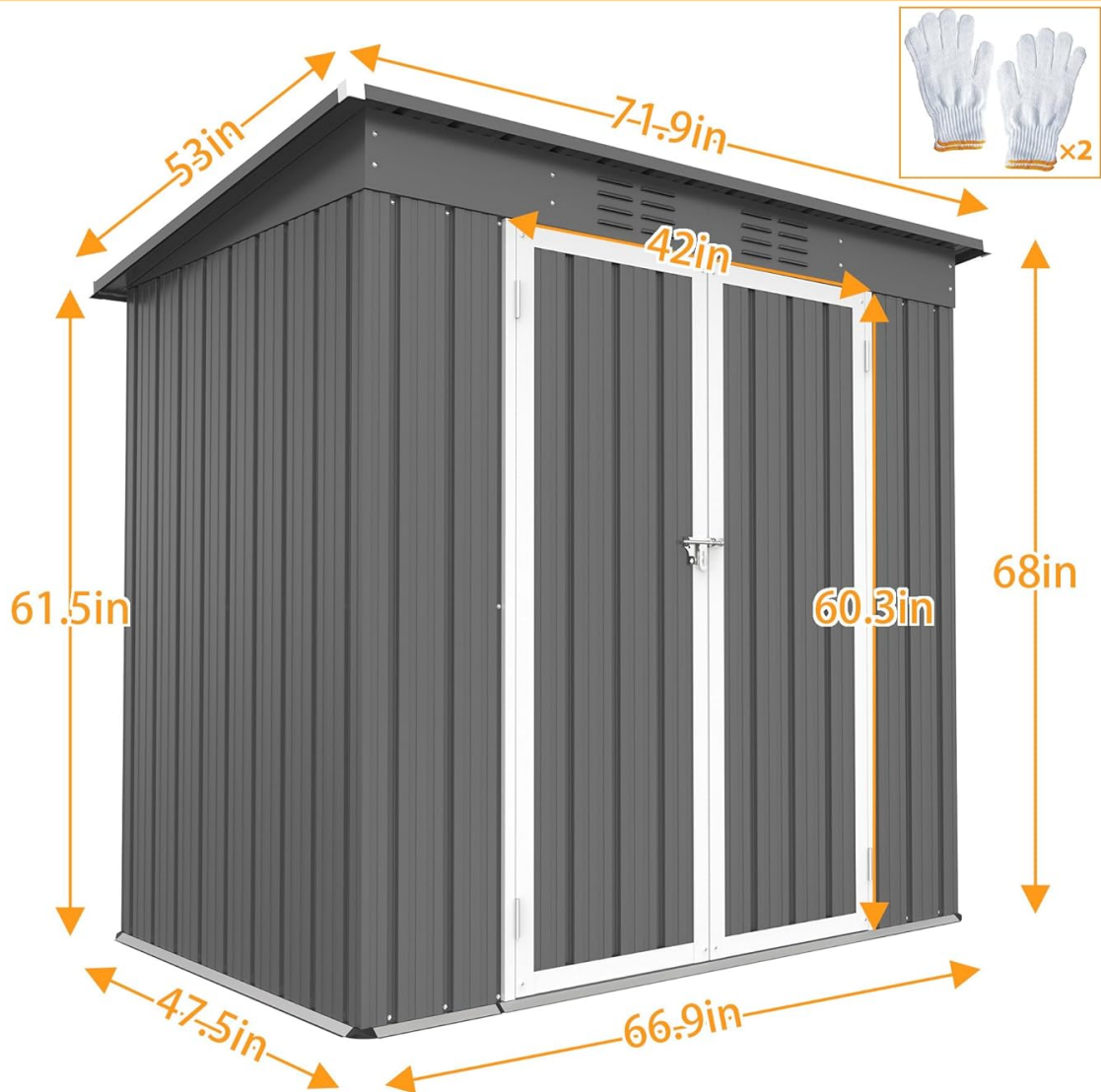
Image: Isometric view with overall and door dimensions.